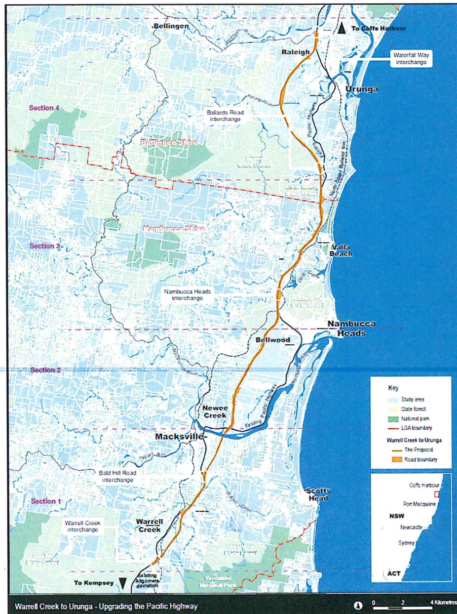
Figure 1: Project Layout

The Pacific Highway Upgrade – Warrell Creek to Urunga (07_0112) was approved by the Minister for Planning and infrastructure on 19 July 2011 under Part 3A of the Environmental Planning and Assessment Act 1979 (the Act). The approved project, referred to as the Warrell Creek to Urunga upgrade, involves an upgrade of the Pacific Highway between Warrell Creek and Urunga to dual carriageways, a distance of approximately 42 kilometres in the Nambucca and Bellingen local government areas. The project is being delivered in two stages, with construction of the 22 kilometre section between Nambucca Heads to Urunga commencing in early 2014. Construction of the 20 kilometre section from Warrell Creek to Nambucca Heads is anticipated to commence in early 2015. The project location and layout is shown in Figure 1 .