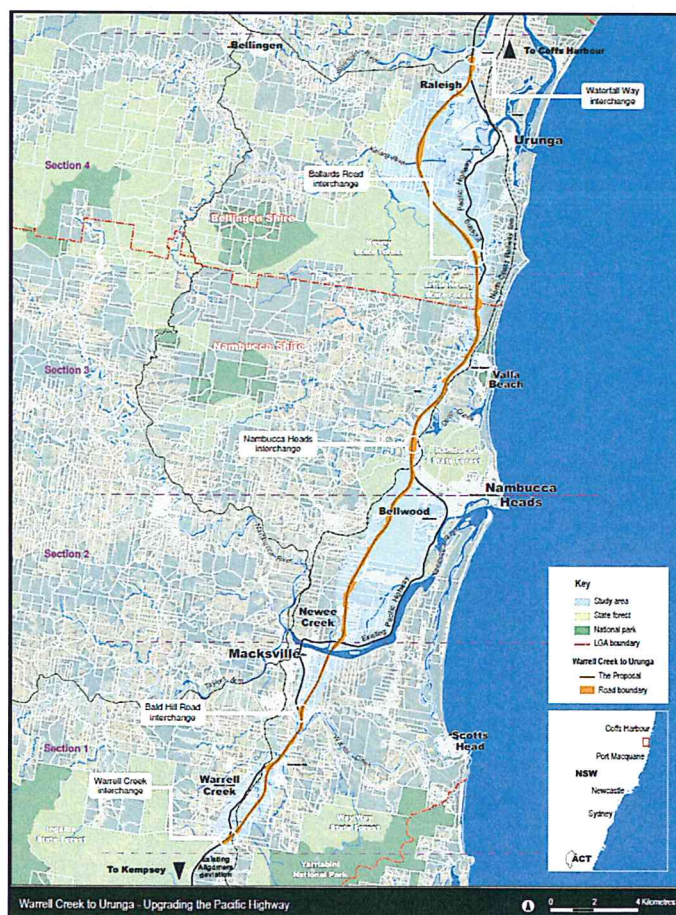
Figure 1: Project Layout