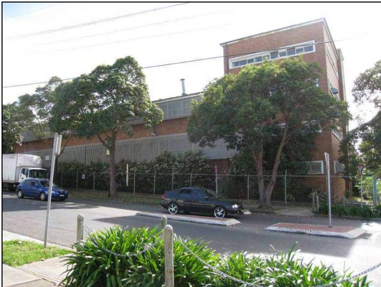
Photo 4: Existing 4 storey building at corner of Charlotte and Harp Streets

The site includes factory and ancillary buildings which were vacated in August 2002 by the former Sunbeam Factory. The manufacturing operations of the Sunbeam Corporation (and its predecessors) took place on the site from 1954 until this date. Part of the site is currently occupied on a temporary lease basis by individual industrial operators.