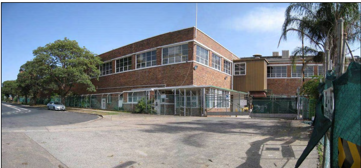
Photo5: Existing buildings on corner of Harp and Alfred Street