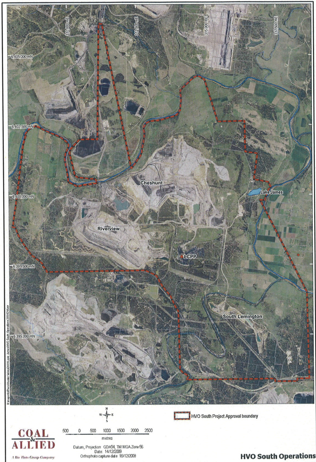
Figure 2: Amended Project Application Area