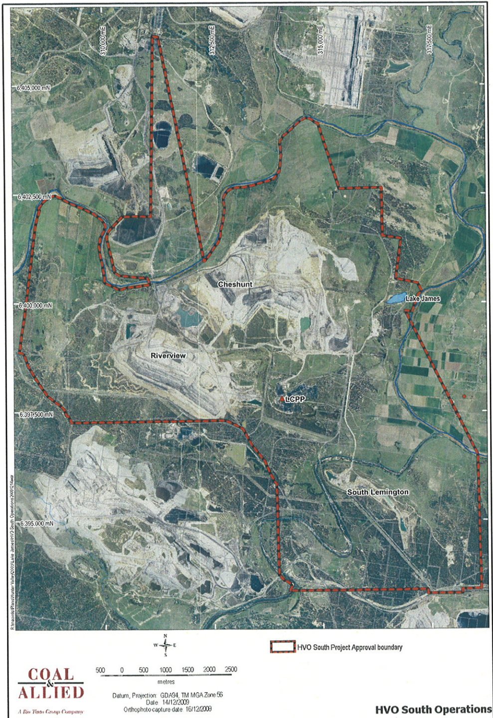
Figure 2: Amended Project Application Area