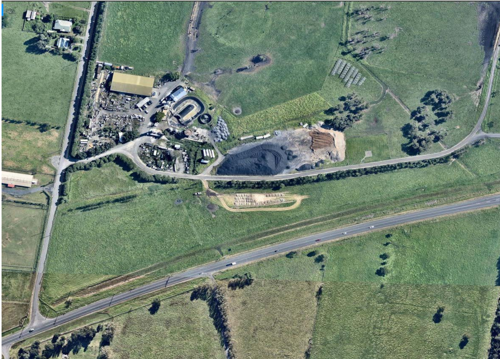
Regularise and Expand Existing Coal and Woodchip Storage on Environmental Farm