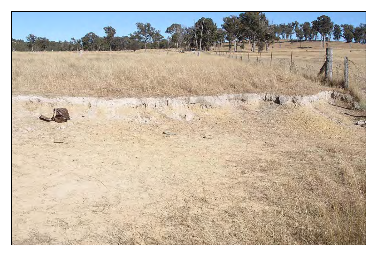
Figure 8 – The bag marks the artefact find-spot at "GL ISO2".