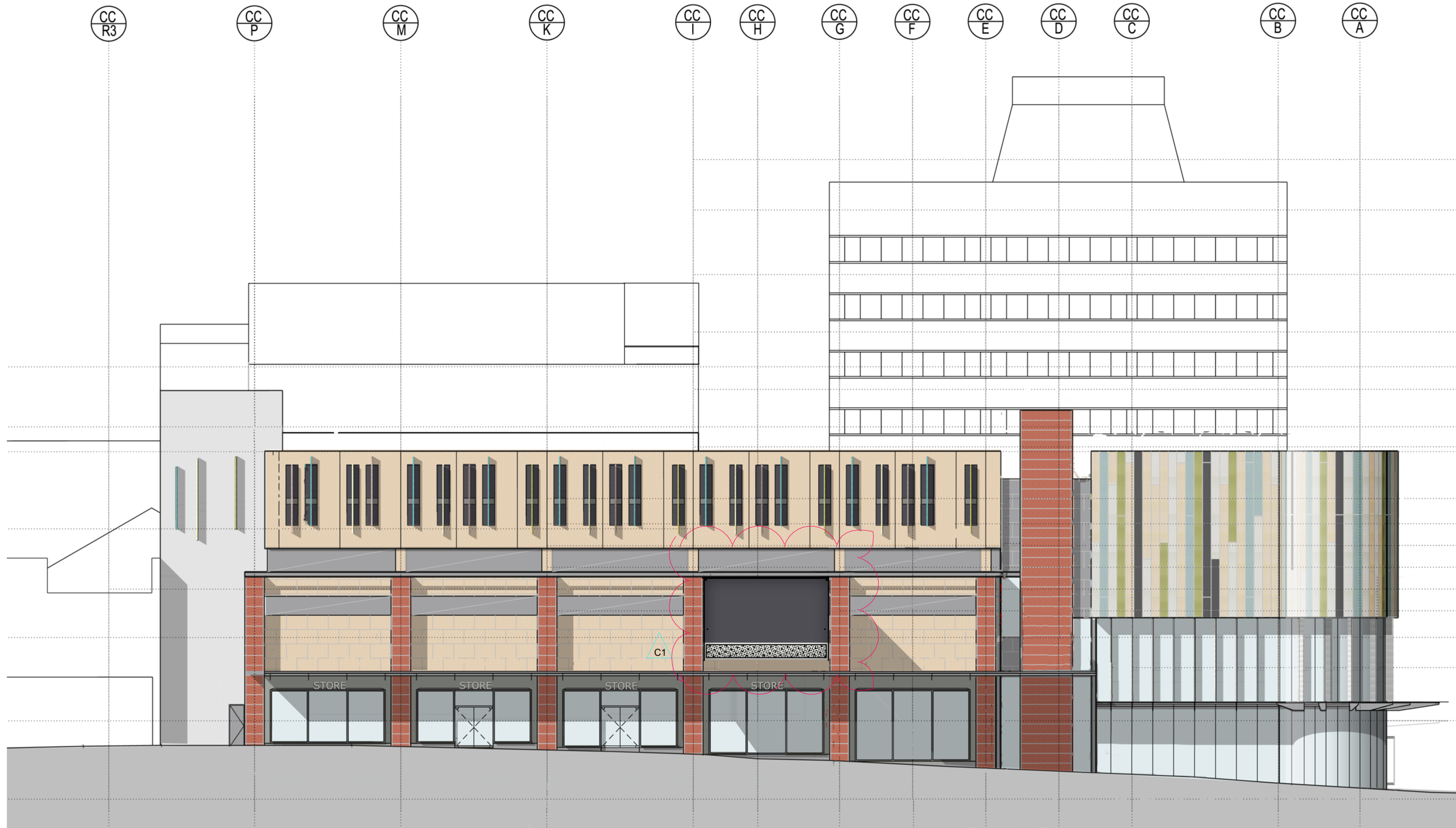
1 ELEVATION KEIRA ST 1:200 @B1