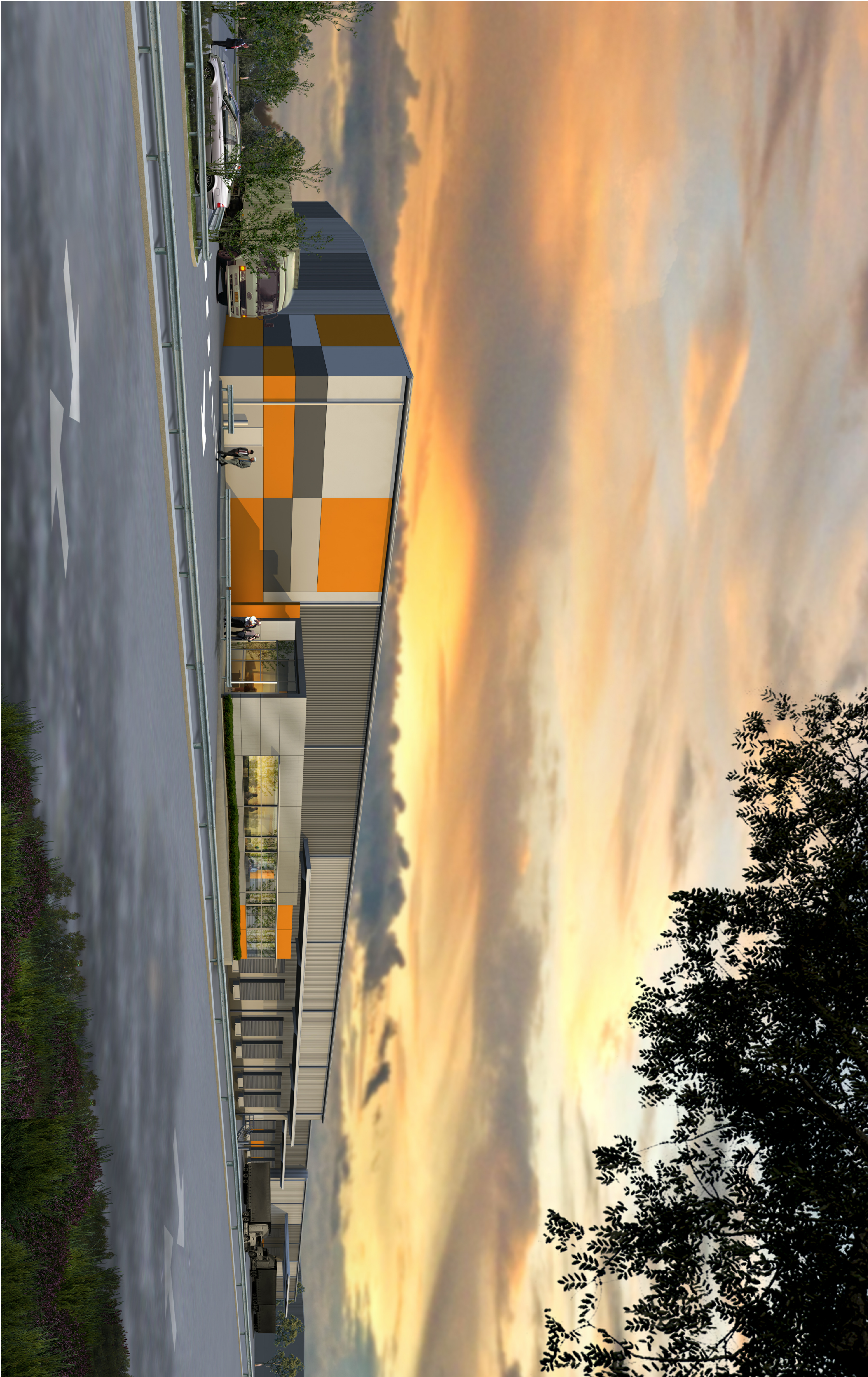
01 NORTH/EAST PERSPECTIVE NOT TO SCALE