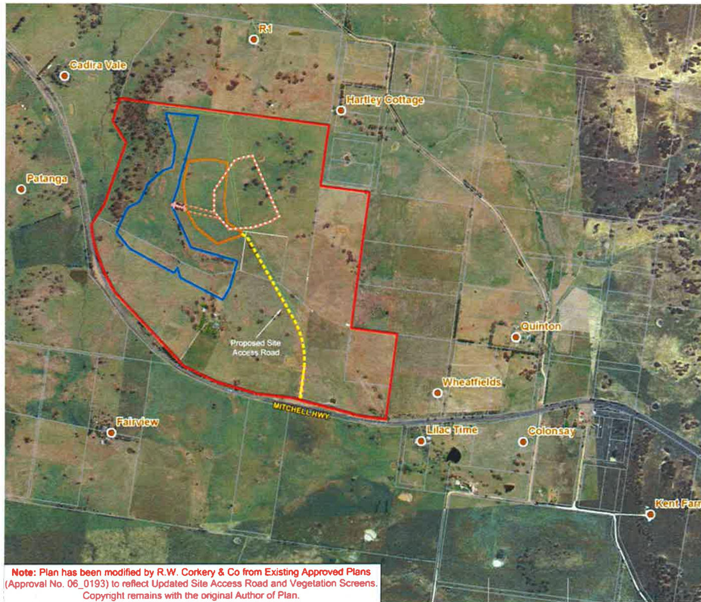
FIGURE: 3 EAST GUYONG QUARRY EAR & PREFERRED PROJECT NEIGHBOURING RESIDENCES