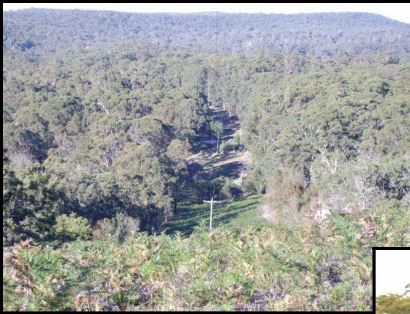
Looking south along existing electricity lines