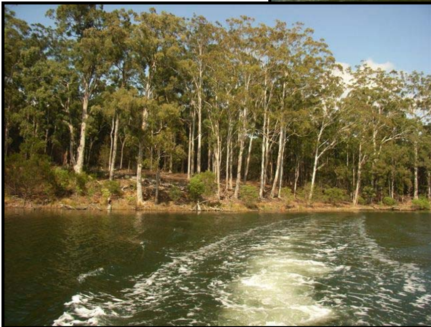
Looking south at approximate common boundary