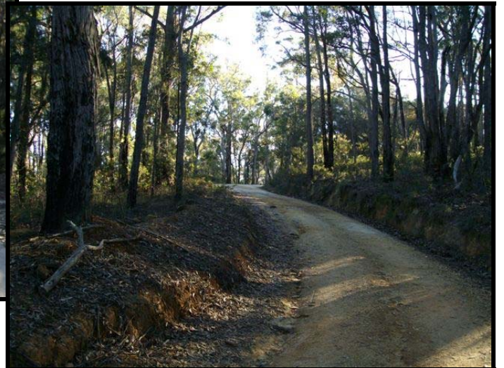
Approx Location of Proposed Passing Bay No. 4