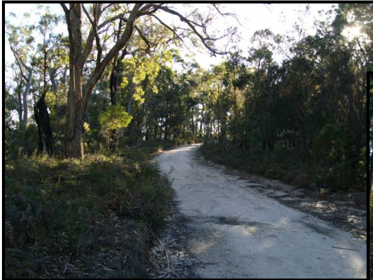
Approx Location of Proposed Passing Bay No. 3