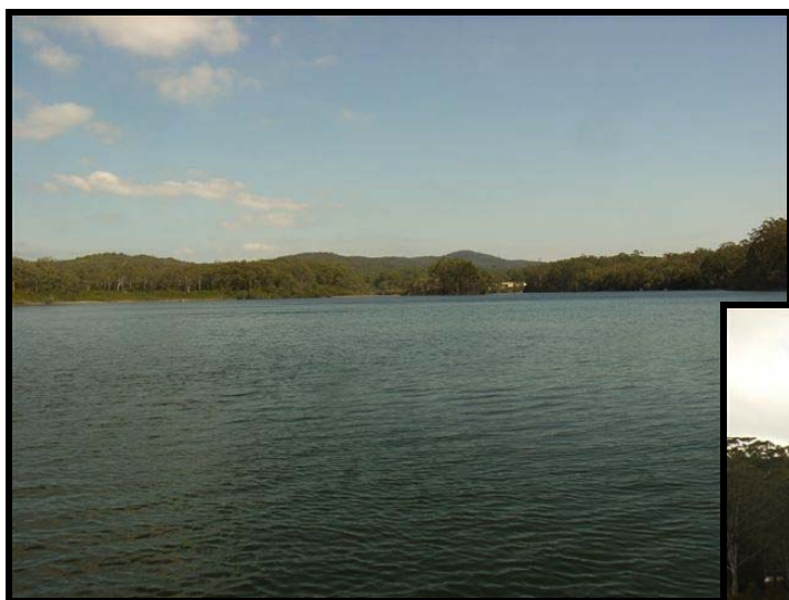
Property to the north of Lots 5 and 6 (across Wonboyn River) Doyle, Owner