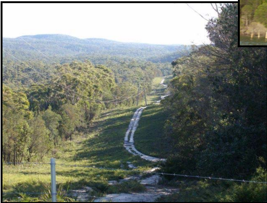
Looking north along existing electricity lines with the subject property in background. (Note Telstra cabling is also believed to run on this line).