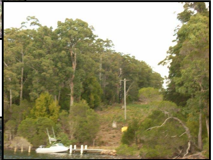
Electricity Lines within Lot B (to be underground from these lines to Lots 1 and 2