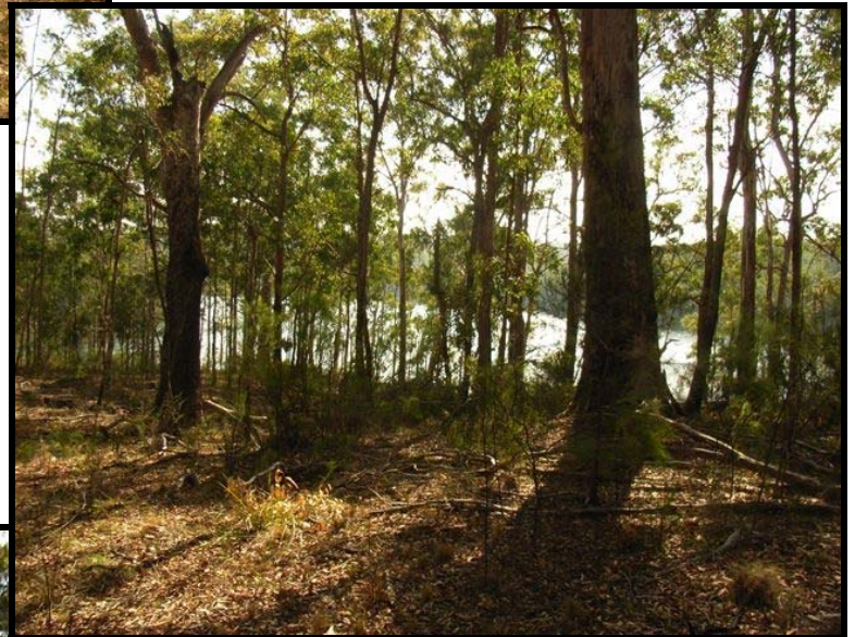
Looking north from Lot 1