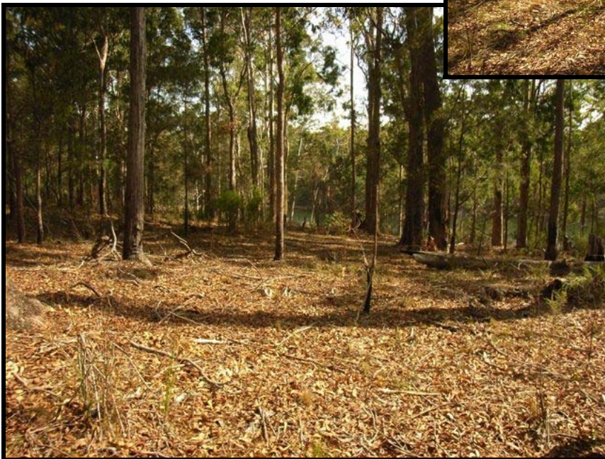
Looking west across Lot 2