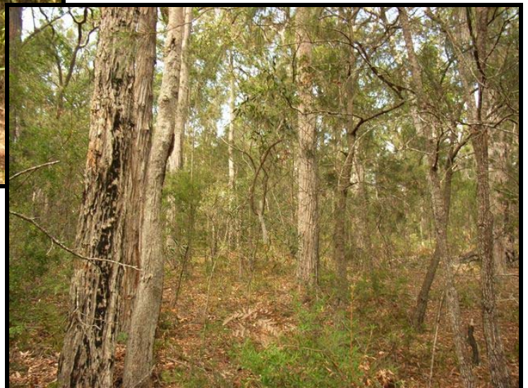
Typical Vegetation within Lots 5 and 6