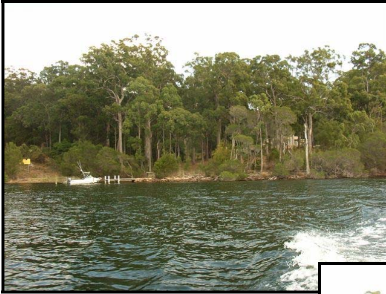
Existing Dwelling and Jetty on Lot B