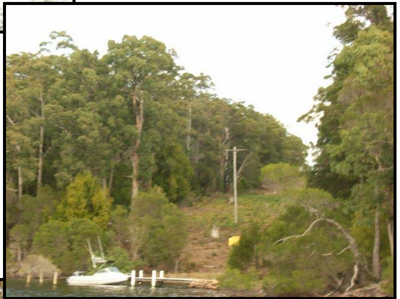
Jetty on Lot B