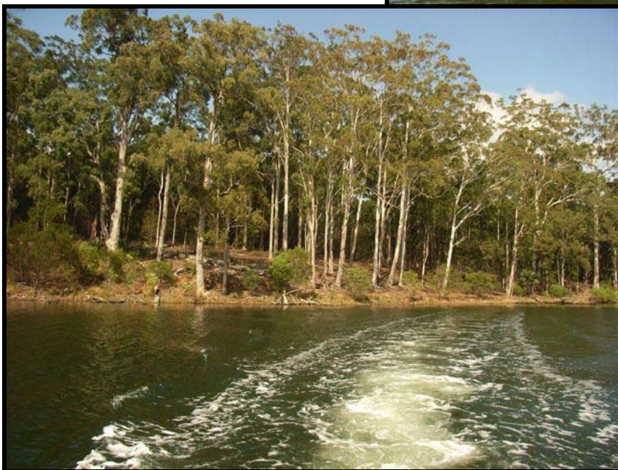
Looking south at approximate common boundary