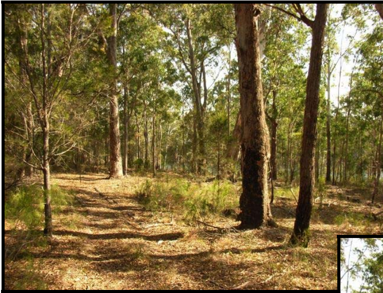
Looking west at approximate common boundary