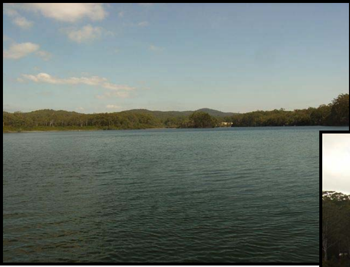
Property to the north of Lots 5 and 6 (across Wonboyn River) Doyle, Owner