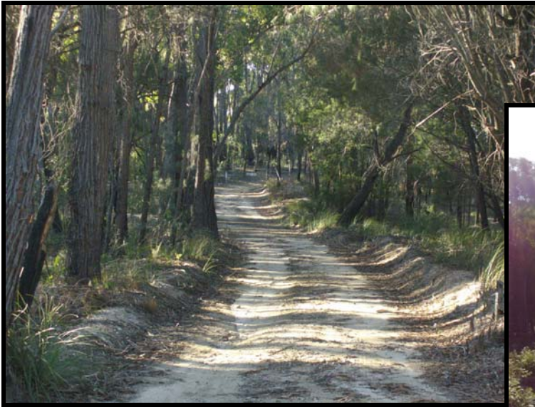
Proposed Passing Bay No. 1