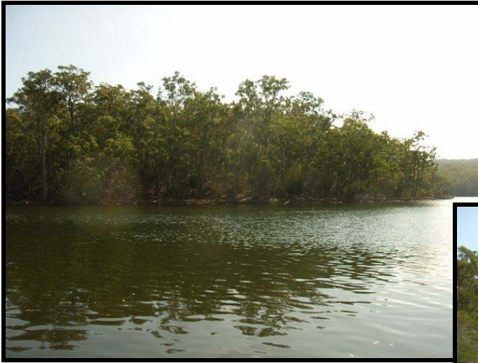
Looking northwest towards Lot 3