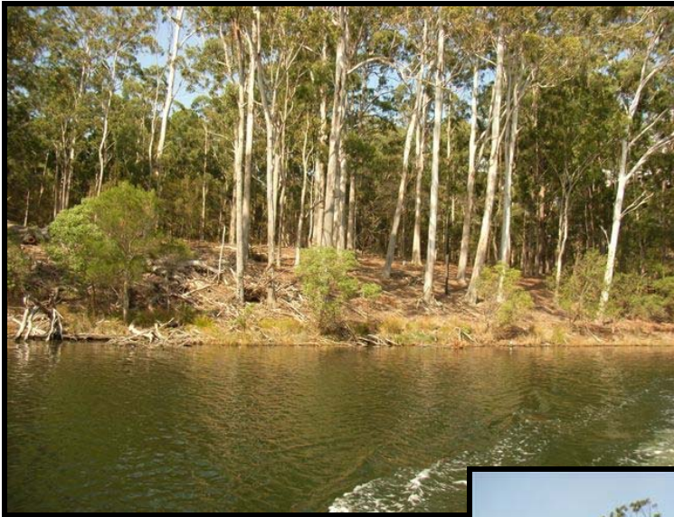
Looking south towards Lot 2