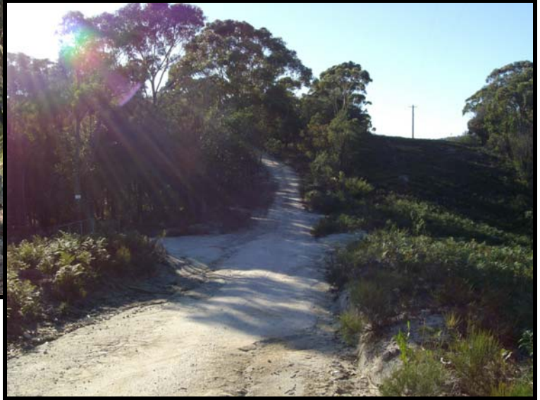
Proposed Passing Bay No. 2