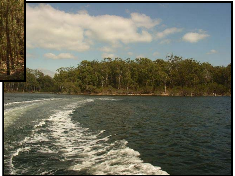
Looking west towards the lots