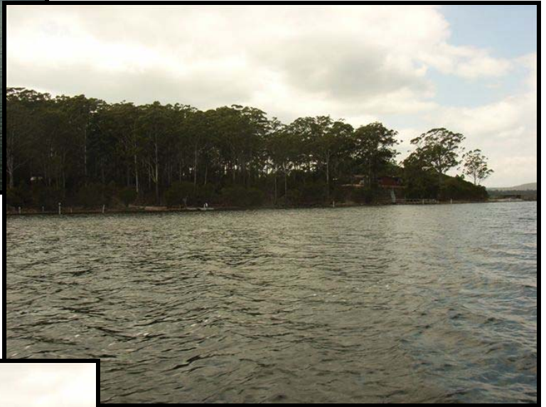
Property to the east of Lot B Dowsley, Owner