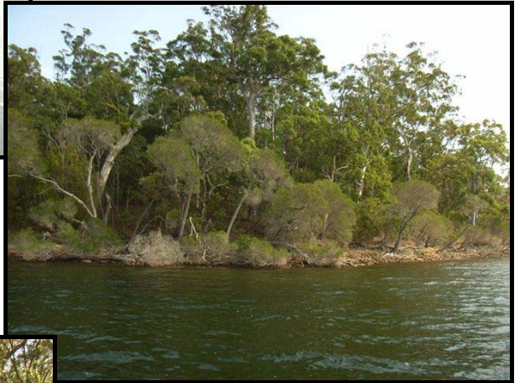
Looking west at the boundary of Lots 3 and 4