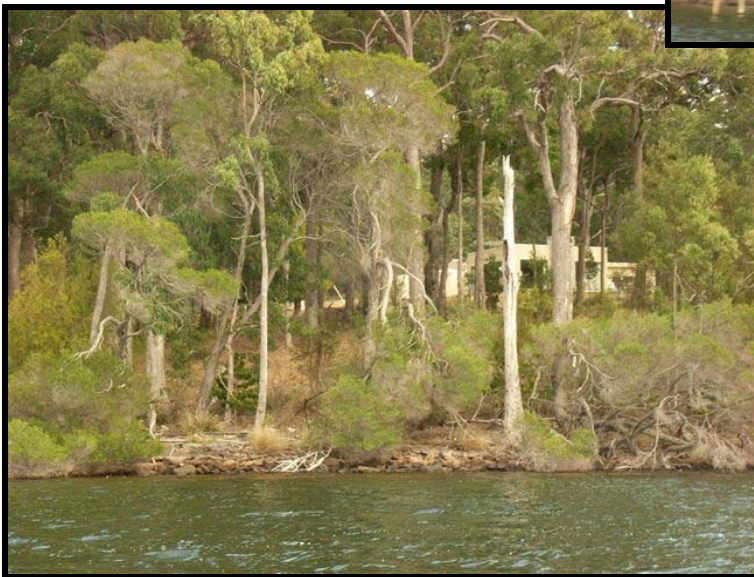
Existing Dwelling on Lot B