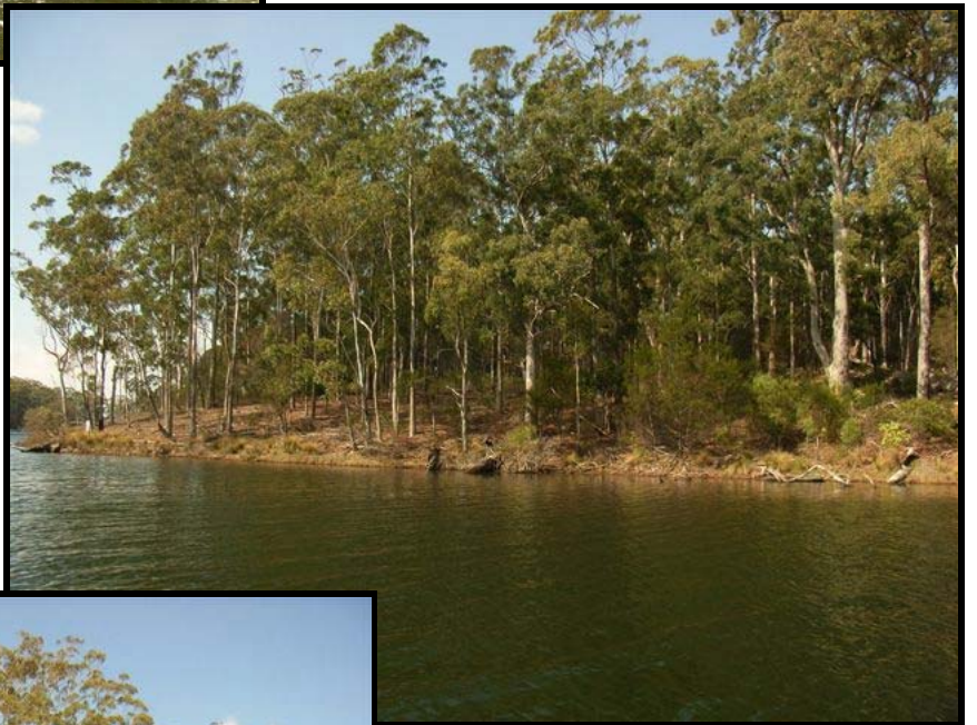
Looking south towards Lot 1