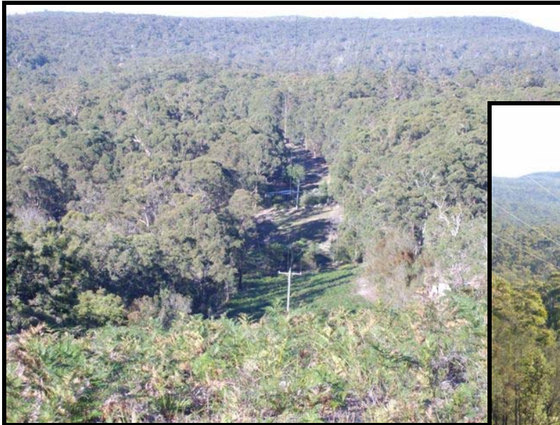
Looking south along existing electricity lines