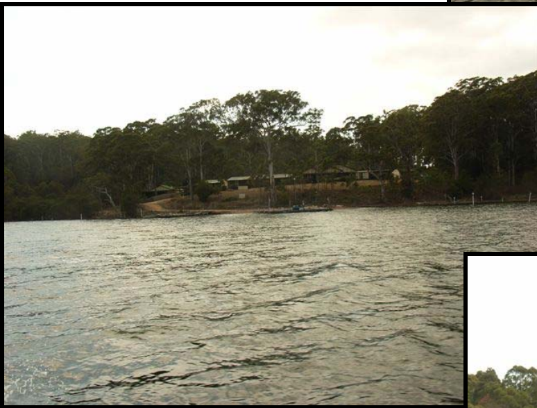
“Wonboyn Lake Resort” Located to the east of Lots 1 and 2 Foxwell & Robin, Owner