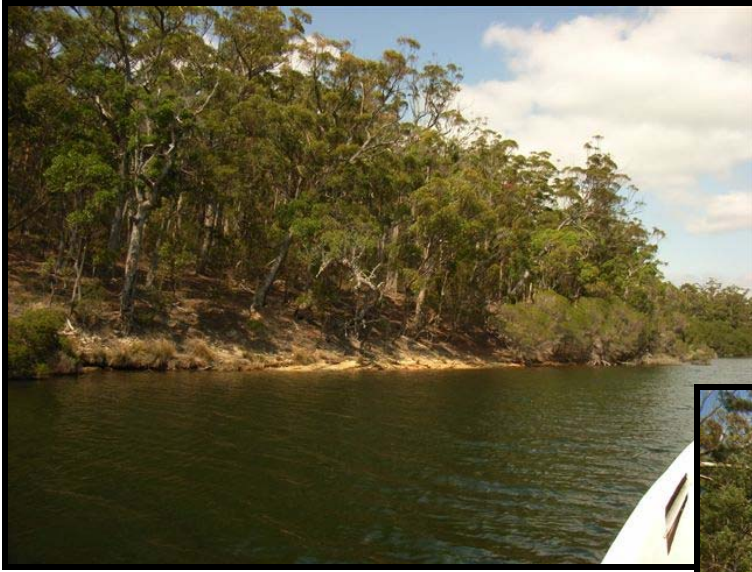
Looking west across river frontage of Lots 5 and 6