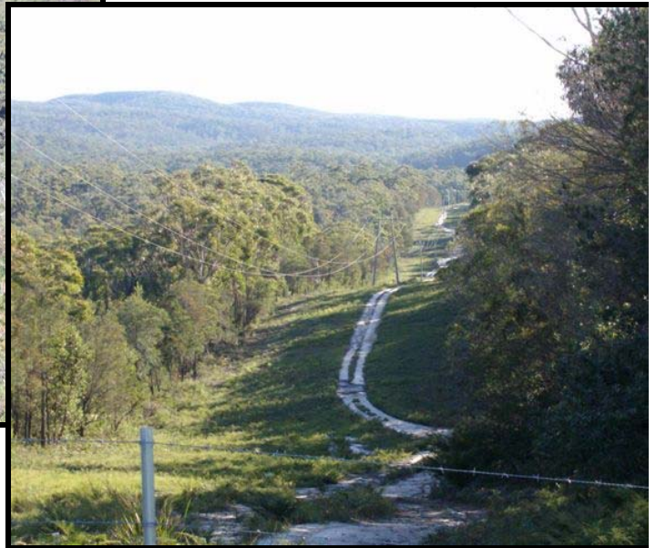
Looking north along existing electricity lines with the subject property in background, also showing "loop" track access