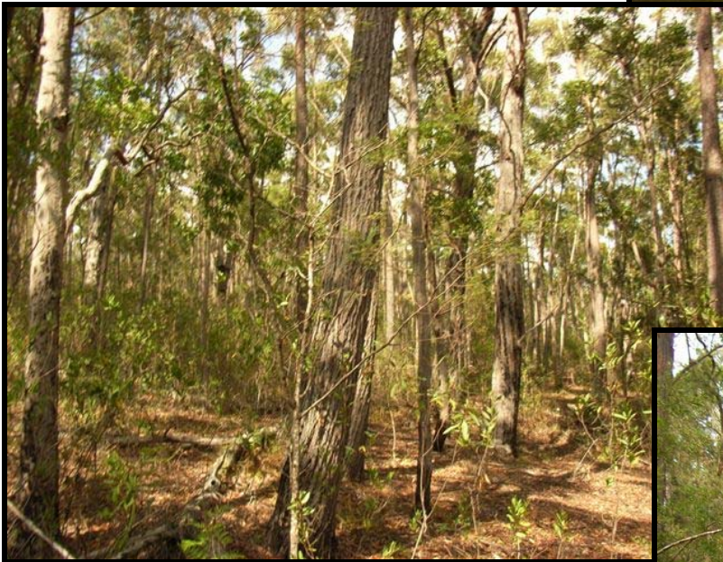
Typical vegetation within Lots 5 and 6