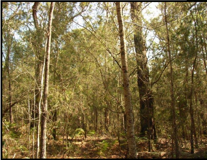
Typical Vegetation within Lots 3 and 4