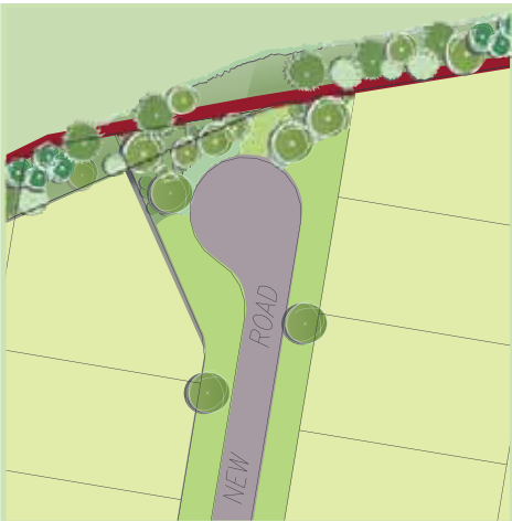
1 Buffer planting and emergency access