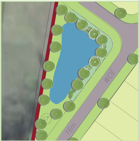
2 Reserve area with storm water basin and planting