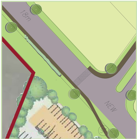
5 Bike and pedestrian path crossing to recreation area