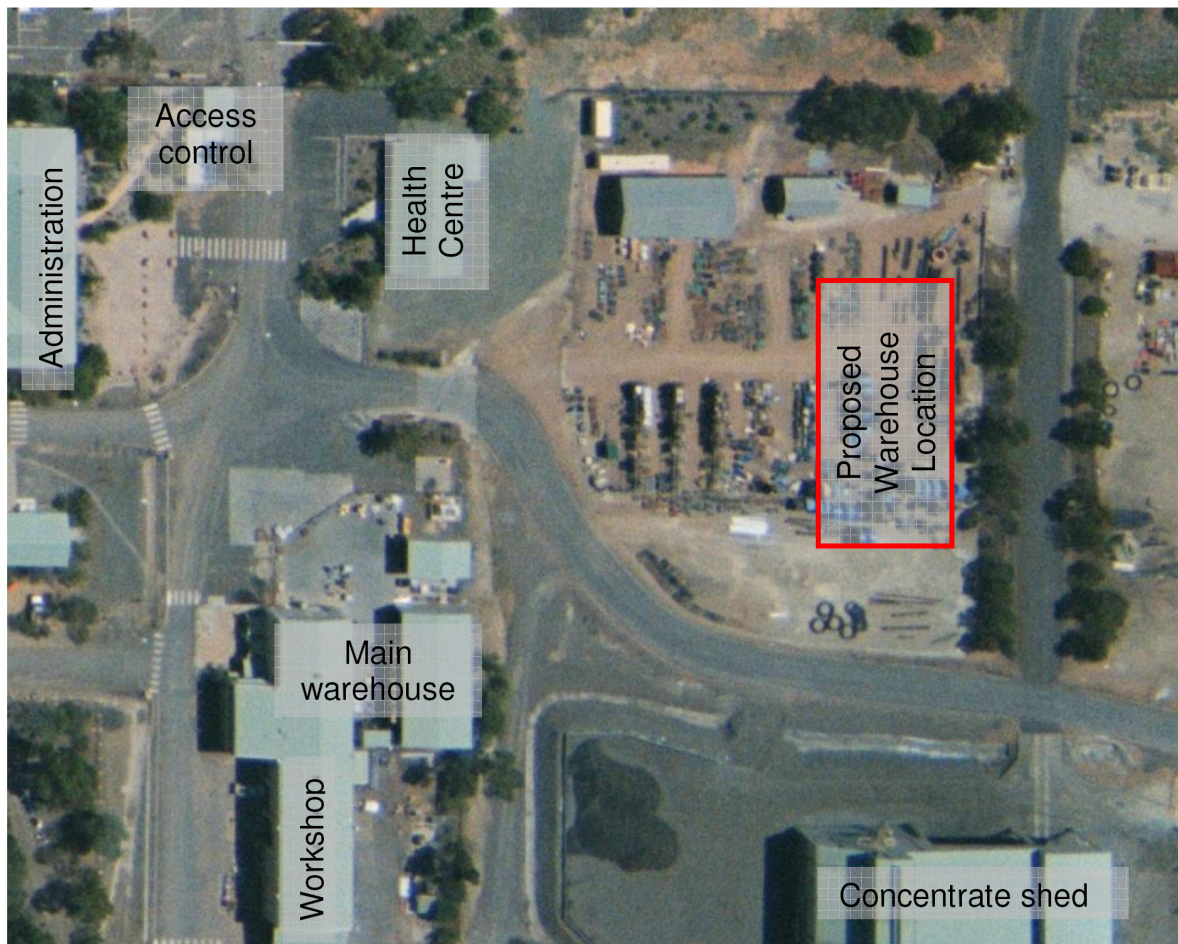
Figure 2: Location of proposed warehouse

North is proposing to establish a 1200 square metre (m 2 ) covered warehouse and adjacent vehicle unloading area in the open storage area adjacent to the mine's processing facilities (see Figure 3). This would enable North to store all equipment for the mine on site (it currently leases a warehouse in Parkes to store some equipment).