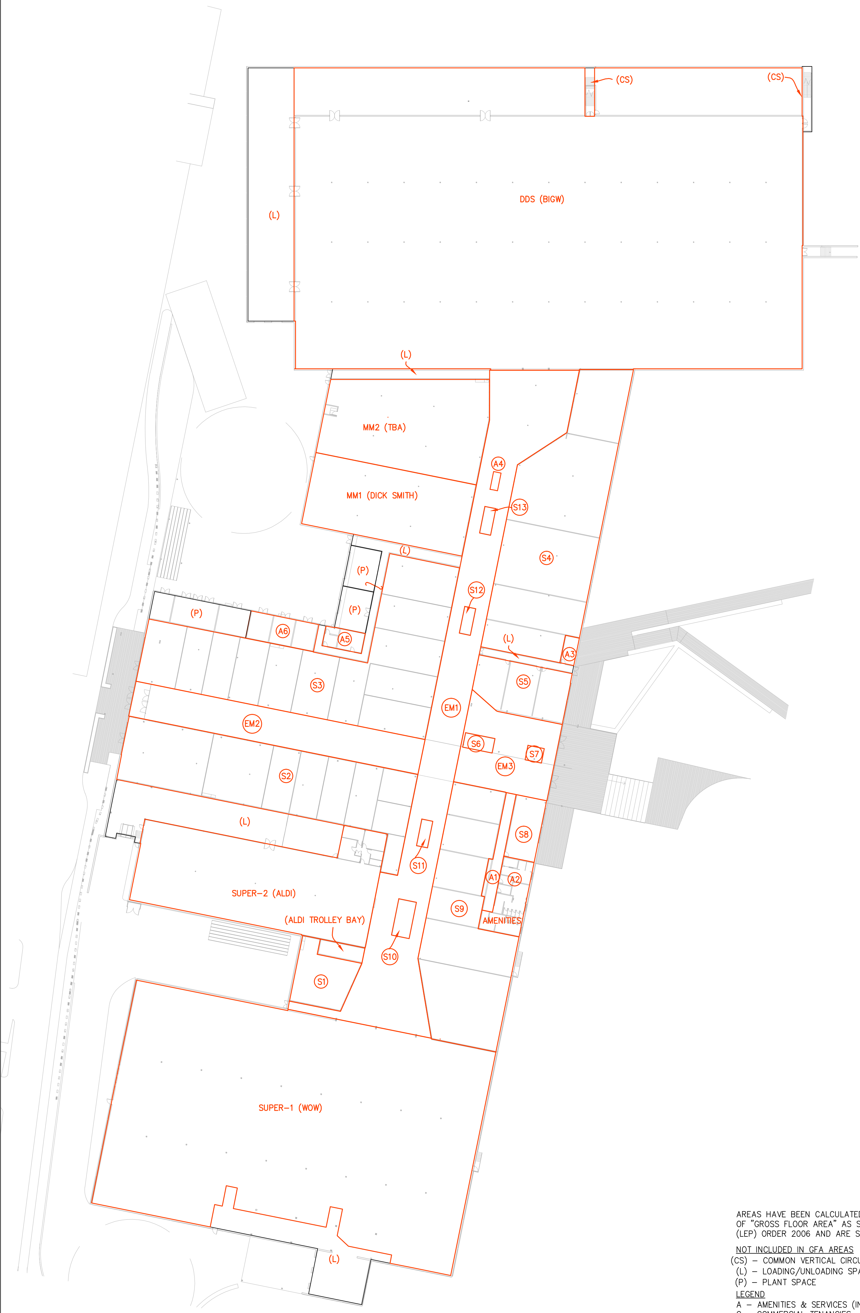
STAGE 1 GROUND FLOOR

AREAS HAVE BEEN CALCULATED IN ACCORDANCE WITH THE DEFINITION OF "GROSS FLOOR AREA" AS SPECIFIED IN THE STANDARD INSTRUMENT (LEP) ORDER 2006 AND ARE SUBJECT TO FINAL SURVEY. NOT INCLUDED IN GFA AREAS (CS) - COMMON VERTICAL CIRCULATION (STAIRS) (L) - LOADING/UNLOADING SPACE (P) - PLANT SPACE LEGEND: A - AMENITIES & SERVICES (INCL. STORAGE, CENTRE MAN., SECURITY, PARKING & FOOD TERRACES) C - COMMERCIAL TENANCIES EM - ENCLOSED MALL S - SPECIALTY SHOPS LOADING AREAS HAVE BEEN CALCULATED TO THE INTERNAL FACE OF TENANCY WALLS PLANS USED IN PREPARATION OF THESE AREAS PROJ. NO.20110128 DWS NO. AP001 ISSUE A