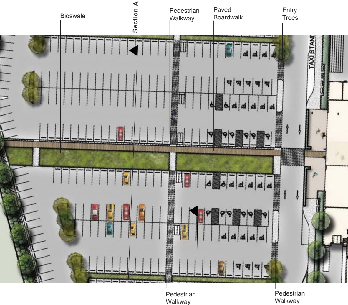
B. CARPARK DETAIL PLAN - NTS