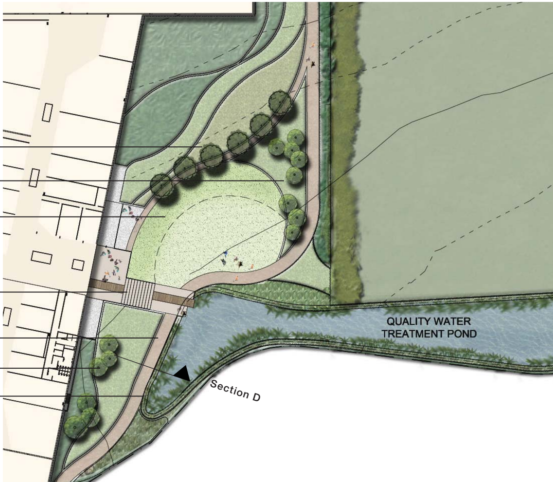
C. PLAN - NTS