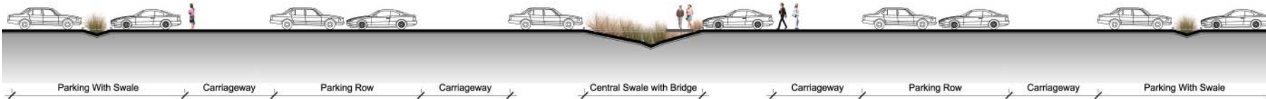
A. INDICATIVE SECTION THROUGH BOARDWALK - NTS