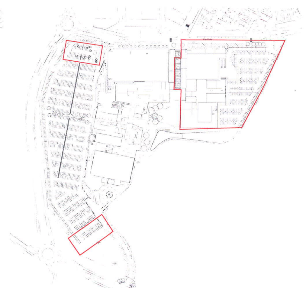
STAGE 2 PLAN