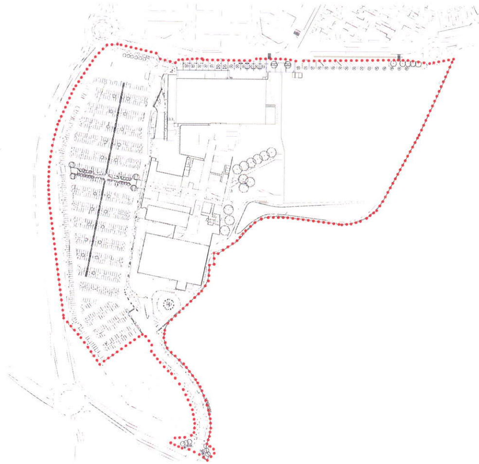
STAGE 1A PLAN