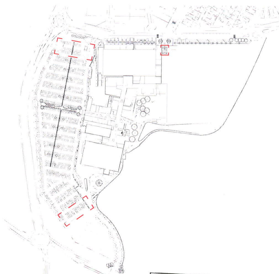
STAGE 1B PLAN