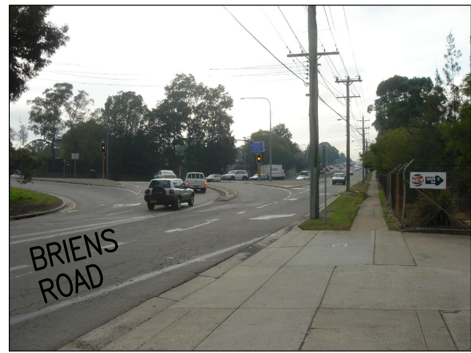
PHOTO 40 EXISTING SITE ENTRANCE OFF BRIENS ROAD FOR DEMOLITION ACCESS.