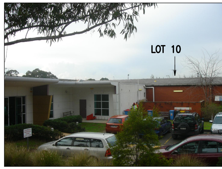
PHOTO 67 EXISTING FINANCE AND EQUIPMENT SERVICES BUILDING - LOT 10. SITE FOR NEW HIGH BAY BUILDING.