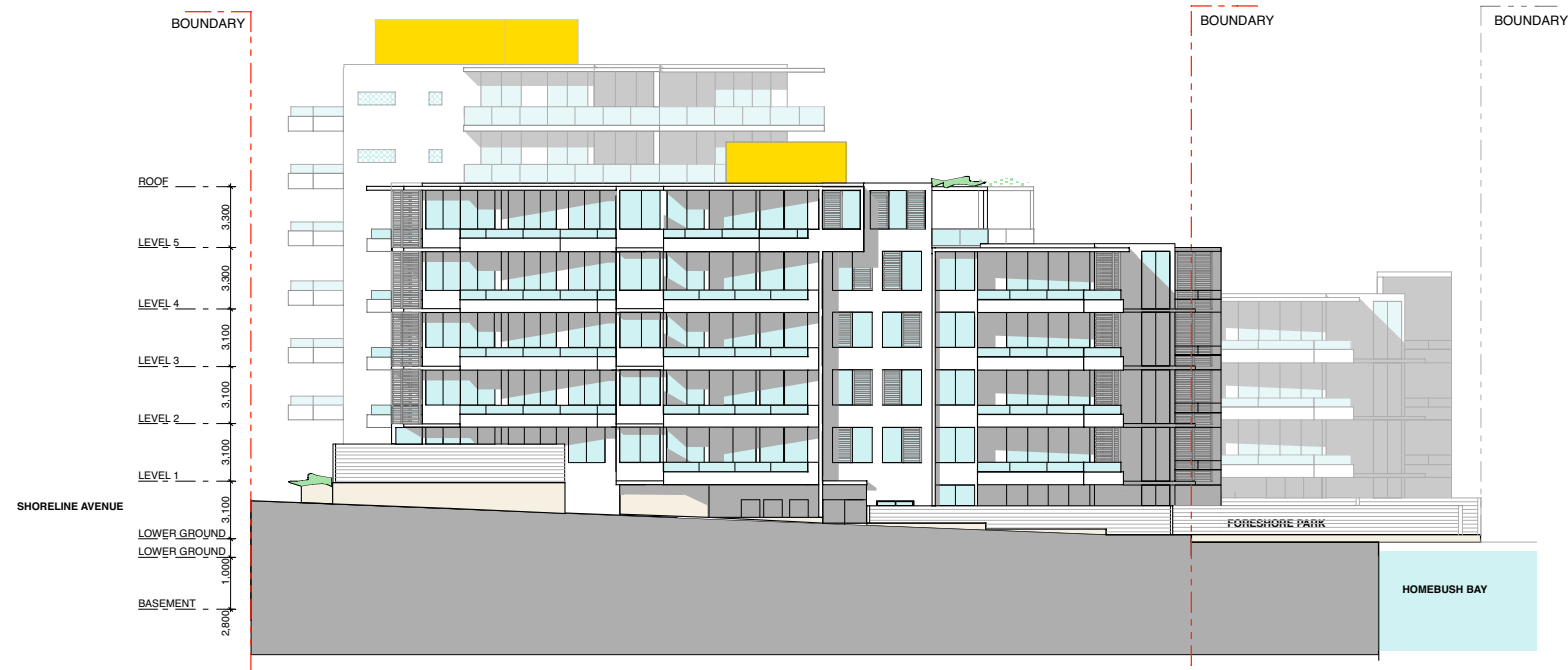
NORTH ELEVATION BUILDING 2