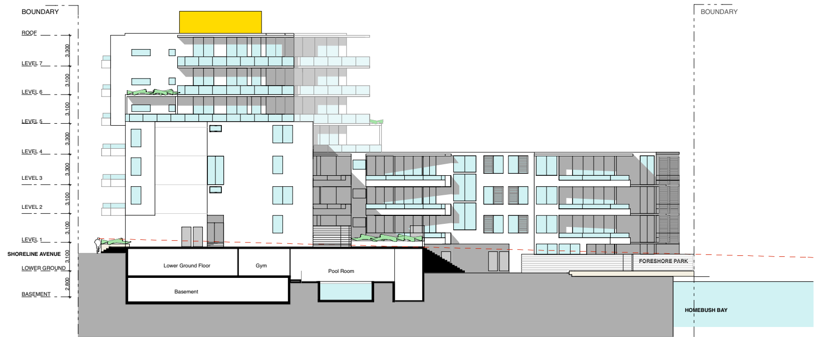
NORTH ELEVATION 2 BUILDING 1