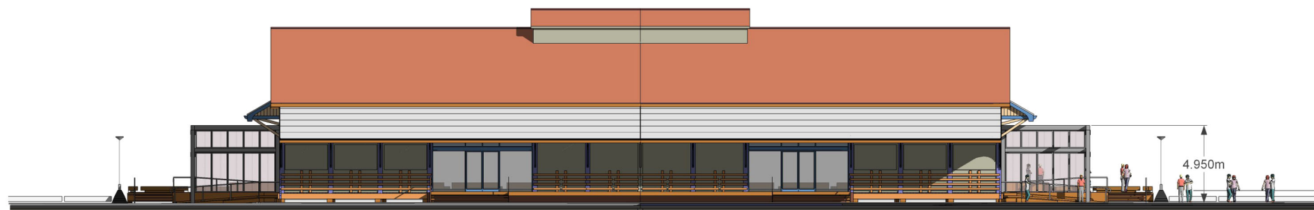
SOUTH ELEVATION FROM CONCOURSE AND HONEYSUCKLE DRIVE