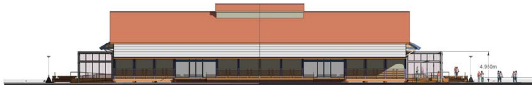
SOUTH ELEVATION FROM CONCOURSE AND HONEYSUCKLE DRIVE