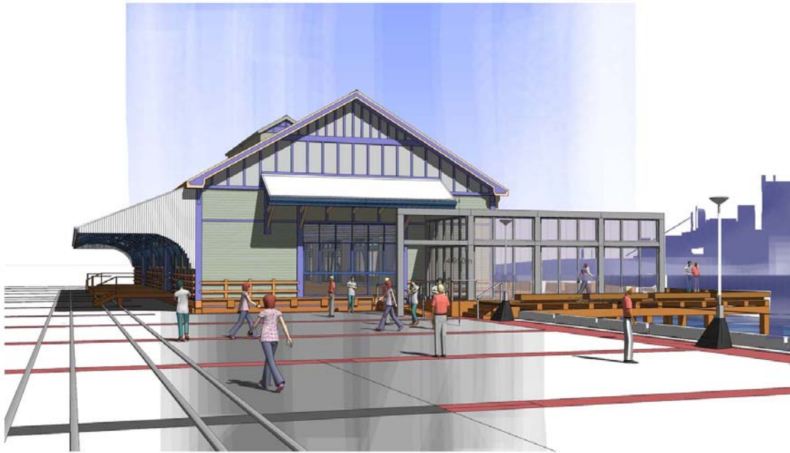
VIEW FROM CONCOURSE