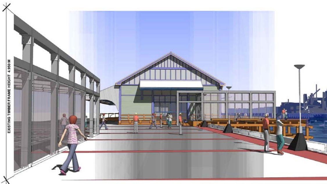
VIEW ALONG CONCOURSE SHOWING THE EXISTING PORTAL FRAMES TO THE HOGS BREATH BAR AND GRILL DINING ENCLOSURE AT LEFT