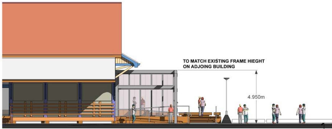
SOUTH ELEVATION ( PART ELEVATION. MIRRORED AT WESTERN END )