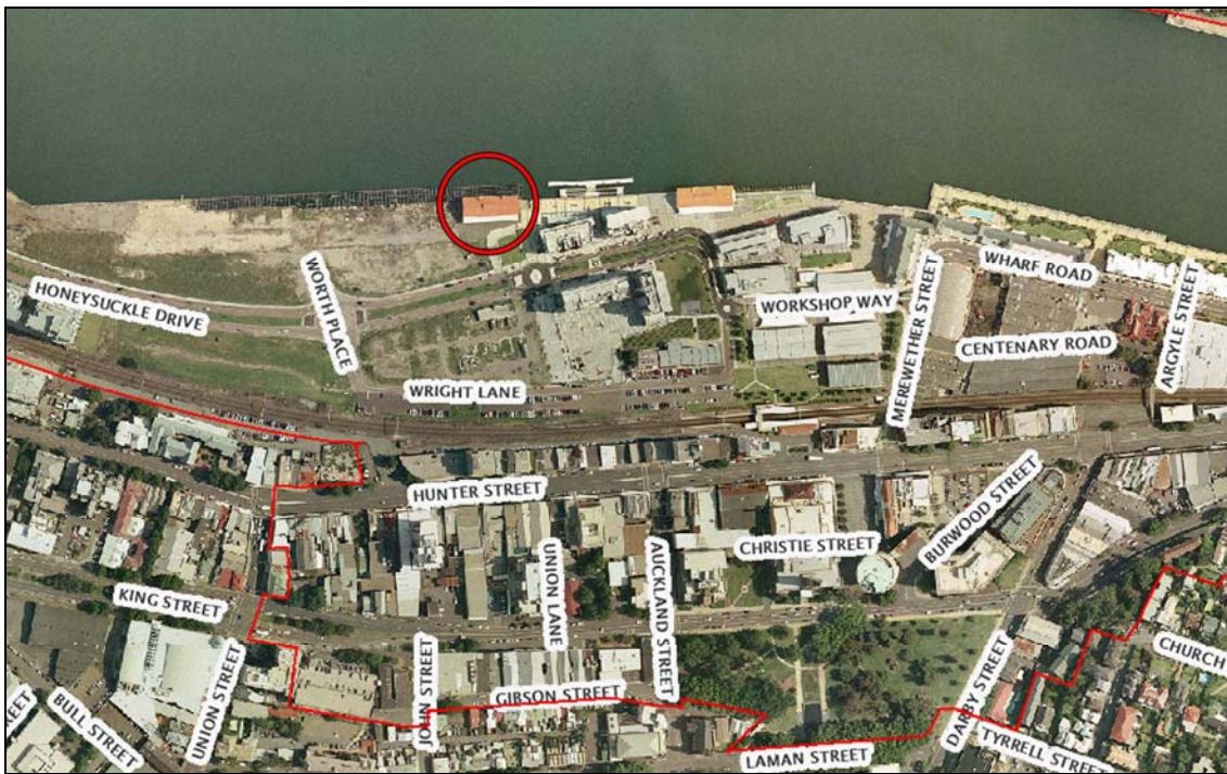
Figure 1: Site location circled red.