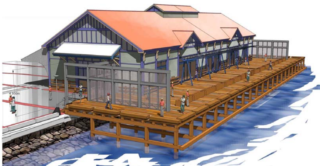
AERIAL VIEW FROM NORTH EAST