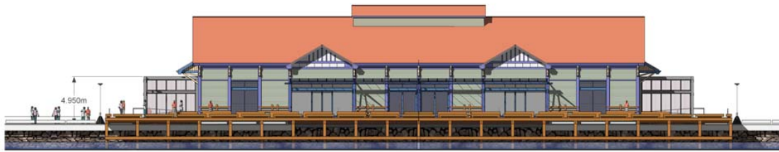
NORTH ELEVATION FROM HARBOUR