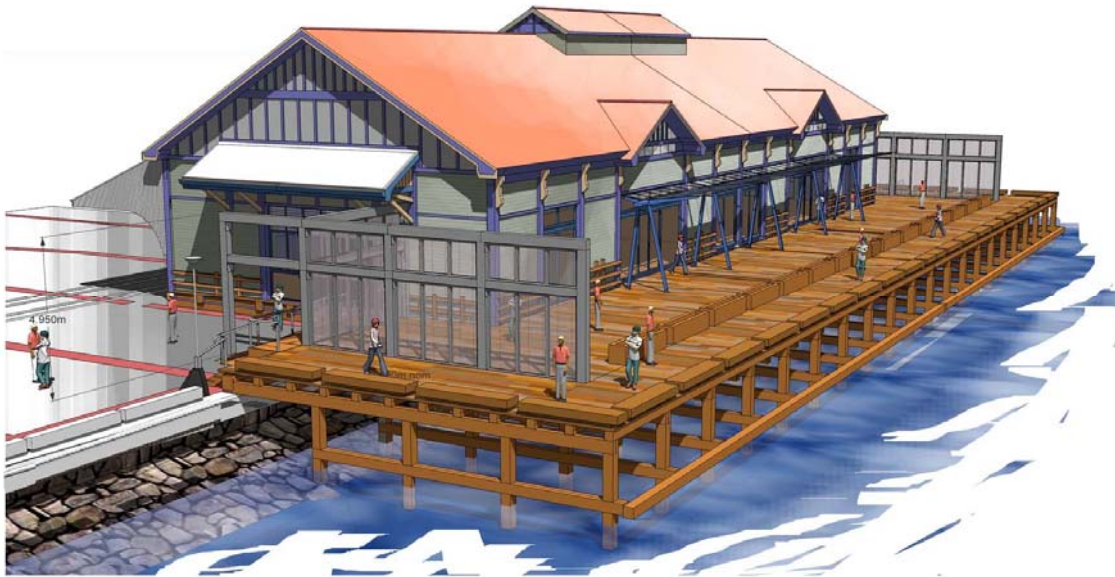
AERIAL VIEW FROM NORTH EAST

This Statement of Heritage Impact Addendum assesses the impacts the proposed acoustic screens to the wharf on the eastern and western elevations of Lee Wharf C (see architectural drawings) will have on the significance of the site. The proposed framing material is recycled wharf timbers with an infill of metal framed glazing and heritage interpretation of the site etched into the glass.