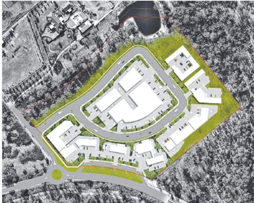
An artist's illustration of the business park proposed for Cecil Park.