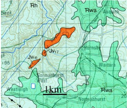
Figure 1: Geological map of the Hornsby region (from Herbert & West 1983: Sydney 1:100,000 Geological Sheet)

The authors appear to believe that the diatreme consists only of a rectangular section of the eastern wall of the quarry, as shown in their Figure 2. This interpretation is wrong, and displays a basic lack of understanding of geology. The quarry is in fact located <u>within</u> the diatreme (or in parts of two diatremes), and so the eastern face of the quarry represents a cross-section through a much larger structure. The Hornsby Diatreme in fact occupies a large area of land in and near Old Man Valley as shown in orange and marked JV17 in Figure 1 below, extracted from the Sydney 1:100,000 Geological Sheet (Herbert & West, 1983).