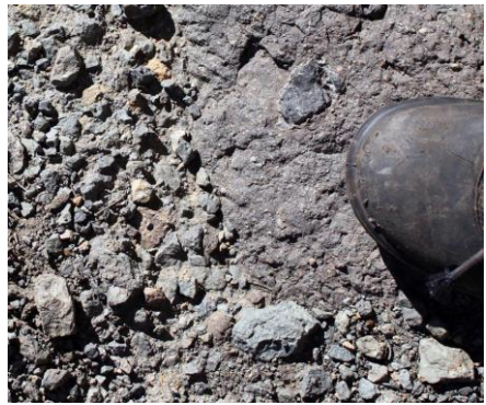
Figure 2: Small dark xenolith, in front of boot, embedded in larger rock fragment on access track.

C. The Hornsby Diatreme provides us with a rare window into the petrology of the rocks forming the Earth's crust through which the molten material passed through on its way to the surface. This is due to the inclusion of xenoliths (from the Greek for "strange rock": Whitten & Brooks, 1972) in the diatreme material which provide evidence about the physical and chemical conditions of the lower crust below the Sydney area (Wilshire & Binns 1961; Joplin 1968; Griffin & O'Reilly 1986). An example is shown in Figure 2.