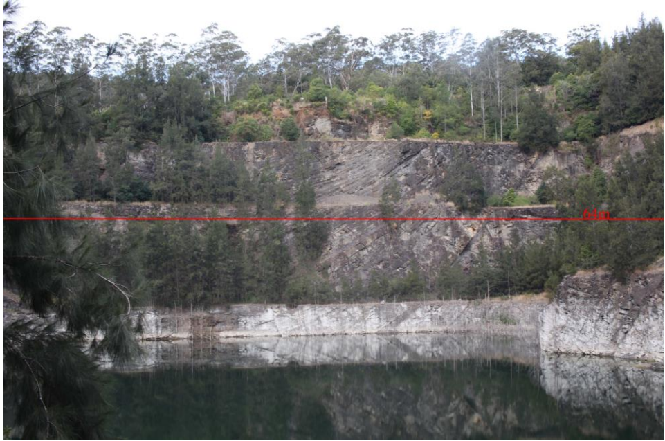
Figure 6: East face showing approximate position of 64m level

shows that filling to 64 m would only preserve the bare minimum representative sample of the most significant features of the diatreme structure.