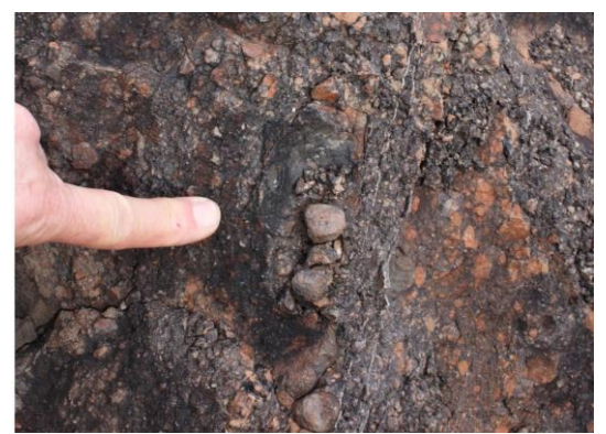
Figure 5: Lapilli in a fallen block on the 40m bench.

This term refers to pebble sized (4-32mm) ejecta (material thrown out by a volcanic eruptions) found in blocks of rock in various parts of the quarry. These provide evidence of explosive eruptions (Hamilton, 1970; Byrnes, 1982) and are therefore important features representative of a maar volcano. An example from Hornsby diatreme is illustrated in Figure 5.