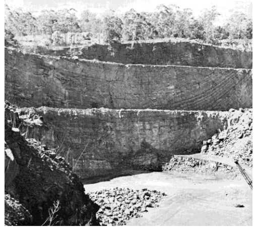
Figure 4: Eastern face of Hornsby Quarry from Herbert (1983)

The most important features seen in the eastern face of the quarry are dish beds, as shown in the image below (from Herbert 1983). A literature review has revealed no other sites in NSW or Australia where dish beds in a diatreme are exposed, making the site unique at a national level. Furthermore, an international image and literature search also found no sites with an exposure of dish bedding comparable with that in the eastern face of Hornsby Quarry, suggesting that this exposure is likely to be a geoheritage feature of International Significance.