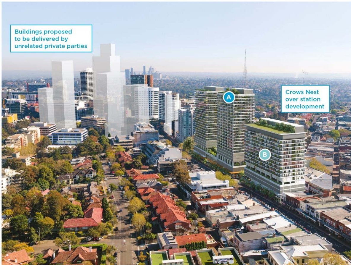
Photomontage of the OSD buildings as exhibited in 2018: Note the false impression due to larger scale of this image that this original project is very much larger than the amended concept proposal

The two images are shown at different scales which gives a misleading impression that the amended project is very much smaller than originally exhibited. Yet, the only change to the envelope is a height reduction of 7.6 metres to Building A and a truncation of the south face, offset by elimination of the large vertical gap between the two towers as originally exhibited. According to Sydney Metro this envelope is 20% less than the original proposal. However, it is one building, not two and will be a very imposing frontage over the full block. In reality its bulk is reduced by 6% not 20%.