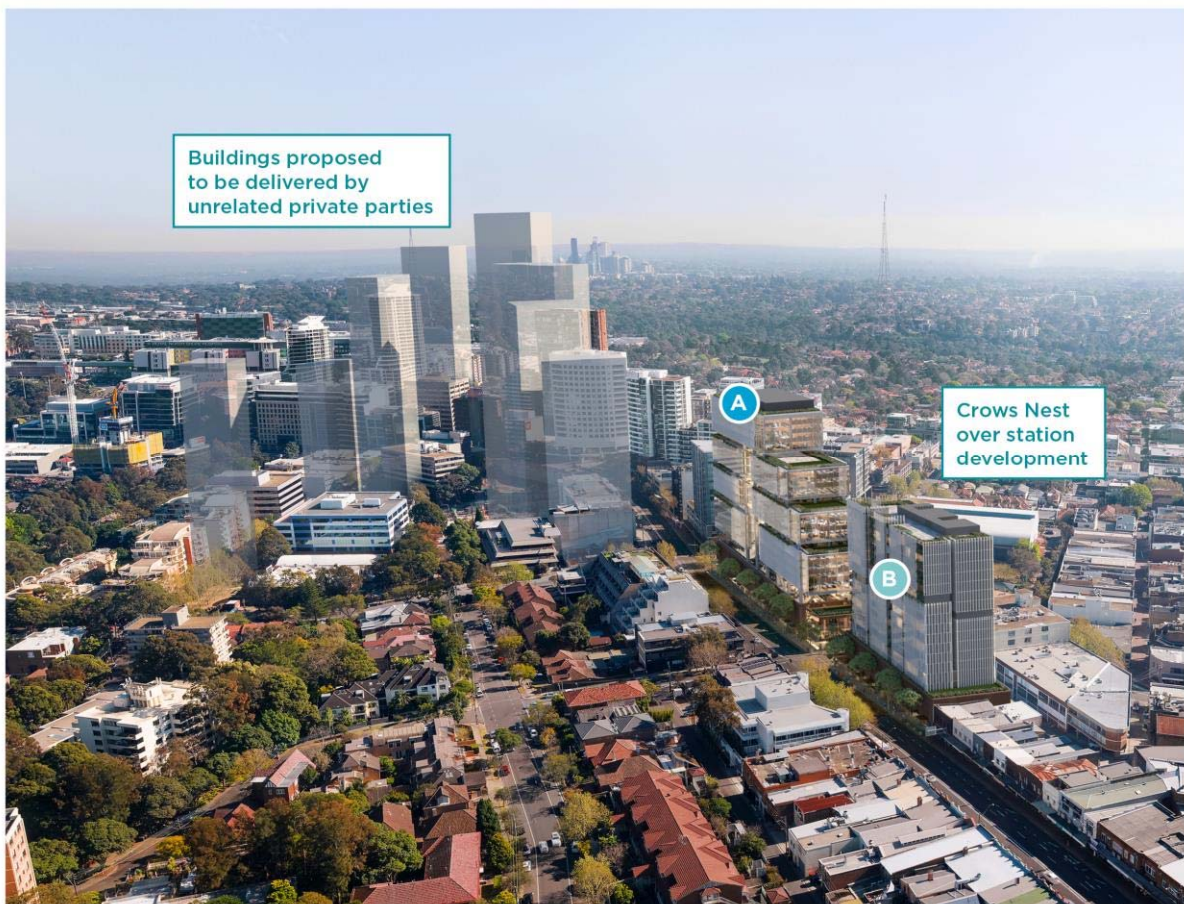
Photomontage of the Amended OSD Project showing Buildings A & B atop the Station Podiums Note: a) the sign on Building A hides the top section to give an impression of reduced bulk and b) the impression of a vertical gap in the middle of the building that is not supported by the indicative plans .

Sydney Metro's contribution to community benefit simply put, is the station itself and the associated works it will do in relation to access (the traditional role of a transport provider). It will also build and provide space for retail activities within the podiums which will be recovered in rentals. And it will pay North Sydney Council s7.11 contributions under Voluntary Planning Agreements in lieu of making dedicated space available in the three buildings. All income from the development of the OSD will be solely for the benefit of Sydney Metro.