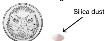
Figure 3: Breathing in more than the amount of silica dust shown in this picture, per day, means you have exceeded the exposure limit of 0.1mg/m 3 .

The mandatory limit for silica dust exposure in Australia is 0.1mg/m 3 averaged over an eight-hour day. The ACGIH have recommended the threshold limit value be 0.025mg/m 3 over an eight-hour day. This limit was based on the prevention of lung cancer and silicosis. However, there is no safe level of silica dust exposure. Work Health, and Safety (WHS) Regulation 50 states air monitoring (by an occupational hygienist ) must be conducted every 12-18 months. This monitoring results can indicate if silica dust levels are within the limits. However, exposure levels in settings like construction sites are always changing and air sampling alone is not enough.