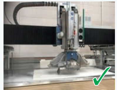
Water suppression for cutting bench tops