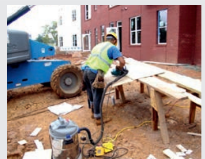
Cutting fibre cement sheet with dust extraction

Materials and products containing crystalline silica include shale, sandstone, concrete, bricks and manufactured stone. Workers can come across crystalline silica during excavation or tunnelling through quartz containing rock such as shale or sandstone. A health hazard is created when the very fine particles of crystalline silica can be inhaled. The size fraction of airborne dust that can reach the lungs where air exchange takes place is known as the 'respirable fraction'. Once particles become larger than about 7 microns (1 micron = 1/1000 mm) in diameter, they are no longer respirable. Significant levels of airborne dust are most likely to occur when materials or products in the workplace are cut, sanded, drilled or during any other activities which create fine dust. Exposures in workplaces can also occur through dry sweeping or using compressed air (rather than wet cleaning or using a vacuum with HEPA filter) and re-suspension of settled dust from clothing or fabric materials.