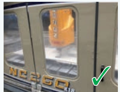
Water suppression for cutting