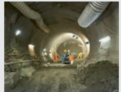
Tunnelling with ventilation