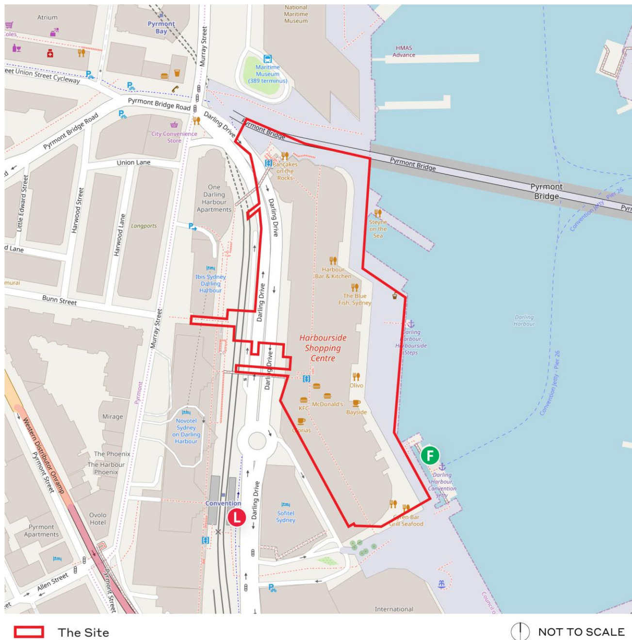
Figure 1 – Location Map Source: Google Maps and Ethos Urban