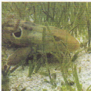
Hunting for seagrass invertebrates such as worms, prawns and crabs, epaulette sharks can survive low oxygen conditions in tidal pools by switching off non-essential brain functions.

The wealth of Australia's seagrasses is also in the ecosystem services they provide – nutrient cycling, sediment stabilisation, carbon sequestration, commercial and subsistence fisheries habitat, and food for dugongs and green turtles. Globally, these services have been valued at $2.1 trillion per year.