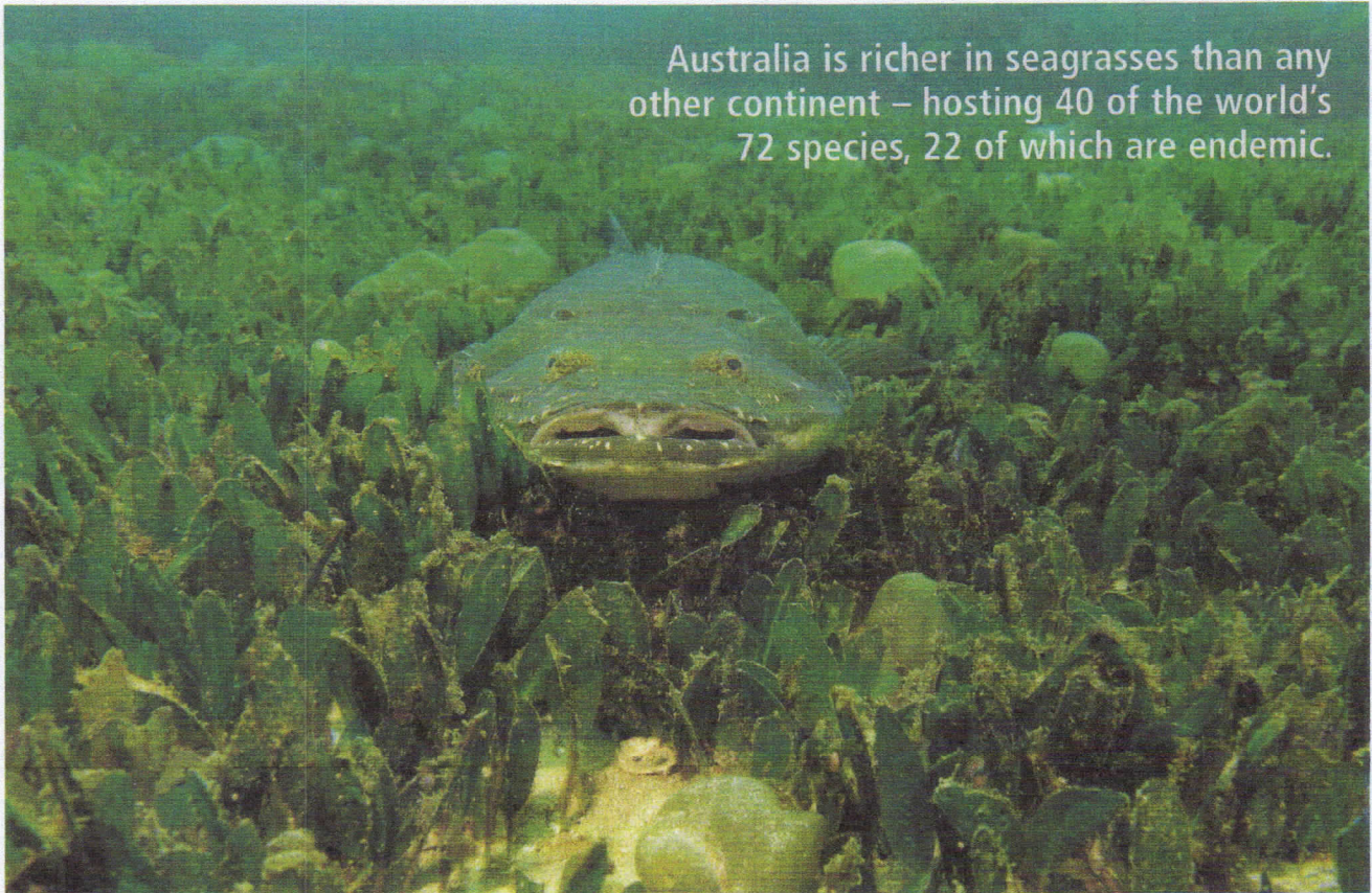
As nurseries for fish and prawns, seagrass meadows attract predators, including this dusky flathead at Shelly Beach in New South Wales. Halophila seagrass is growing here with bubble algae ( Colpomenia sinuosa ). Unlike seagrass, algae (seaweeds) do not have veins in their leaves, nor do they possess roots and rhizomes to anchor them into the sediment, and they don't produce flowers or seeds.

Australia is richer in seagrasses than any other continent – hosting 40 of the world's 72 species, 22 of which are endemic.