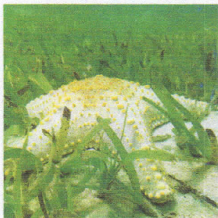
Lurking! Starfish are one of many predators benefiting from highly productive seagrass habitats.