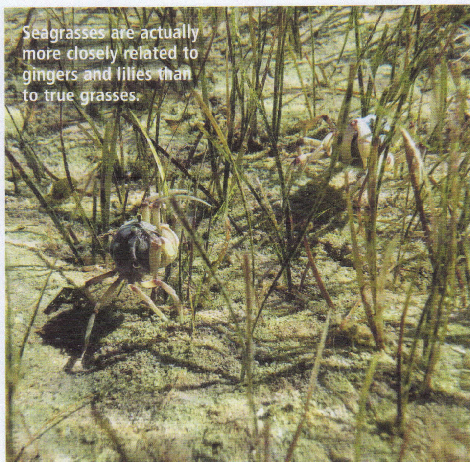
As the tide falls, soldier crabs emerge from burrows and trek en masse down to freshly exposed sand that they scoop into their mouth to extract algae and other detritus and then eject in tiny pellets. Here they are moving through a seagrass bed of Zostera muelleri near Hervey Bay in Queensland.

Seagrasses vary both in their looks and genealogy, having evolved from at least three different freshwater lineages, none of them related to grass, and encompassing six plant families, although not all taxonomists agree about this. Species with a paddle or fern shaped leaf are from the widespread genus Halophila. All but one member of the Posidonia genus and Posidoniaceae family are endemic to temperate Australia. While other genera are unique to Australia each of the five other families has representatives in many other parts of the world.