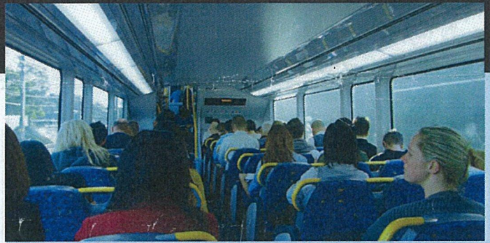
Do you want your rail service to go from THIS ...