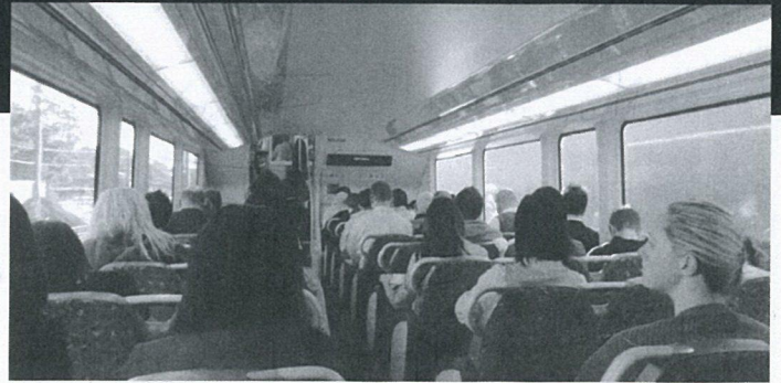
Do you want your rail service to go from THIS ...

• ecotransit.org.au • https://www.facebook.com/EcoTransit June 2016