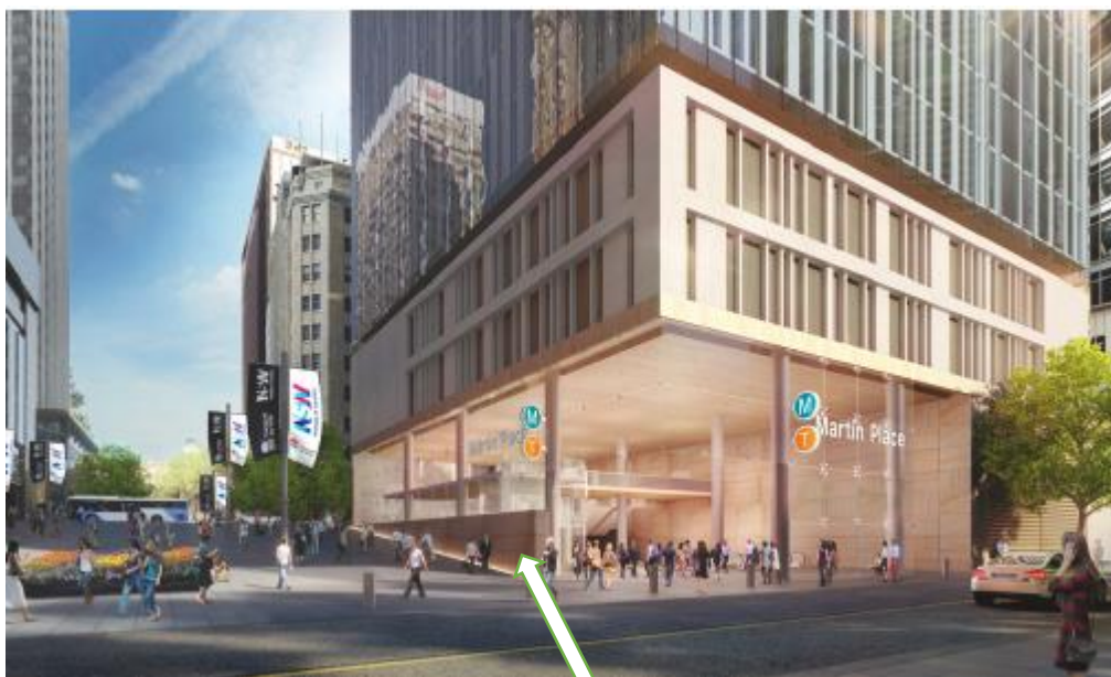
Possible place to re-locate Tom Bass sculpture

The EIS proposes that the city council find an alternative site for the sculpture. This is not easy, because Tom Bass designed it for the sloping site. TfNSW should re-install the sculpture either where it is now or on the Martin Place station façade, see the EIS artist's impression below.