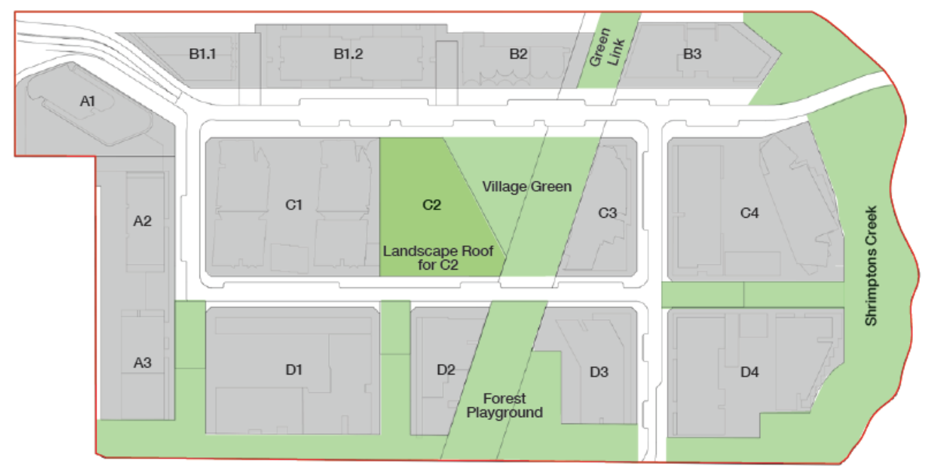
Figure 2 Development blocks and precincts within the Masterplan

Within each of these development blocks, the Masterplan defines specific building envelopes, desired uses, and the location of roads, public domain and open space, that together inform the detailed design and delivery of each stage of the development.