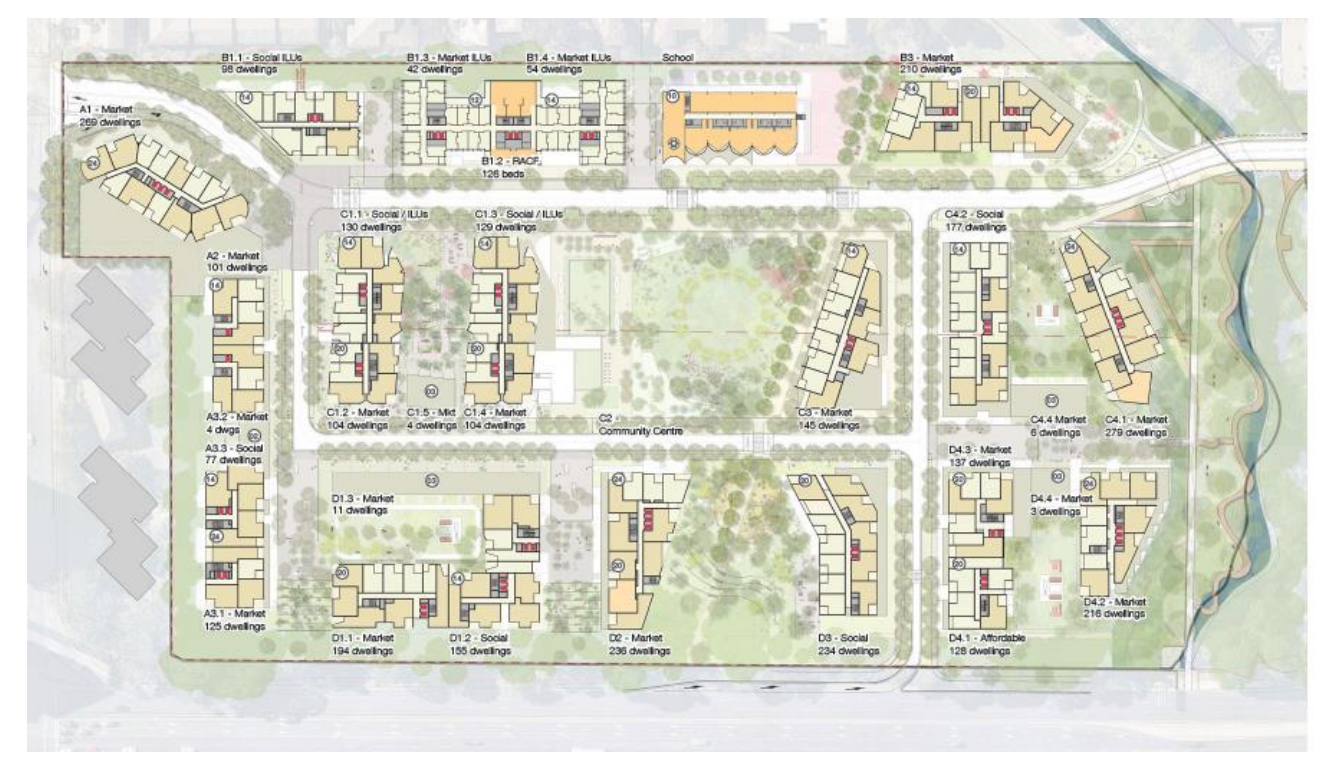
Figure 1 Indicative Ivanhoe Estate Masterplan

The Strategy more specifically articulates the proposed design excellence process and demonstrates how design excellence will be achieved during the future stages of the development.