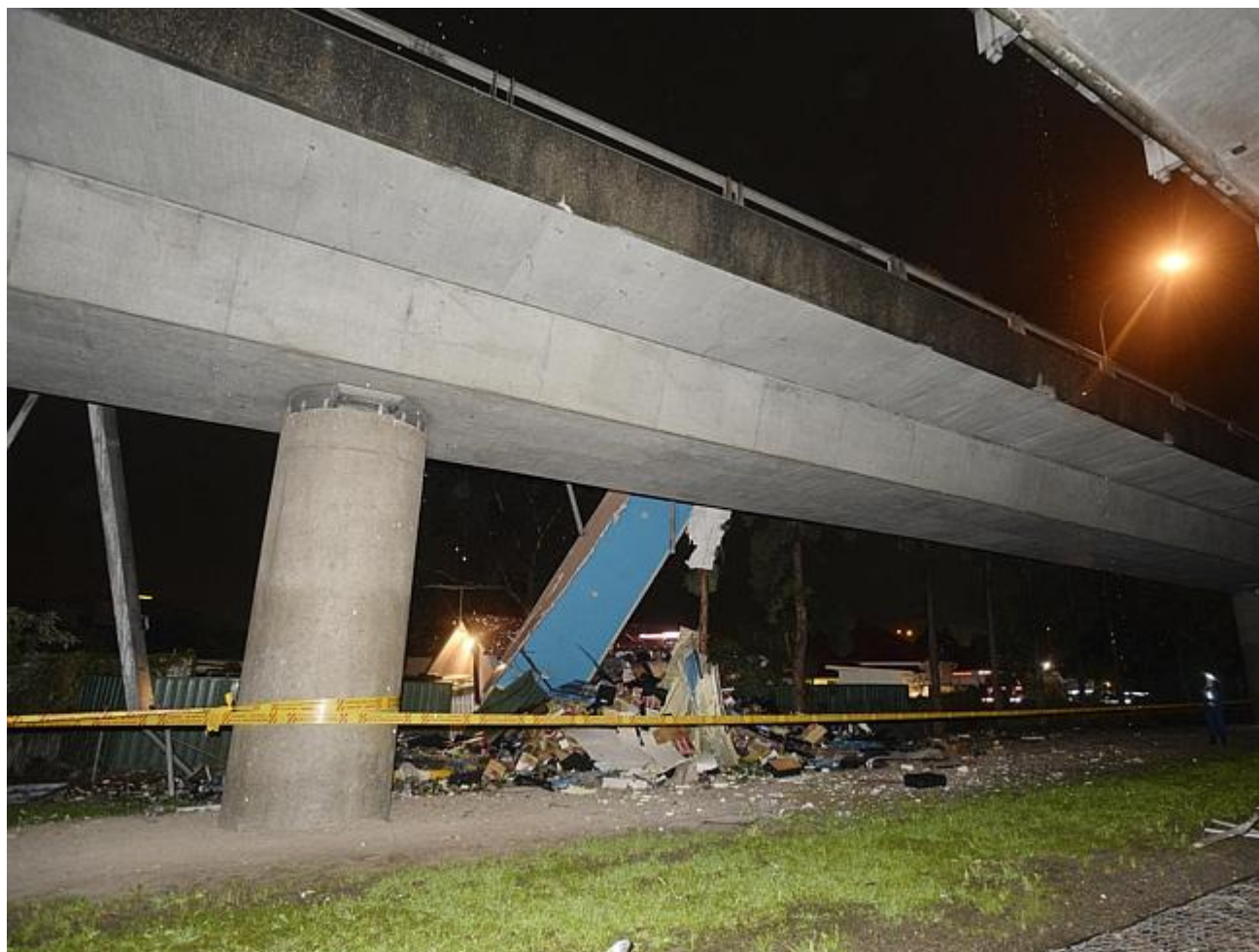
A section of the truck hangs down from the overpass.