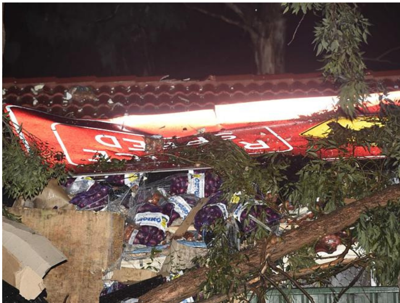
Some of the items the truck was carrying ended up on the roof of the house.