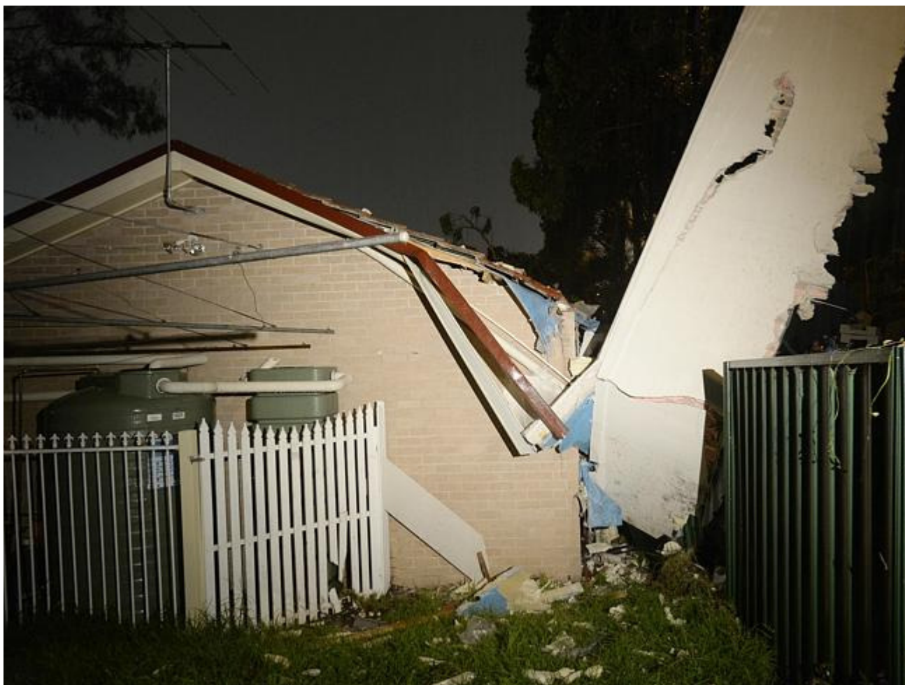
The crash caused a lot of noise and damage.