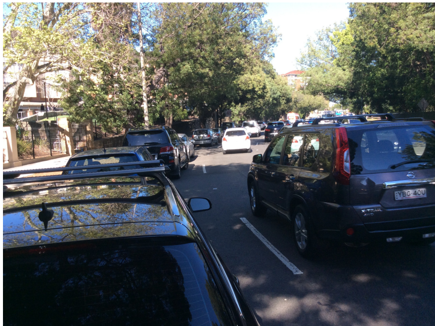
Table 2 New South Head Rd Westbound towards Victoria Rd, figure 5

The reality is shown in these photos showing the same these same roads, taken Friday 21 st September 2018 between 8-9 am.