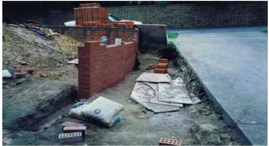
NO. 22 Mail box wall construction commences