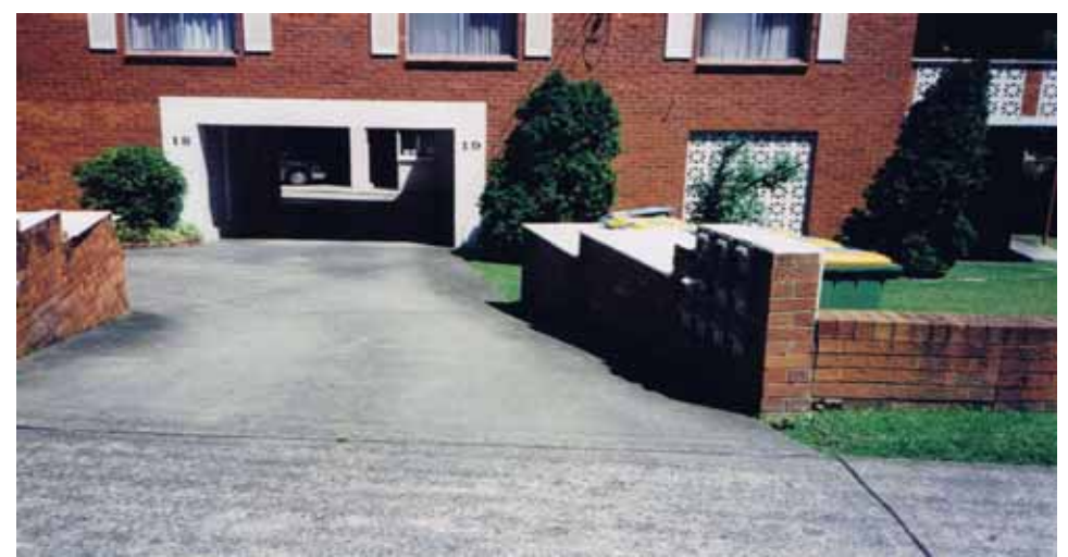
NO. 5 Front entrance of driveway with steep slope