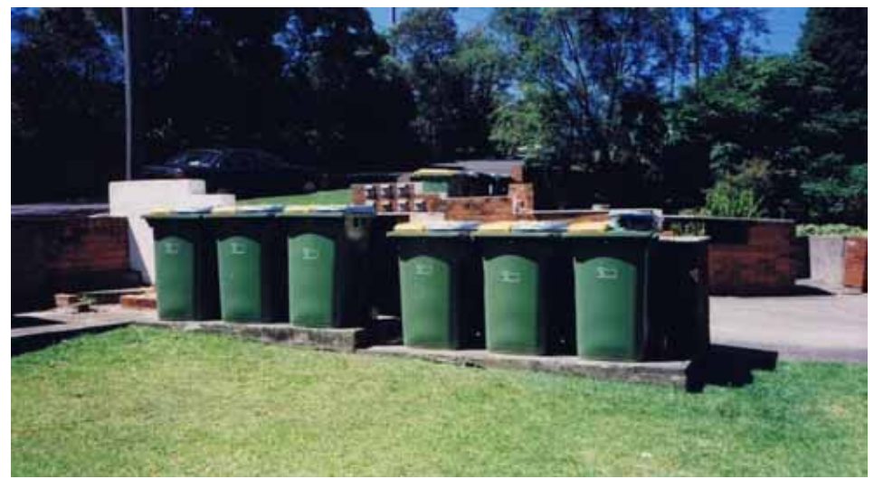
NO. 8 Before construction began in lawn area and garbage bin storage