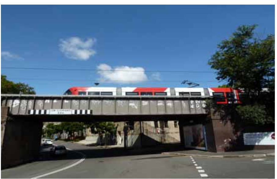
Bridge Road Glebe Tram Overpass, 13 April 2017 some 60 years on

Serving Macquarie University, Macquarie University Railway Station (Heavy Rail only), Macquarie Shopping Centre