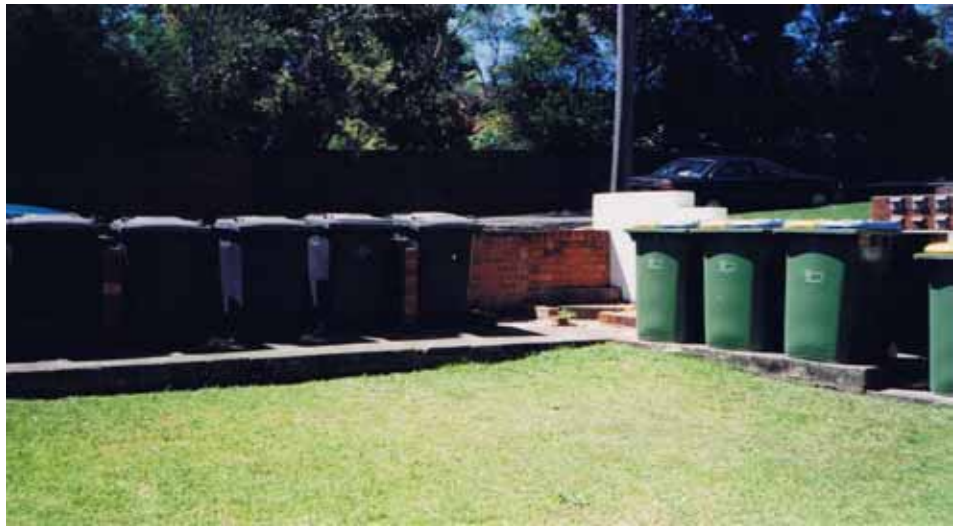
NO. 9 Before construction began in lawn area and garbage bin storage