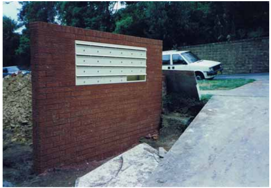
NO. 24 Mail box wall completed