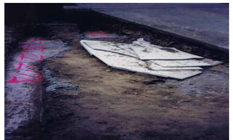
NO. 20 Foundation laid and marked for mail box wall and removal of solid asbestos sheets