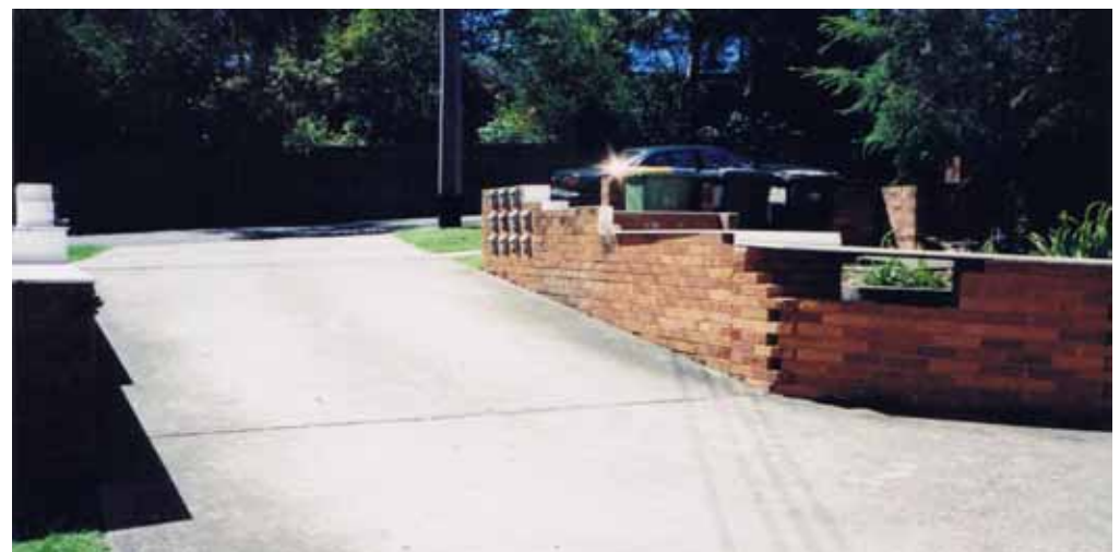
NO. 2 Before construction began on right hand side of driveway with broken brick wall