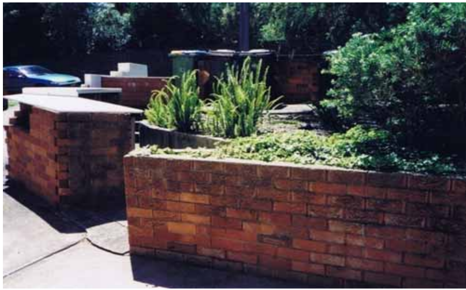
NO. 6 Before construction began on right hand side of driveway