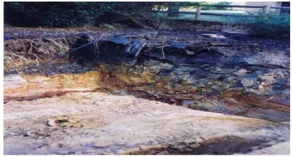
NO. 18 Preparing foundations for garbage bin bay