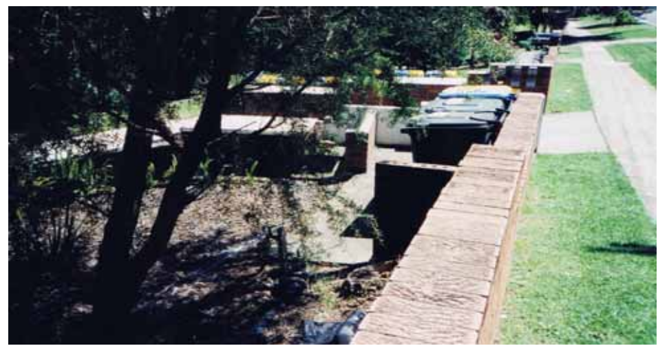
NO. 12 Before construction began in garden area and garbage bin storage