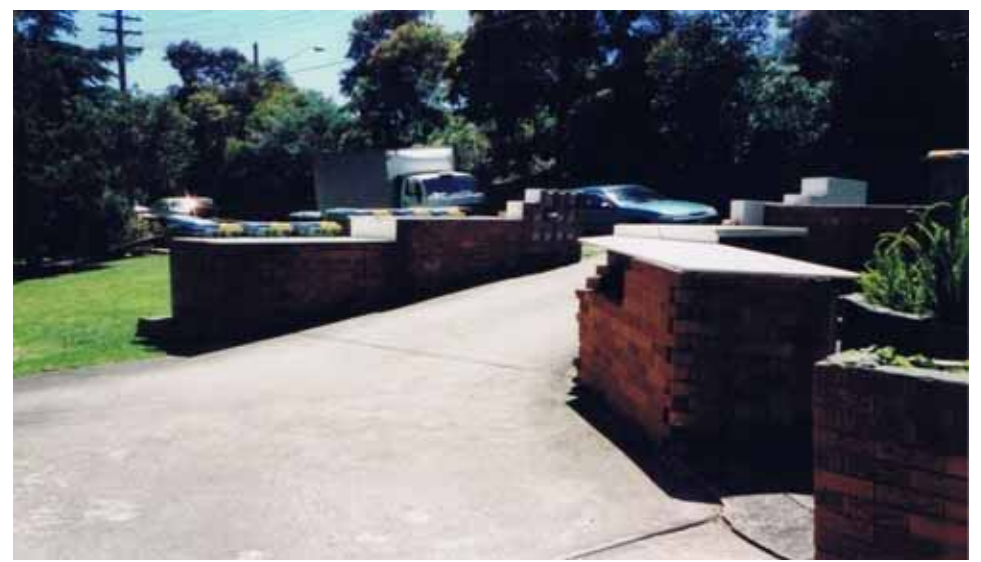
NO. 7 Before construction began facing left hand side of driveway