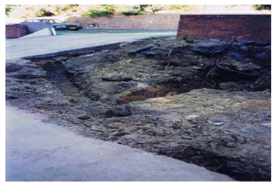
NO. 19 Preparing foundations for driveway brick wall and wider sweep of driveway