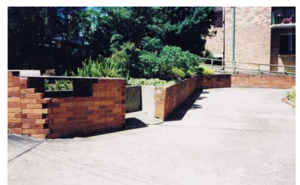
NO. 11 Before construction began with broken brick wall and leaning brick wall