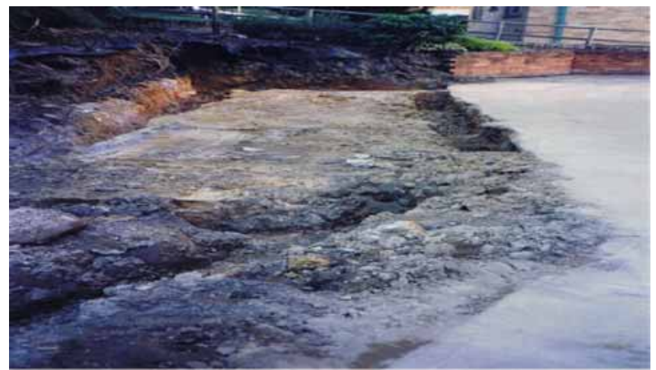
NO. 17 Preparing foundations for garbage bin bay