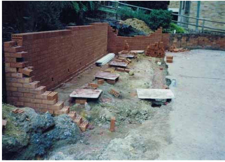
NO. 23 Garbage bin bay construction commences