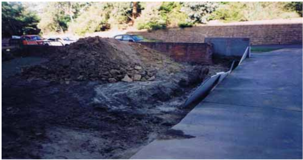
NO. 15 Preparing foundation of mail box brick wall

NO. 14 Demolished mail boxes, garbage bin storage with steep slope of driveway