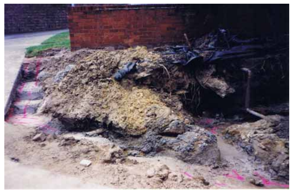
NO. 21 Foundation marked for driveway brick wall and wider sweep of driveway