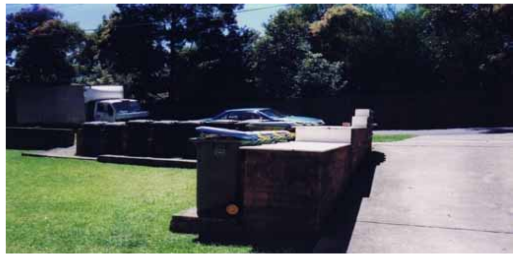
NO. 1 Before construction began on left hand side of driveway

All 45 Photos taken by me illustrating start to finish of this project. Photos 1-24 are included here as follows: