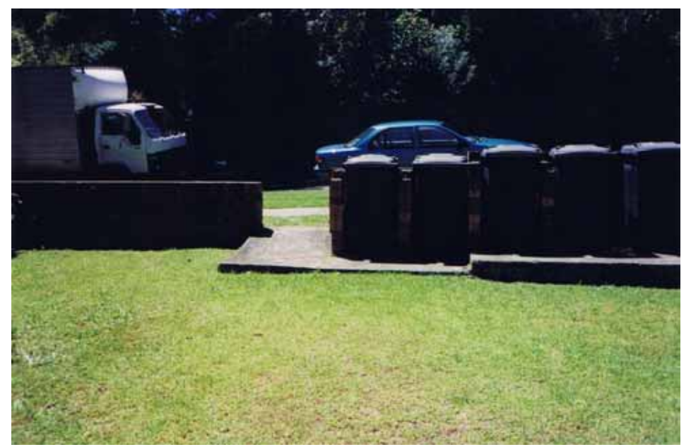
NO. 10 Before construction began in lawn area and garbage bin storage