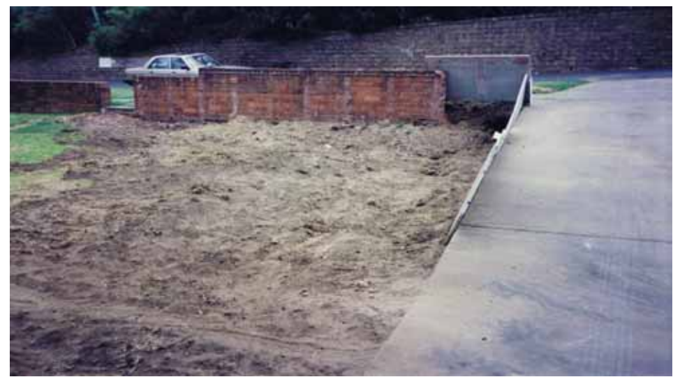
NO. 13 Demolished mail boxes, garbage bin storage with steep slope of driveway