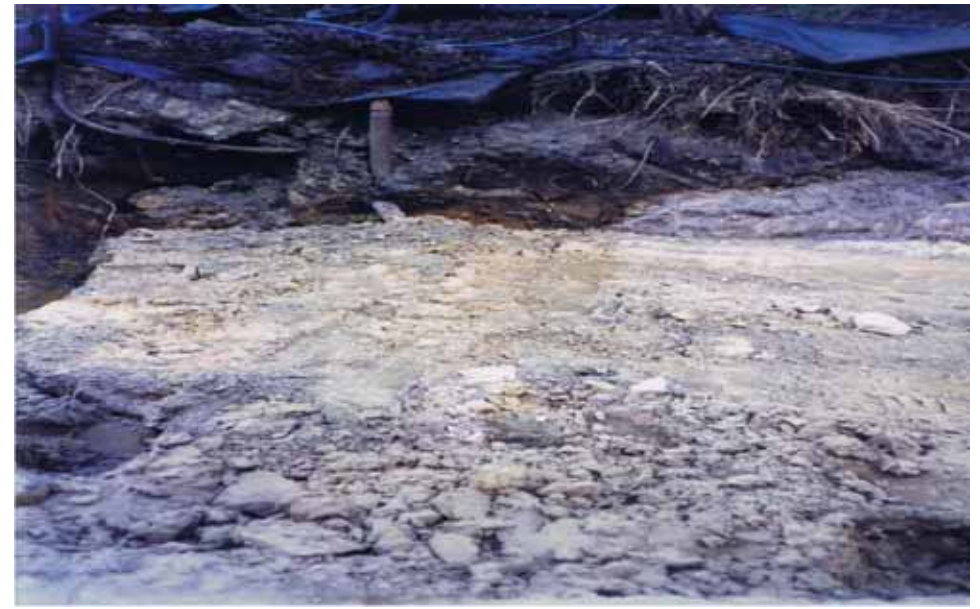
NO. 16 Preparing foundations for garbage bin bay