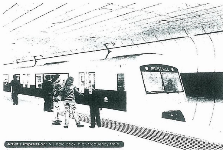
Artist's impression: A single-deck, high frequency train.

Metro style trains to replace heavy rail on NWRL