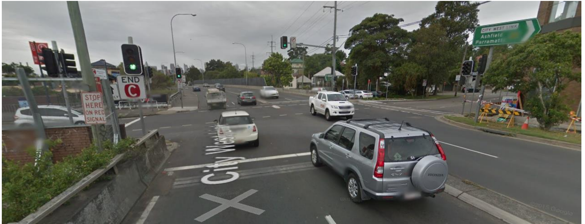
Intersection of Catherine St Lilyfield and City West Link