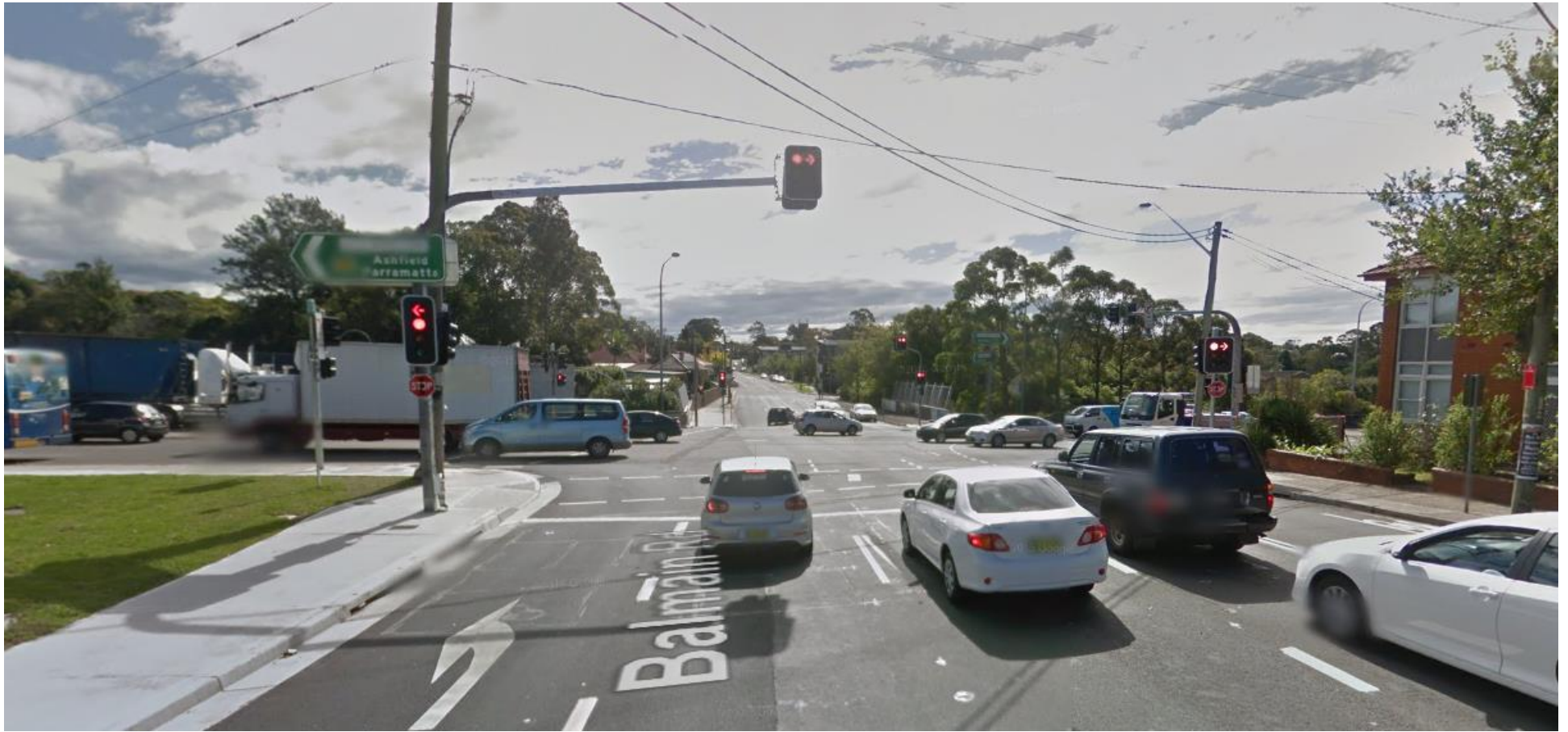
Intersection of Balmain Rd St Lillyfield and City West Link