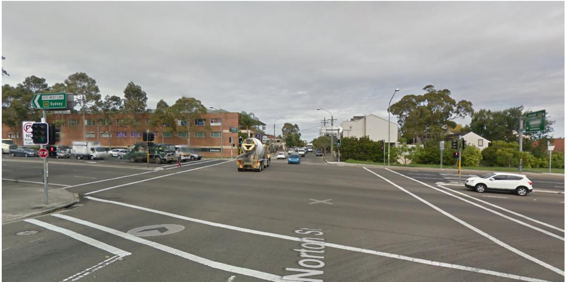
Intersection of Norton St Lillyfield and City West Link