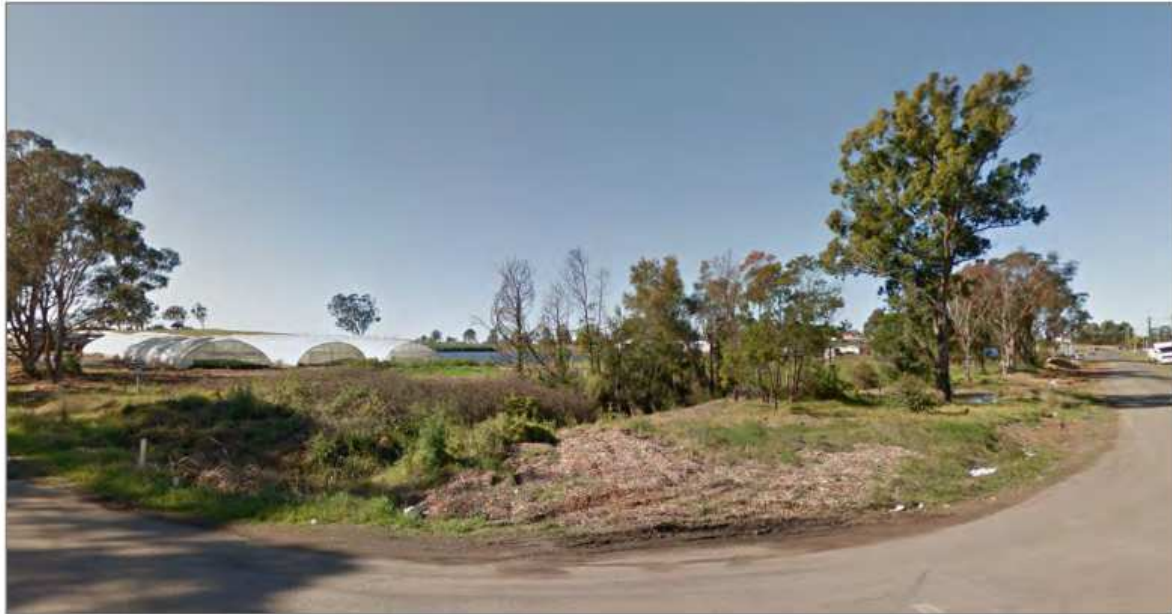
FIGURE 5 – SURROUNDING DEVELOPMENT (WEST)

Market garden to the west of Lot 35, (where warehouse is planned to be built).