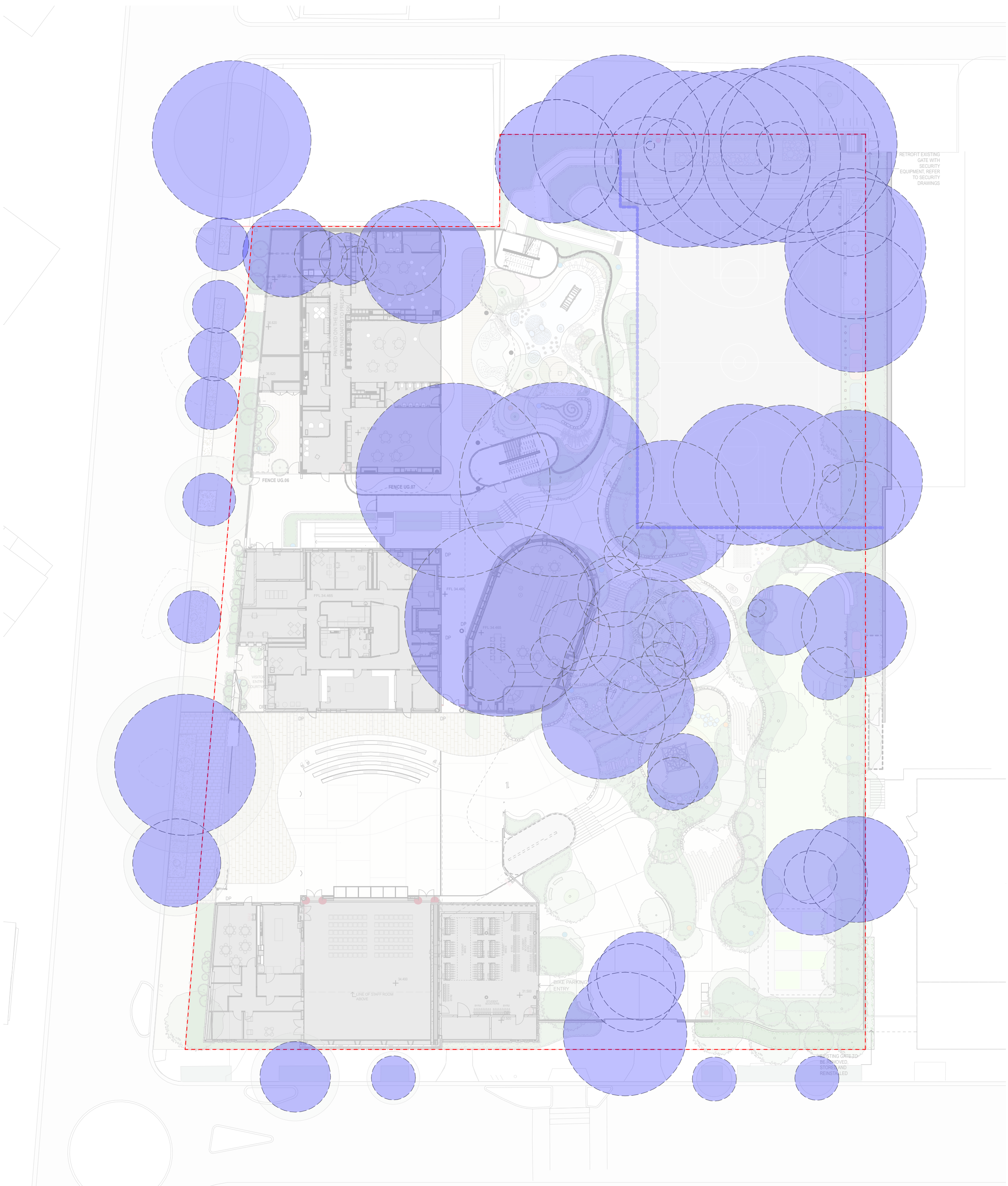
1 PLAN TREES PRE-DEVELOPMENT

AREA OF TREE CANOPY PRE-DEVELOPMENT : 4440m 2