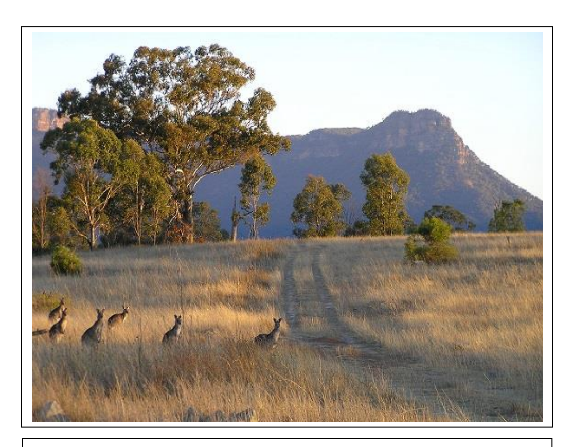
Figure 1: Eastern Grey Kangaroo in Grassy Box Woodland, Burragorang, Nattai National Park. Bonum Pic in the background.