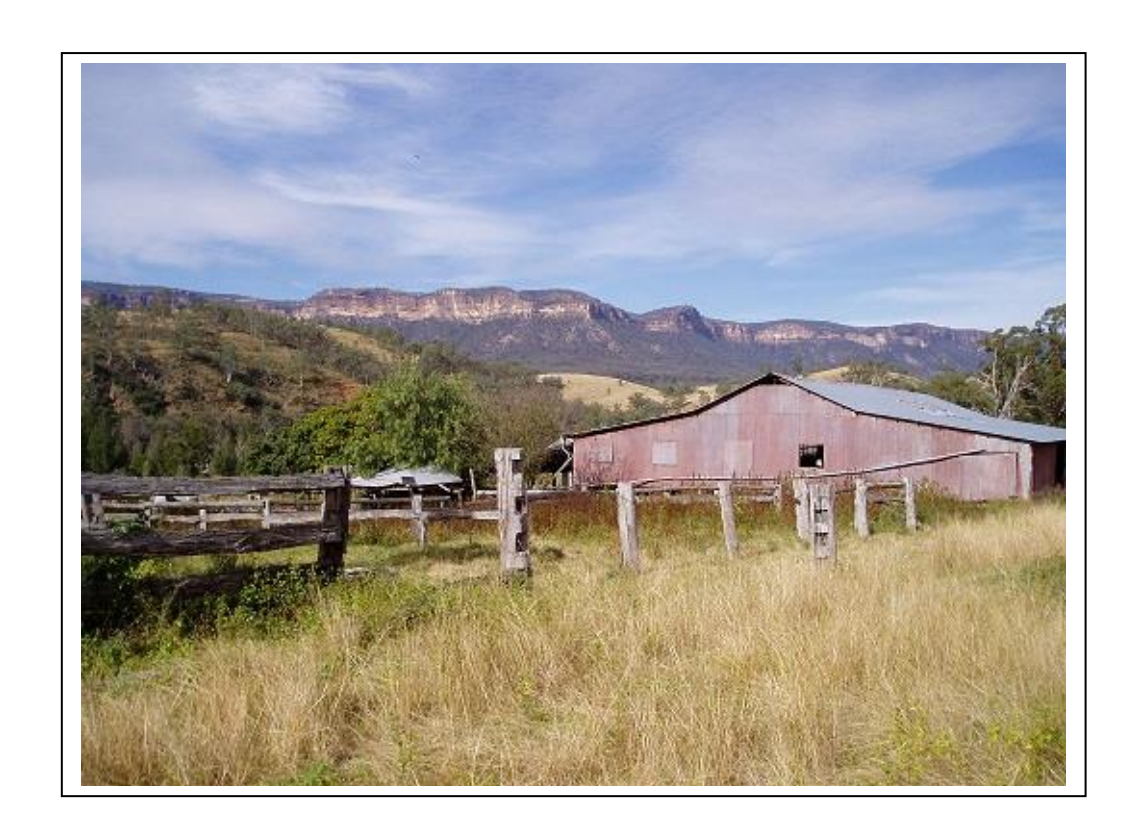
Figure 5: Joorilands shearing shed, historic pastoral property, Yerranderie State Conservation Area.