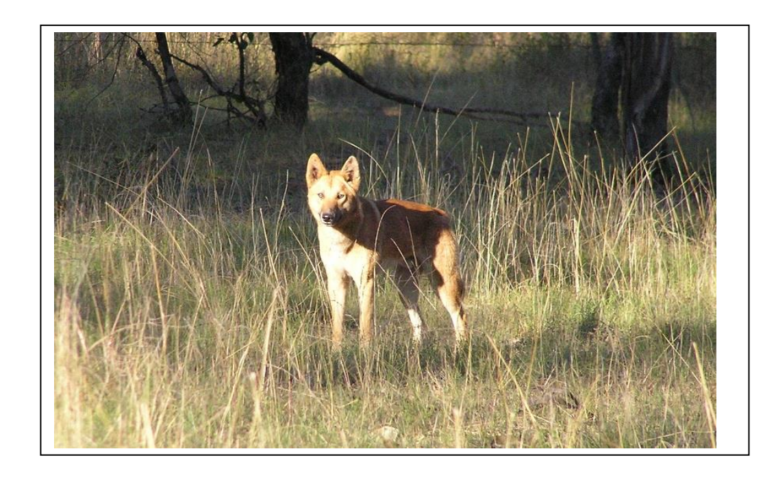
Figure 4: Dingo, Grassy Box Woodland, Joorilands, Yerranderie State Conservation Area.