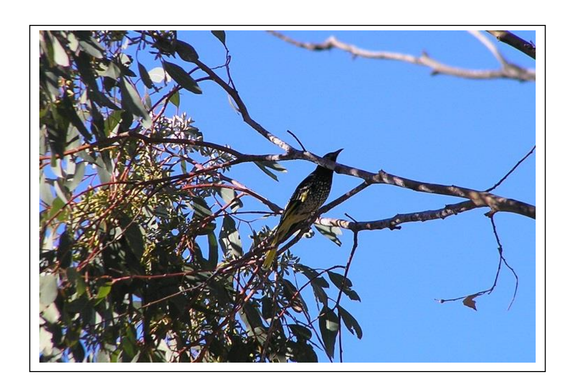
Figure 3: Regent Honeyeater, Critically Endangered, Grassy Box Woodland, Burragorang, Yerranderie State Conservation Area.