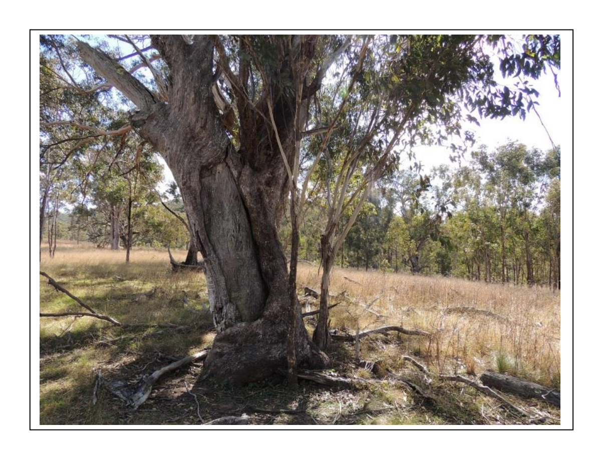
Figure 6: Possible Aboriginal scar tree. Old Growth Grassy Box Woodland, Joorilands, Yerranderie State Conservation Area.