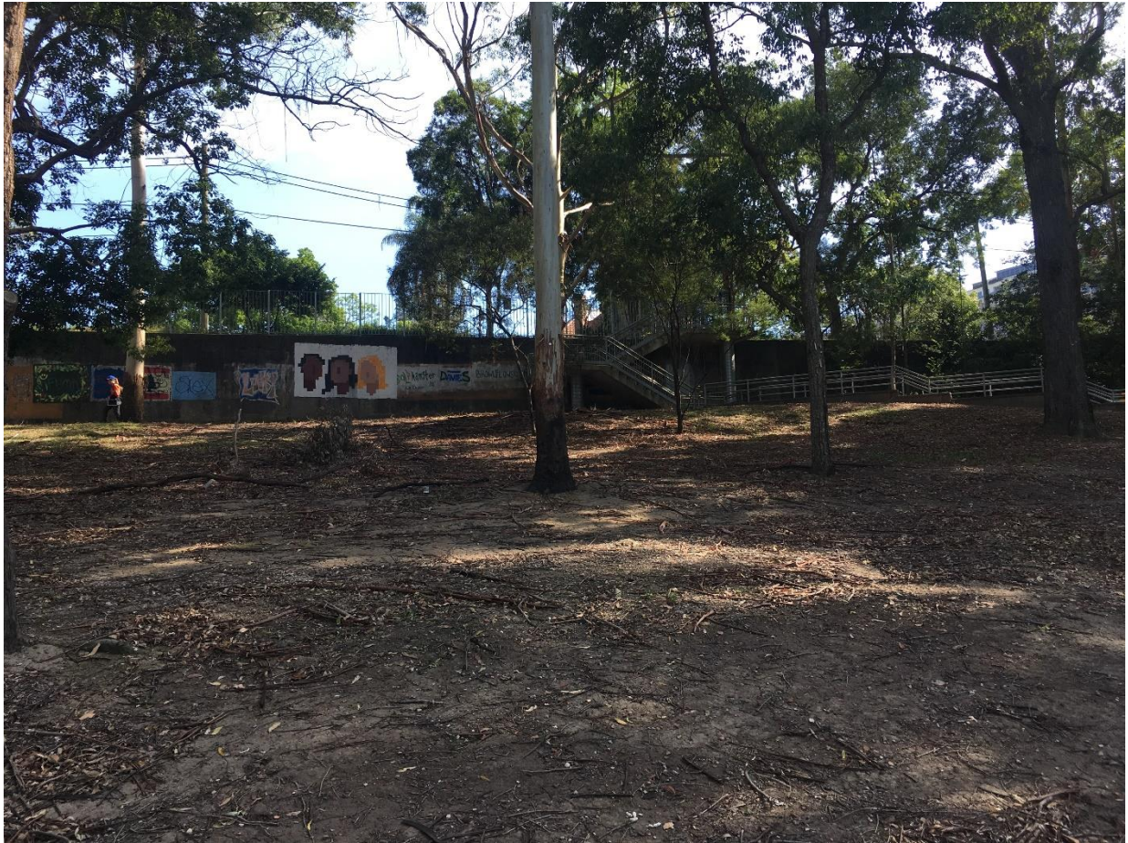
Photo 2: Example of PCT 1237_planted in Site 1 which shows planted canopy and lacks ground layer