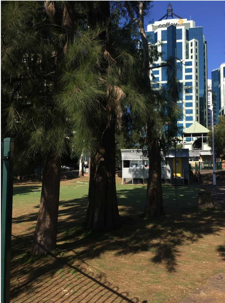
Photo 1: Example of PCT 1237_planted vegetation in Site 2 which does not satisfy listing as part of BGHF under the BC Act