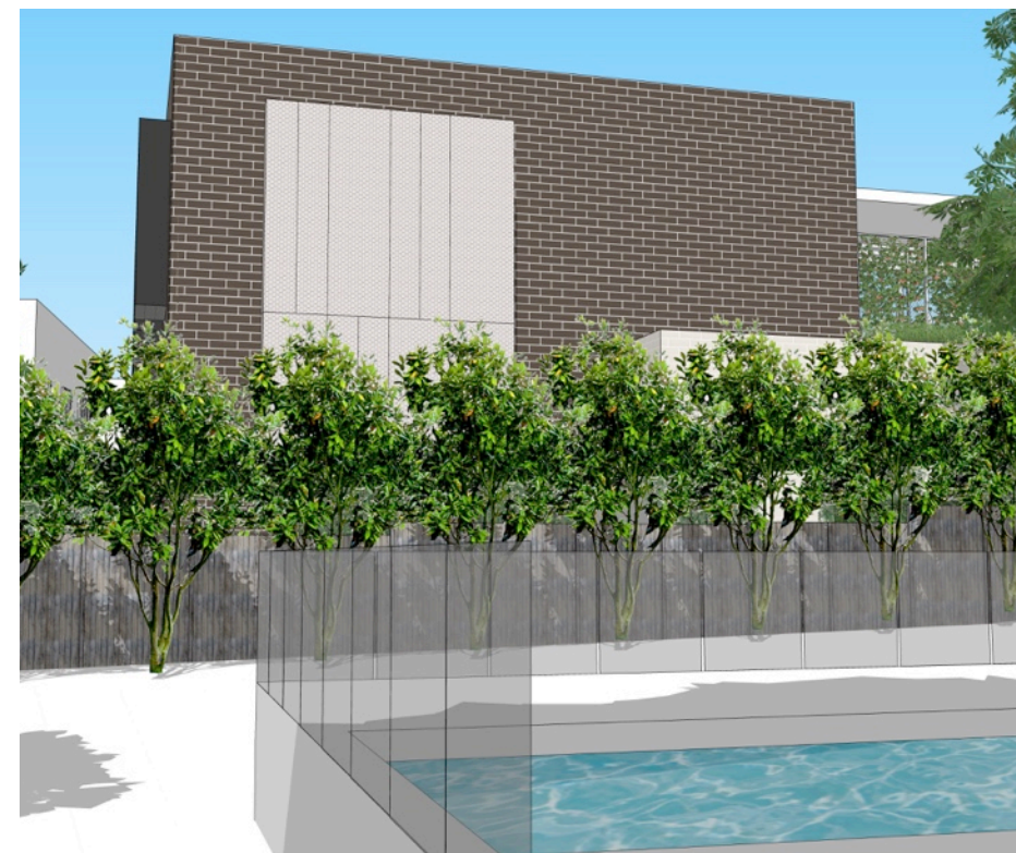
Original SSDA perspective View from No.39