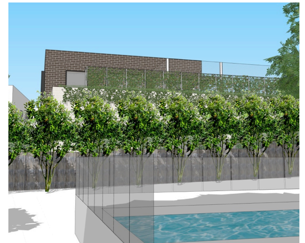
Revised design for Response to Submissions perspective View from No.39