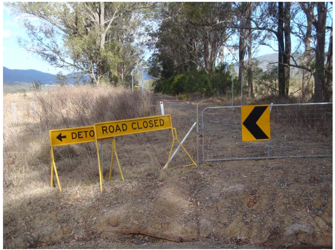
Original Wyndam Cox's Road before Stratford Coal diverted Road, more than a road closure. An open cut coal mine coming through bushland removing all!