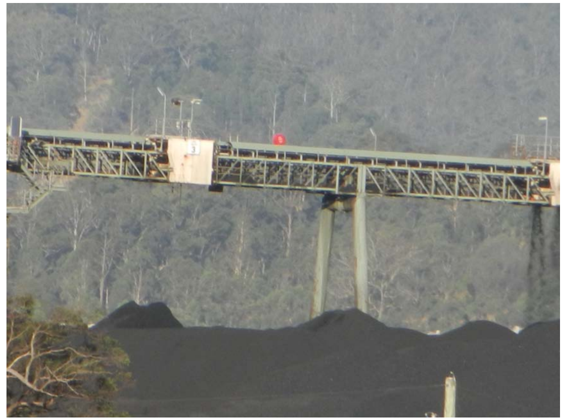
Stratford Coal stock pile.