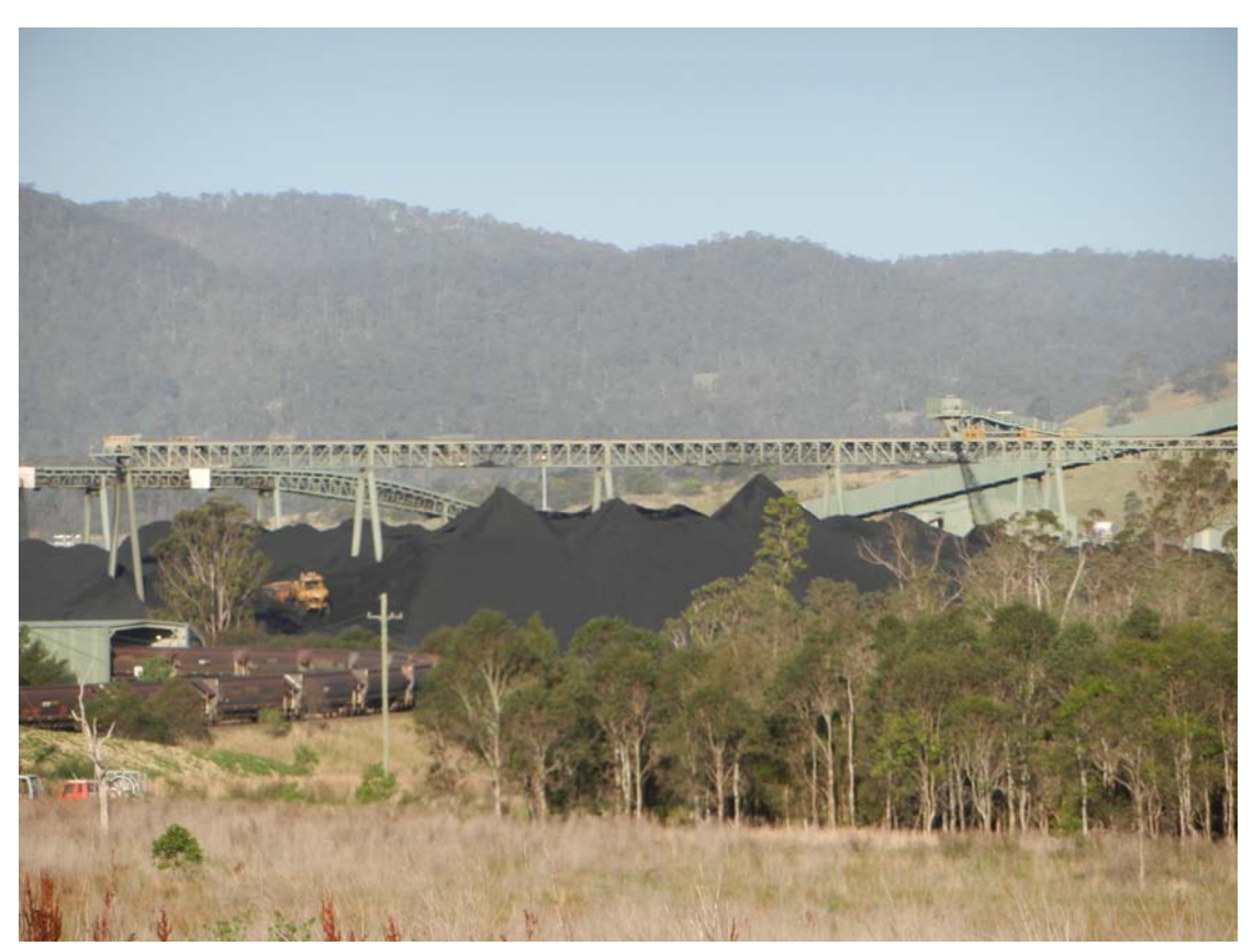
Valley view of what is happening in this area. Life extinguished!