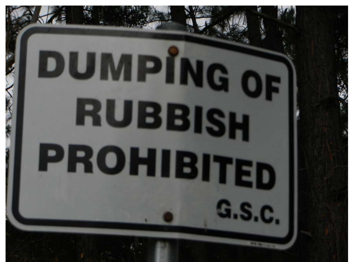
This sign at grass road area of Stratford Township running along the pine trees. Should Government approve Stratford Coal, their impact of Bowens Road diversion & open cut coal mine will be 1000m or less from these pine trees behind this sign and the houses.