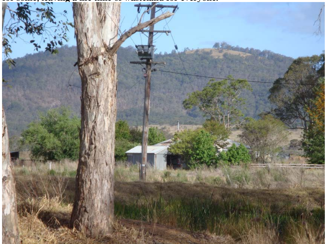
Another farm house vacant and will go entirely along with the bushland of listed Threatened Species in an open cut coal mine, should Stratford Coal be approved.