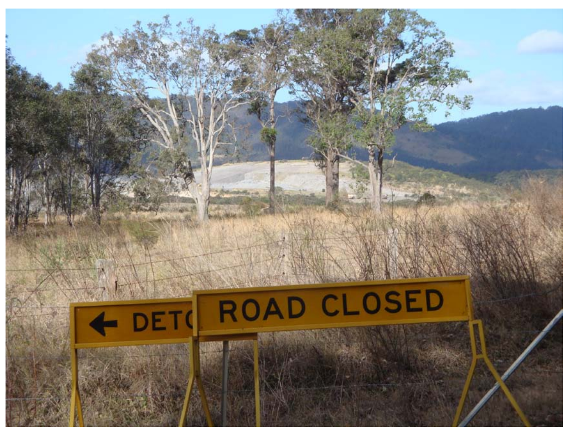
These trees are typical of the massive habitat trees in this area all earmarked to go, should Government approve Stratford Coal & allow this area to be open cut.