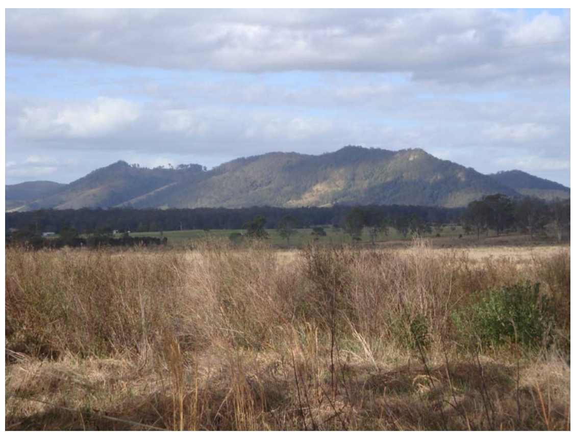
Photo taken from Bowens Road – one of the areas be open cut if approved.