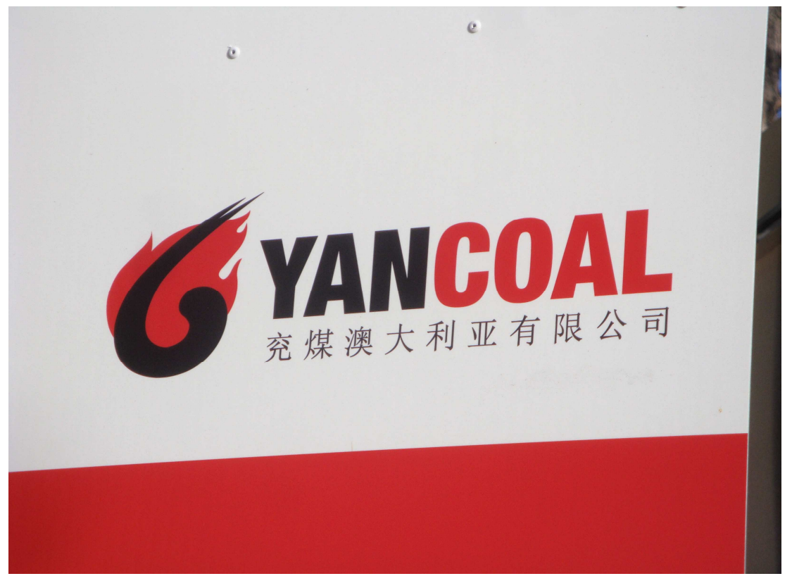
Formerly Gloucester Coal now owned by YANCOAL - China