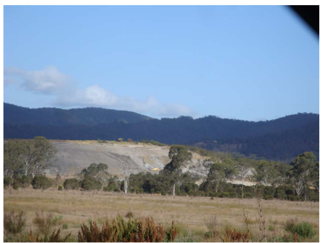
Our valley, mountains, bushland and wildlife being destroyed by Stratford Coal mine. One of proposed open cut extensions, should Government give approval.