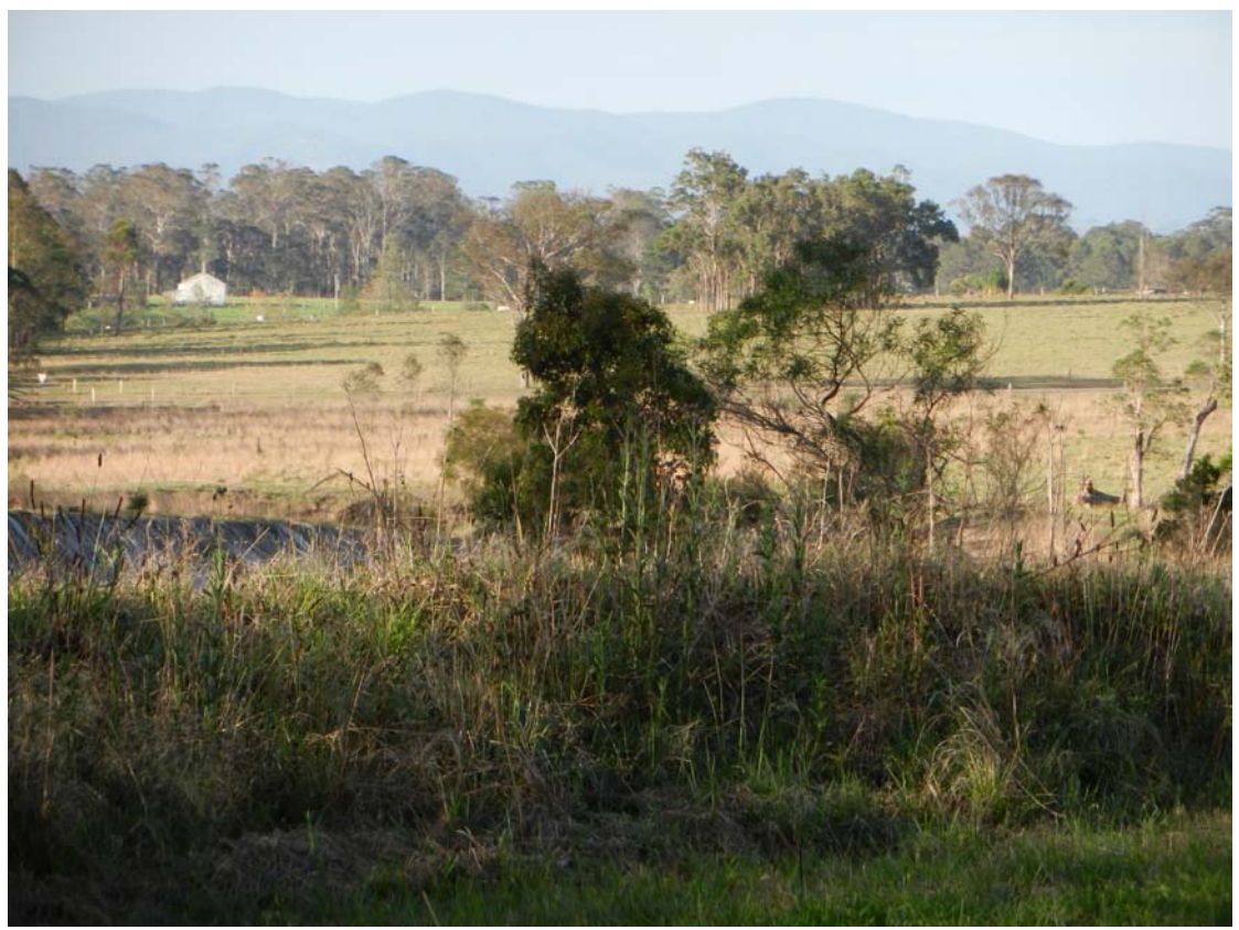
Photo of the valley North to be destroyed by mining impacts of more to come in this area, should Government approve Stratford Coal to continue.