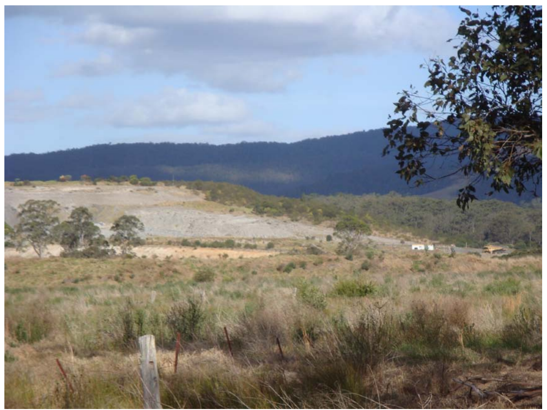
Looking at open cut pit from Bowens Road. See any coal? Bushland & wildlife destroyed being destroyed by Stratford Coal/YANCOAL for short-term profits for some, leaving a life time of wasteland for everyone.