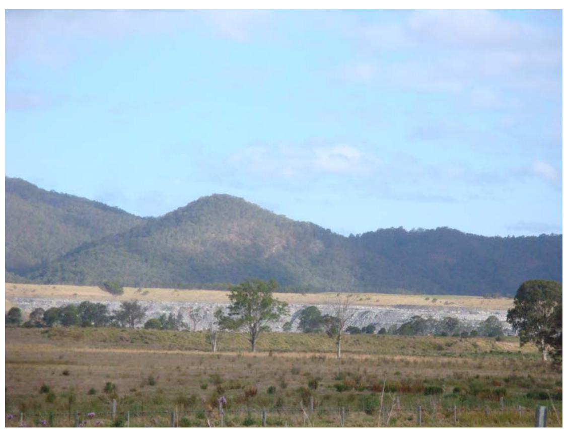
Corner of Bowens Road & Wyndam Cox's Road looking at Stratford Coal mine. Photo taken from Bowens Road looking at next area to be open cut if approved.