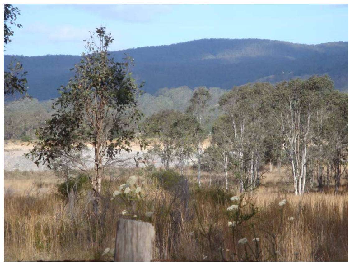
Open cut ploughing through wildlife Endangerd, Threatened & Vulnerable Species.