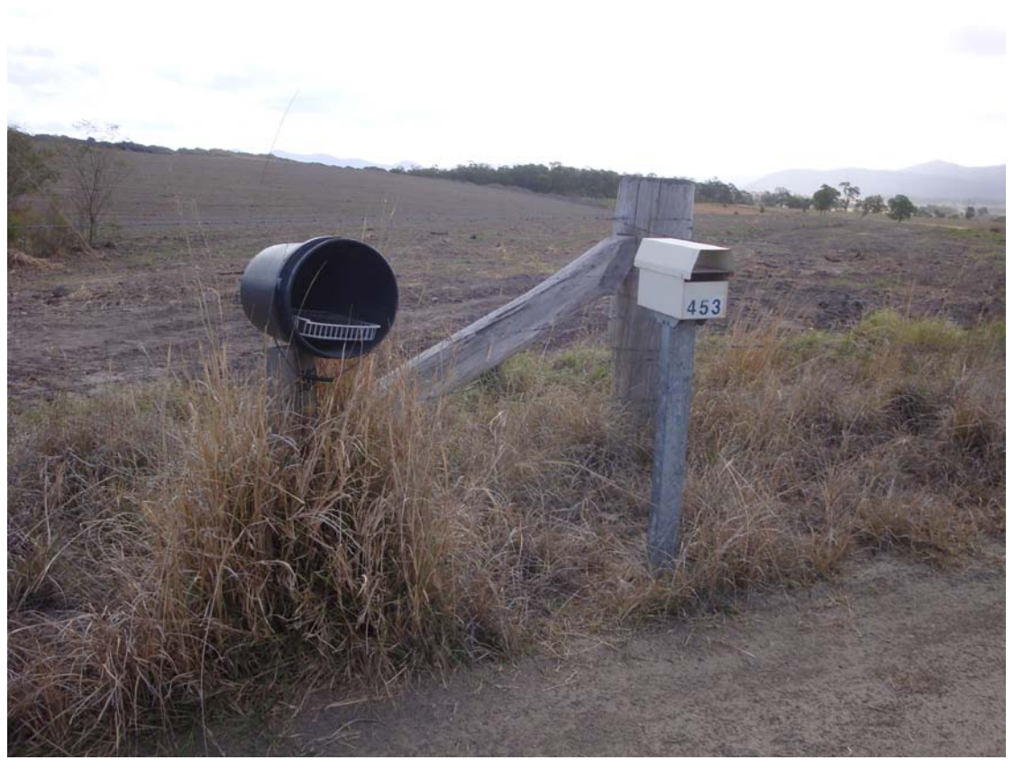
Looking towards The Bucketts Way over letterboxes in Wyndam Cox's Road and if Government approved will be open cut through past Bowens Road.