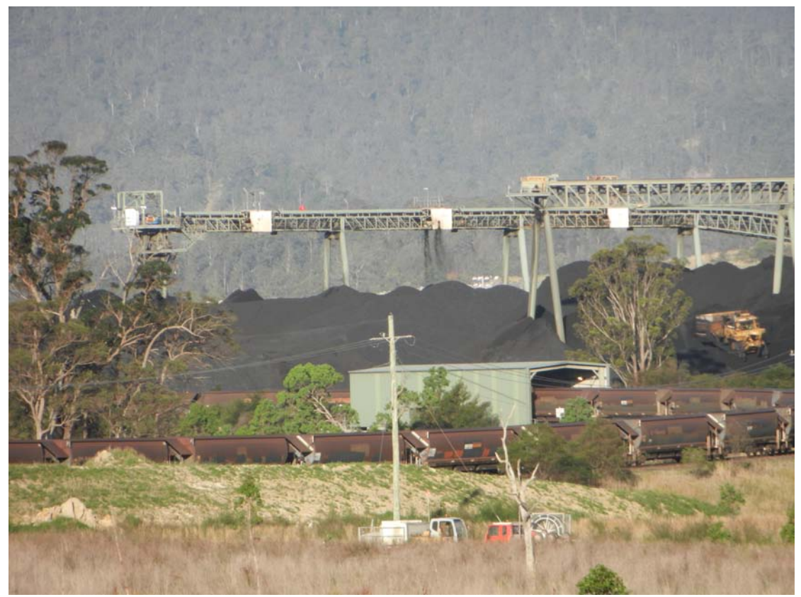
Stratford Coal's train wagon, stock pile.