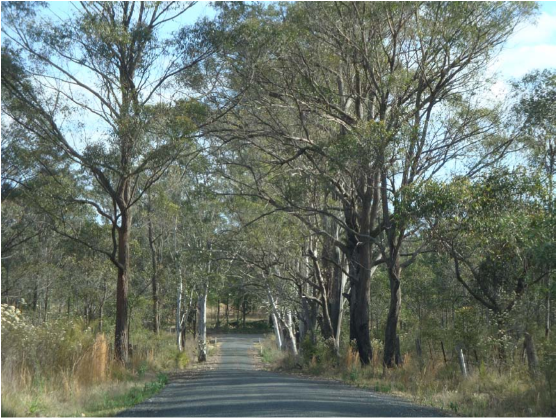
Farewell to Bowens Road, bushland and wildlife, should Government approve Stratford Coal's extension. Trees are mature habitat trees not saplings.