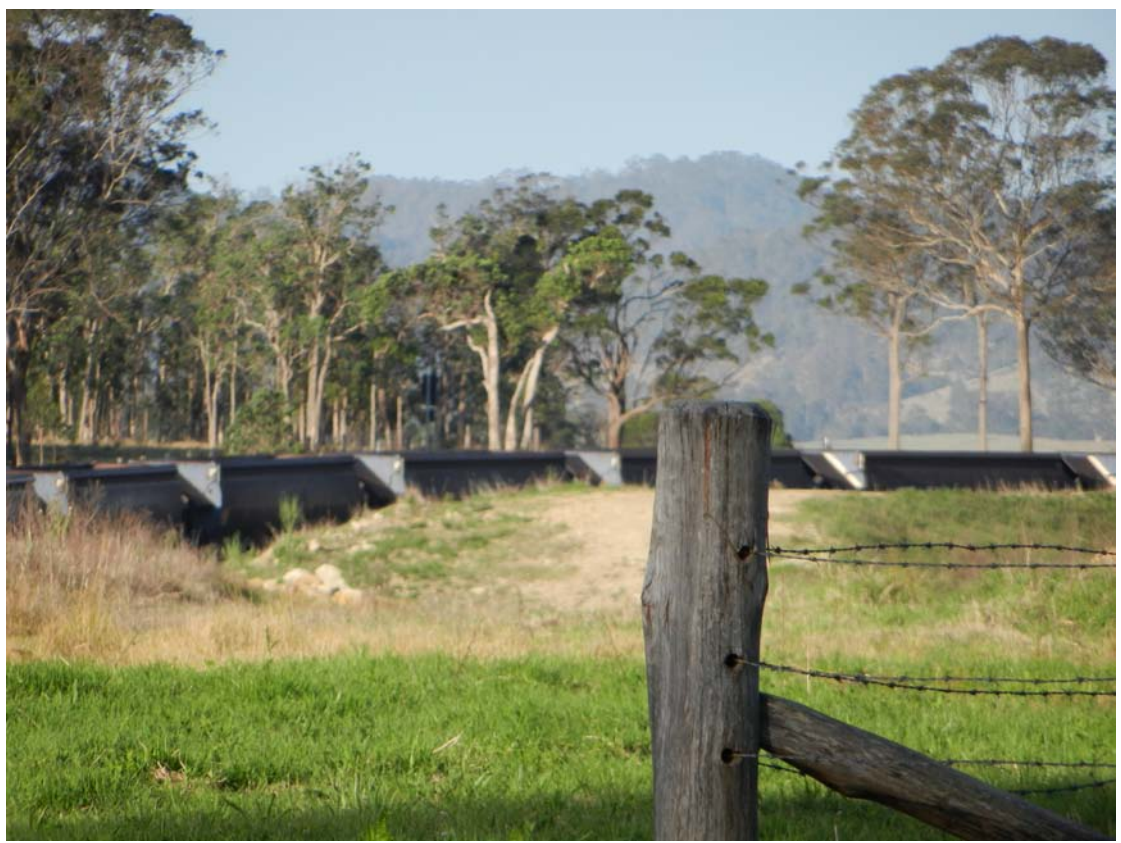
Coal wagons against a back drop of mature habitat trees for wildlife, the valley glimpses and mountain ranges.