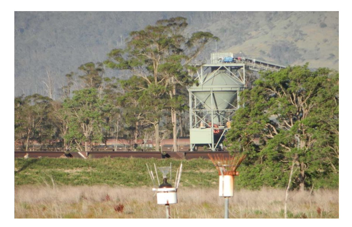
Train wagons being loaded by hopper at Stratford Coal.

Mining signs remind people of what is happening to the Gloucester-Stroud valley in 'selective places'. "Mining Lease" another ugly term falsely used by Government and mining. The natural environment once destroyed can't be given back to the people of NSW. Toxic voids & dirty water-holding dams flowing into creeks and river systems to Manning River Taree. Impacts from Stratford Coal mine impacting Craven affects creeks and Wards River, that all flow into Mammy Johnsons River, Karuah River/Port Stephens.