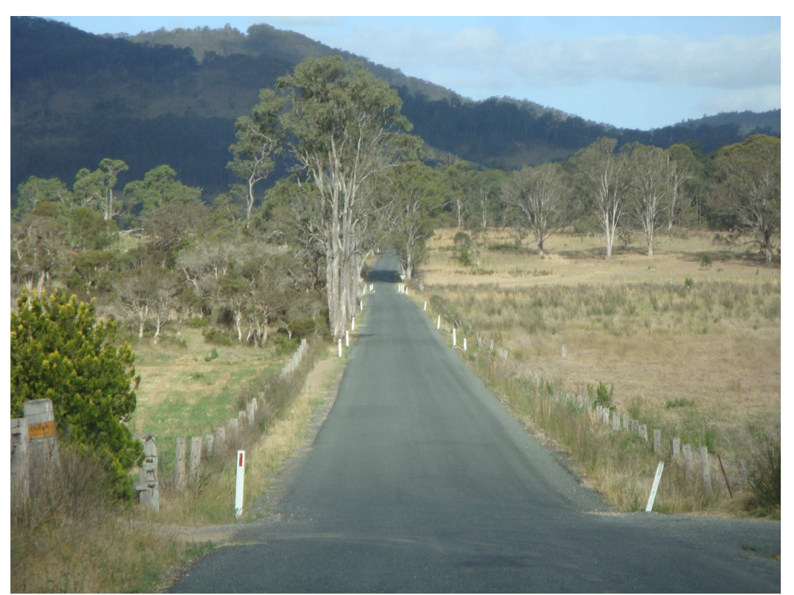
Corner of Wenham Cox Road & Bowens Road Stratford Township area, right hand side will be Stratford Coal's next open cut pit, should they be approved. We hope not!