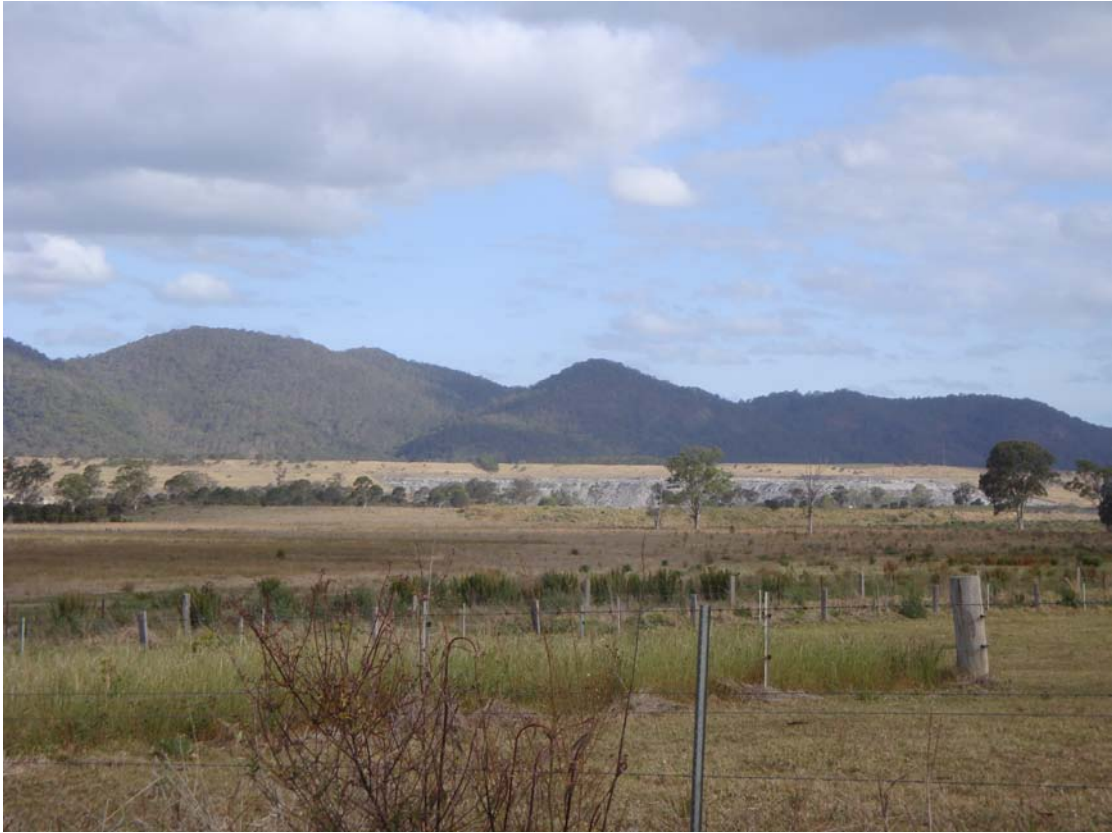
Stratford Coal moving closer to Bowens Road and destroying more valley. This entire area will be open cut, if approved & remove Bowens Road currently, rediverting Road.