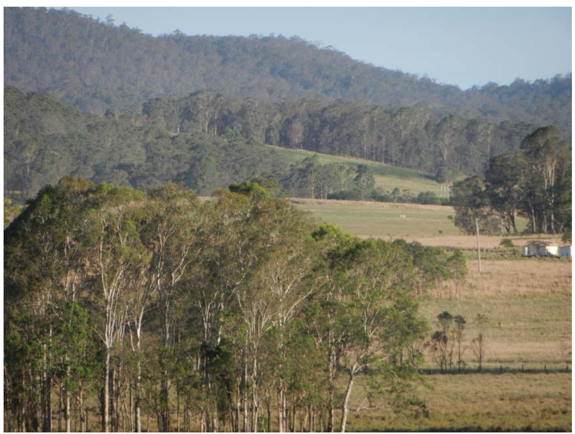
Looking south imagining the coal mine that is moving north open cutting this area, should Government authorise Stratford Coal to continue to operate.