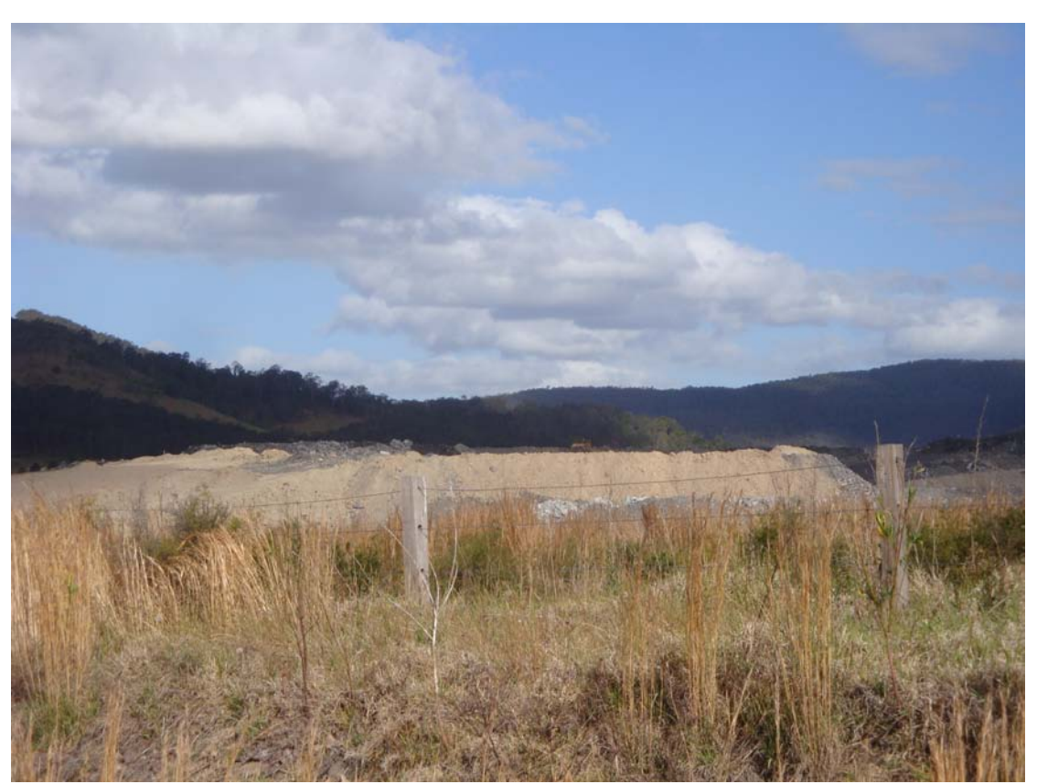
Standing on Wenham Cox's Road looking at overburden of Stratford Coal and open cut mine.