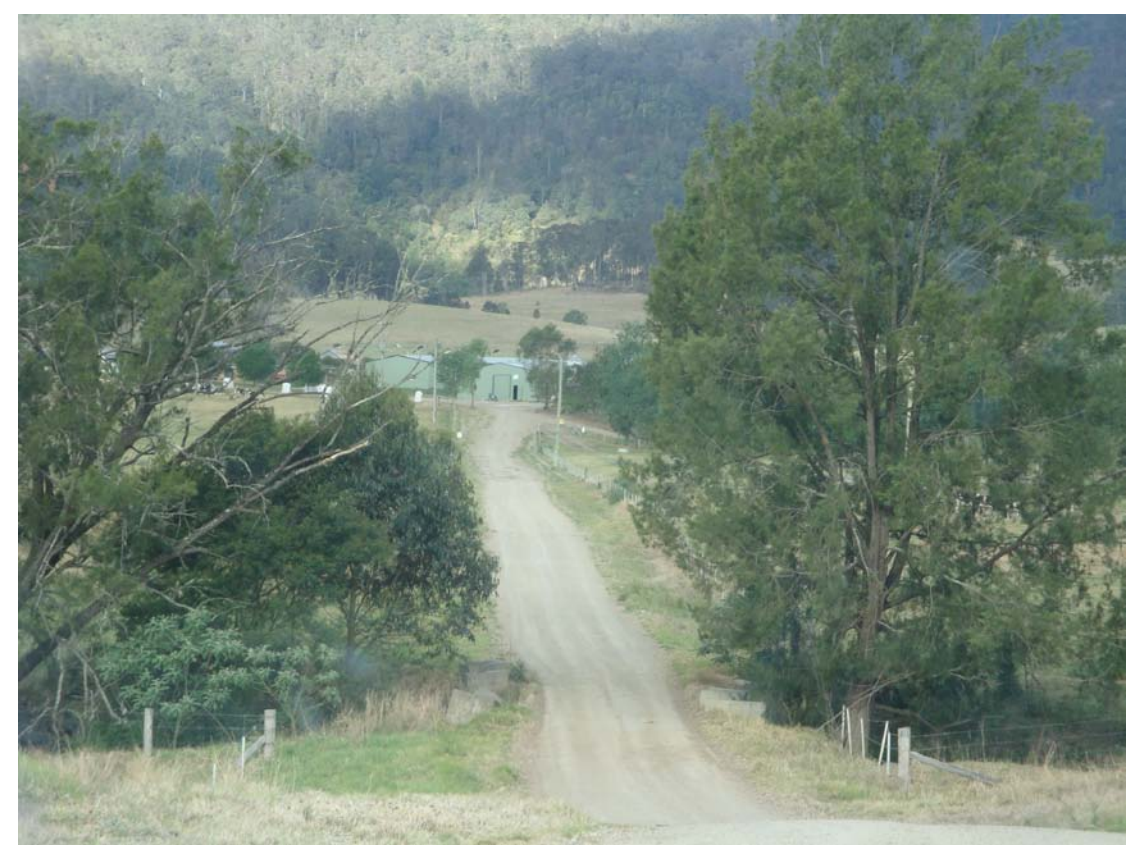
Another Dairy farm business – 'Death by mining' at Stratford. Our valley being open cut for what? "Short term coal revenue", leaving us all a legacy of a mining toxic wasteland.

Wyndam Cox's Road. View of Stratford Coal's overburden and side of pit. The massive landmass being dug up and destroyed for small coal deposits and short term gain. Mining companies "minimal, insignificant, unlikely impacts" are false!