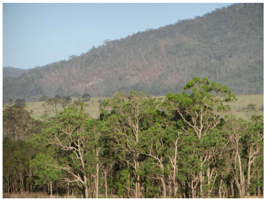
Our valley not impacted YET! Though mine is moving North into this area.