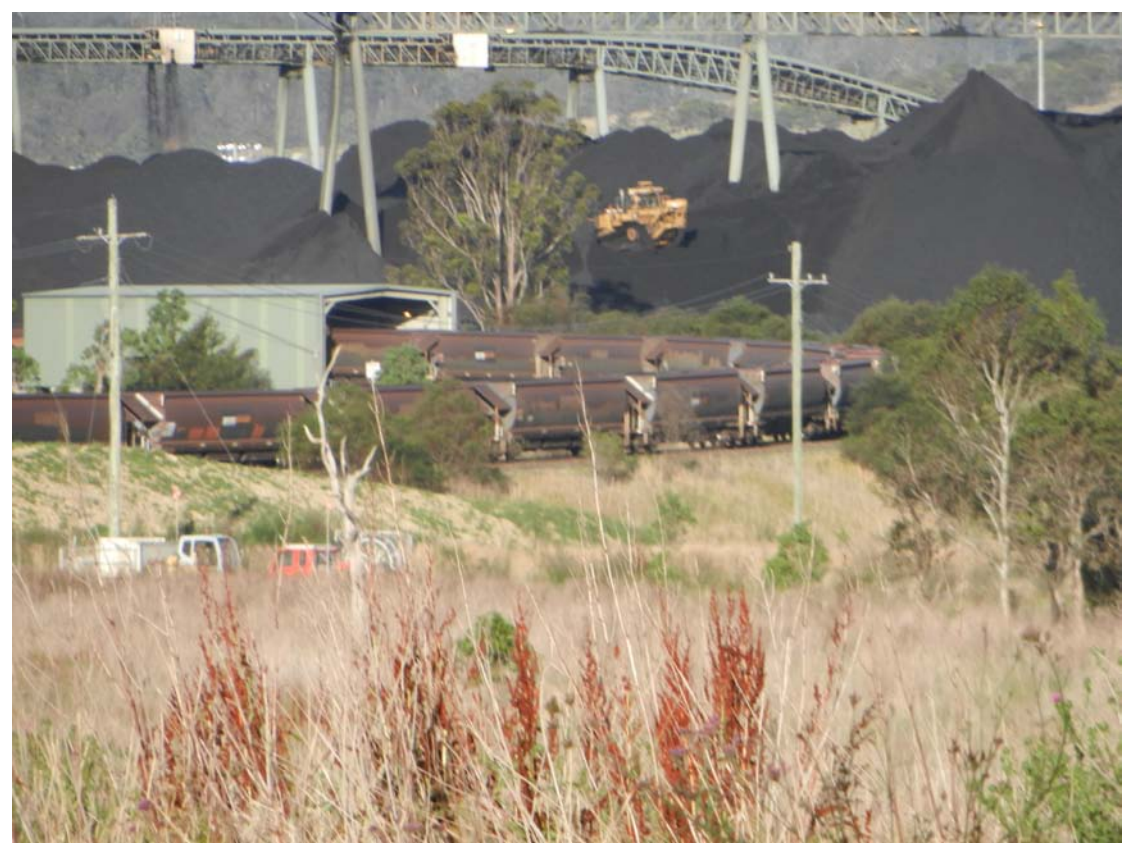
Government approved mining ventures – doing their thing for a 'select few' at the expense of everyone and everything else 'Australian'