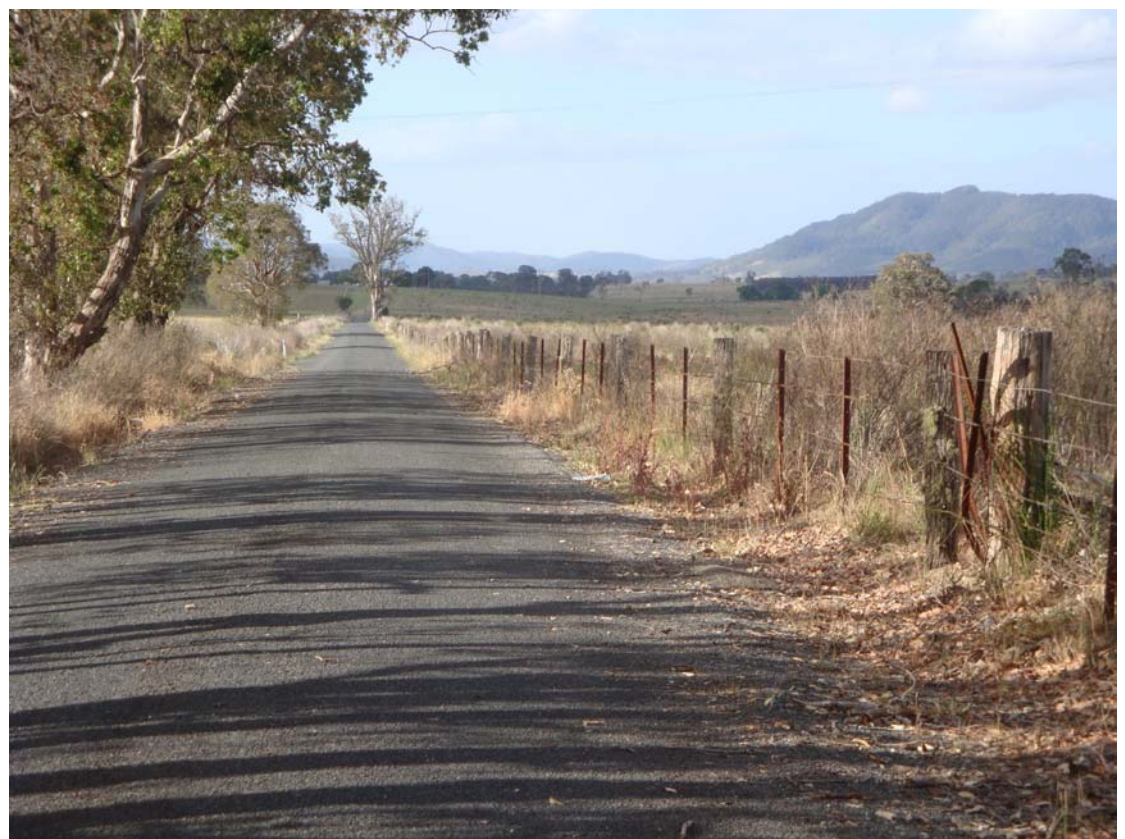
Bowens Road, Stratford Township area - looking towards Wyndam Cox's Road. Mine seeks to re-divert Bowens road and open cut this area - if approved.