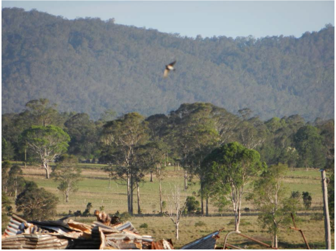
An Eagle looking down on an altering valley (near old piggery) at Stratford area.