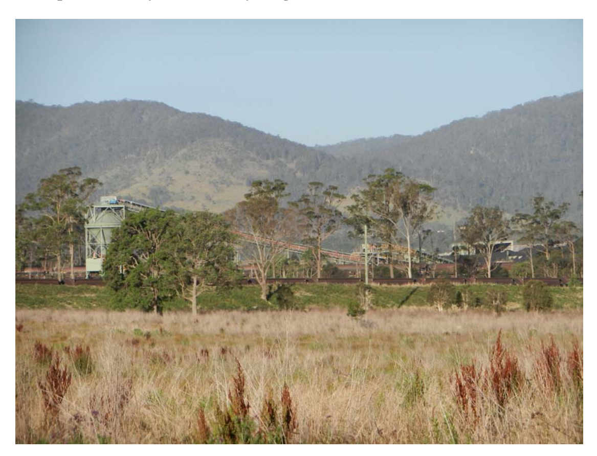
Stratford Coal works depot. Our valley, our future is now owned by China.