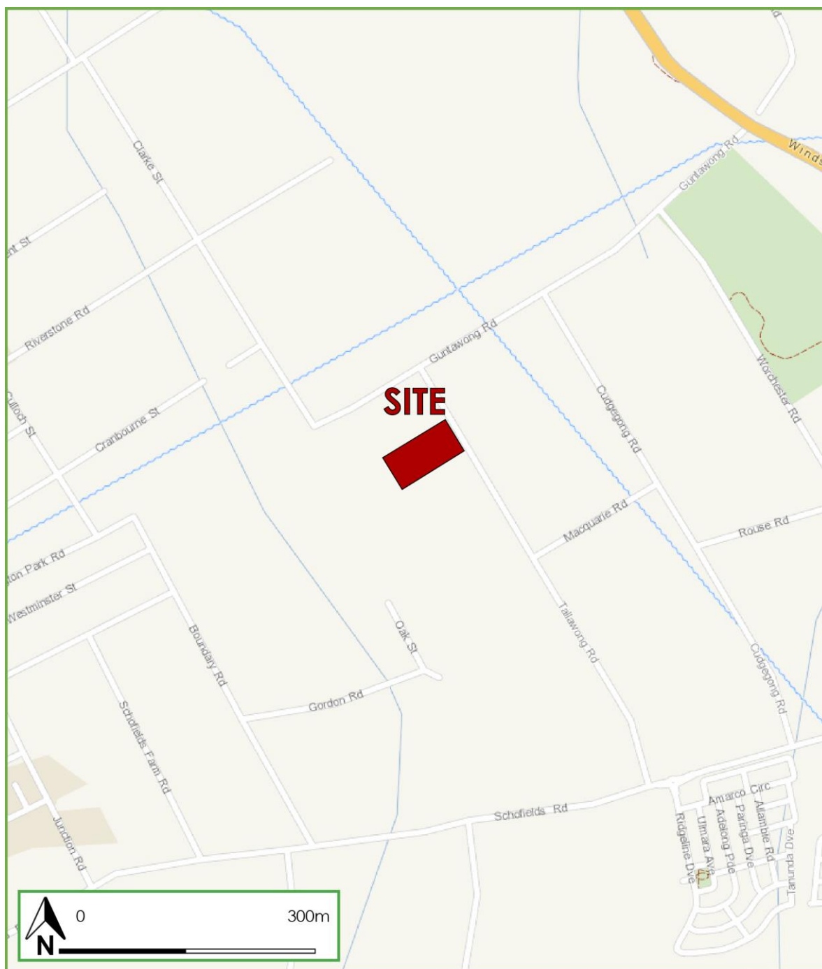
Figure 1: Location Plan