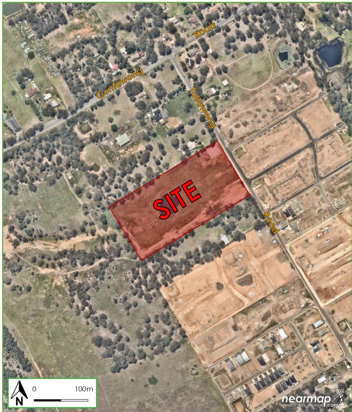
Figure 2: Site Plan