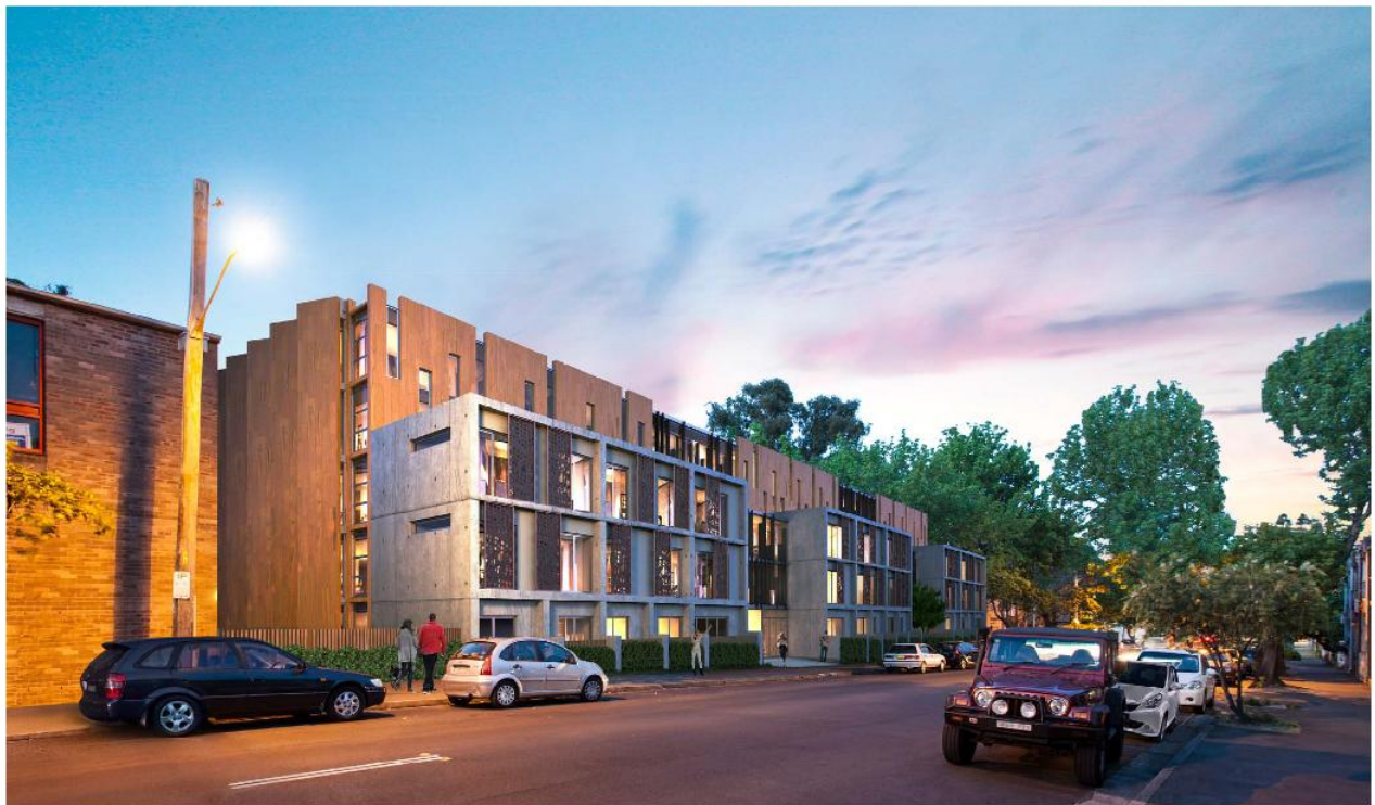
S75w Submission OCTOBER 2013 ABERCROMBIE STUDENT ACCOMODATION View from Abercrombie Street (without existing trees)

I object to these modifications for the following reasons:-