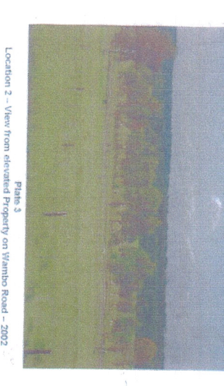
Plate 3 Location 2 – View from elevated Property on Wambo Road – 2002

Plate 4 Location 2 - View from elevated property on Wambo Road - 2008