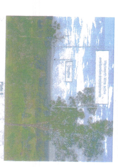
Plate 6 Location 3 - View from elevated property on Infer Road - 2002