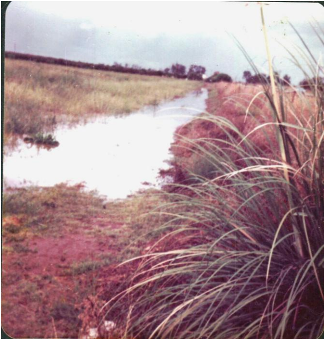
Farm 132 flooding along western boundary