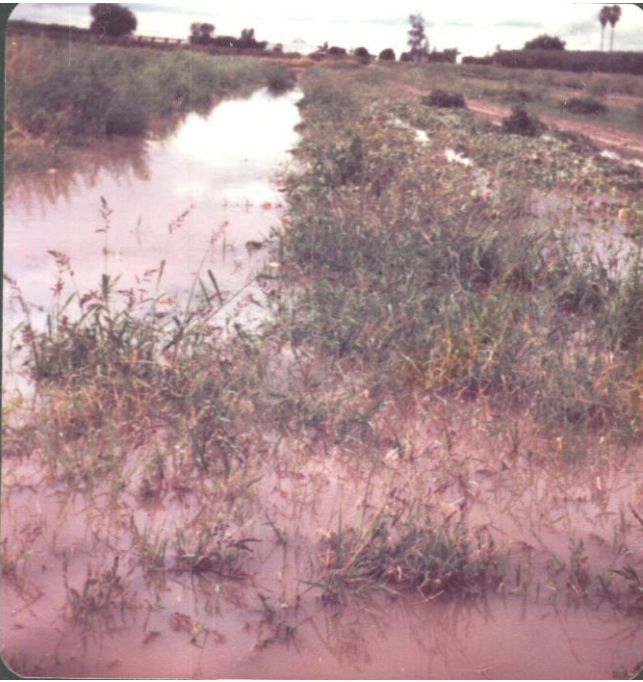
Flooding along north side of Farm 132 driveway