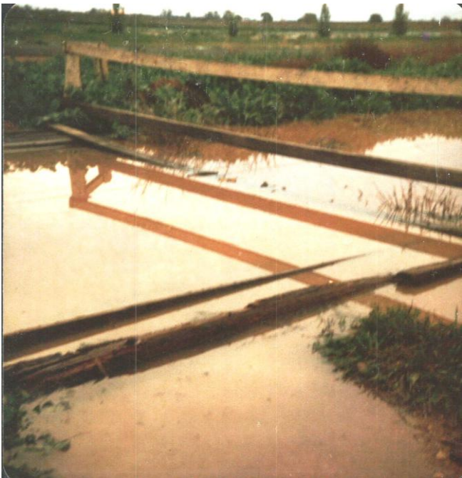
MI drainage channel at Farm 132 Kidman Way entrance