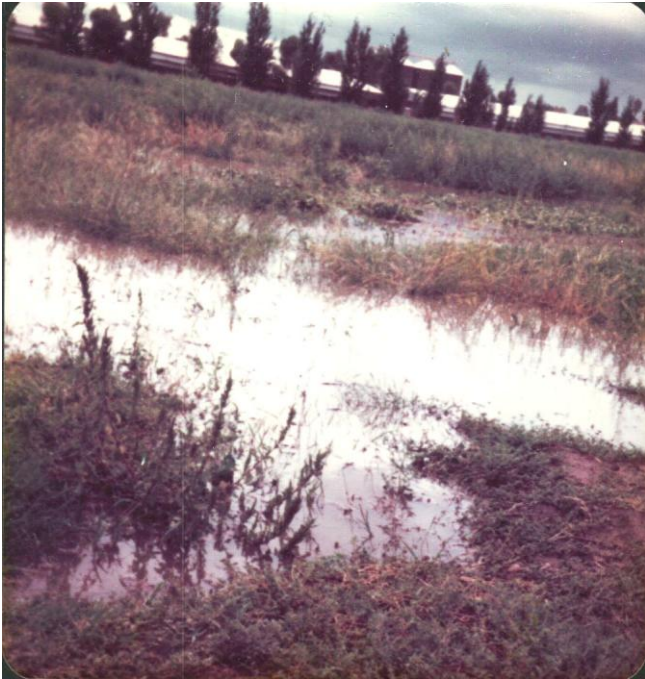
View to north east from Farm 132 entrance includes now demolished Bartter laying sheds