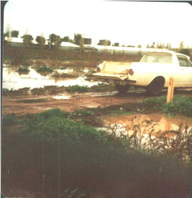
Inside Farm 132 entrance from Kidman Way - Bartter laying sheds in background