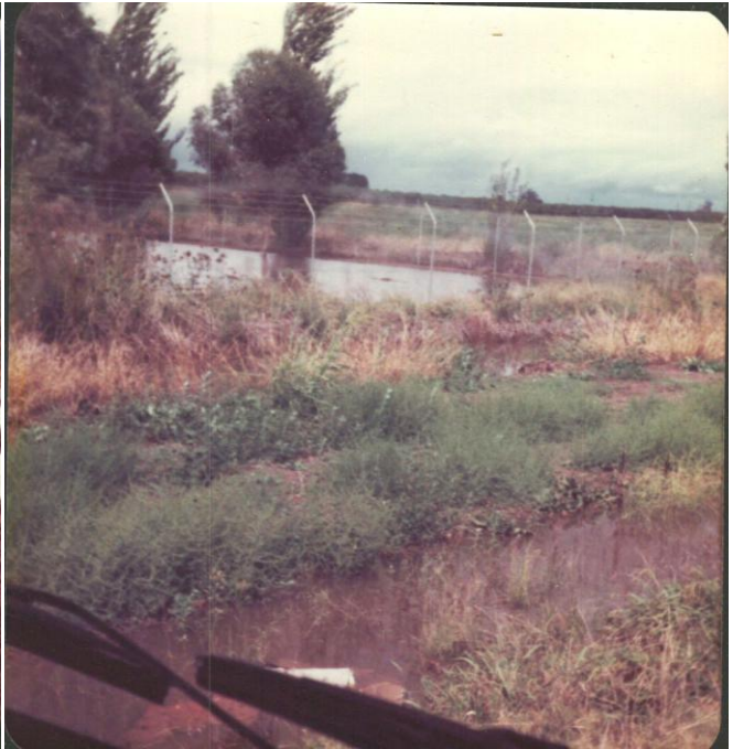
Flooded south west corner of Bartters' farm Lot 2088DP720206 from Kidman Way