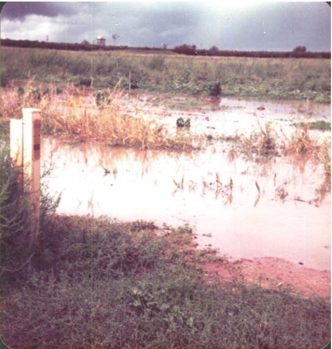
View to south west of Farm 132 from Kidman Way entrance