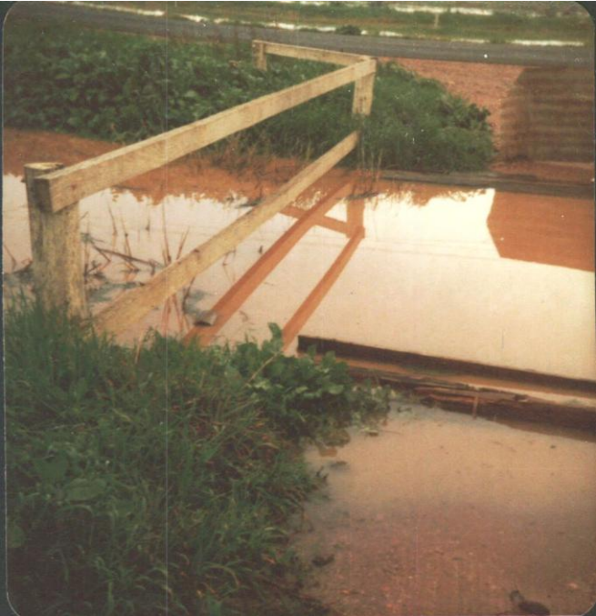
MI drainage channel - view from Farm 132 west to south west of Farm 132