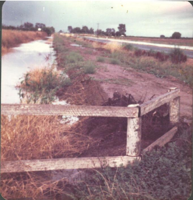
MI drainage channel - view from Farm 132 entrance to south. Kidman Way on right