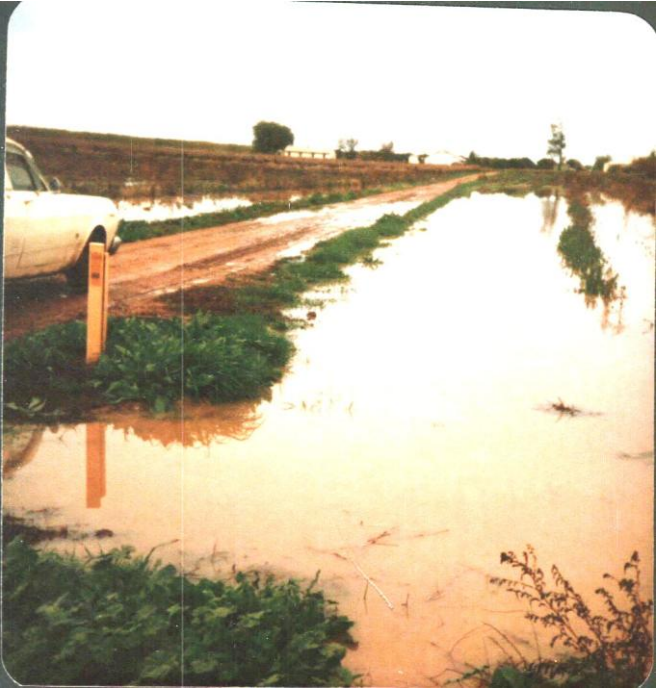
Looking west along Farm 132 driveway to Kidman Way Driveway to east from Farm 132 Kidman Way entrance