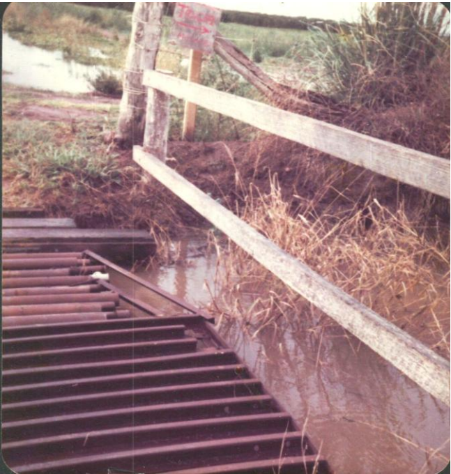
Bridge at Farm 132 entrance over MI drainage channel