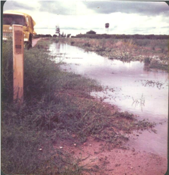
Flooding south of Farm 132 driveway looking eastwards