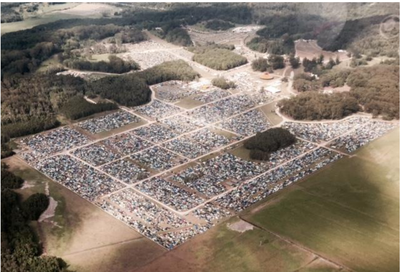
Figure 5 Falls Festival January 1, 2017, North Byron Parklands camping area : 22,500 patrons at the event

██████████ ██████████████████ ████████████████████