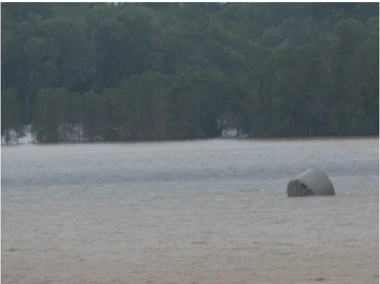
Figure 3 North Byron Parklands water tank

Please note that as shown in the attached stream gauge for Crabbes Creek at Wooyung Rd, the water levels have fallen about 1 metre from their peak by the time these photos were taken.