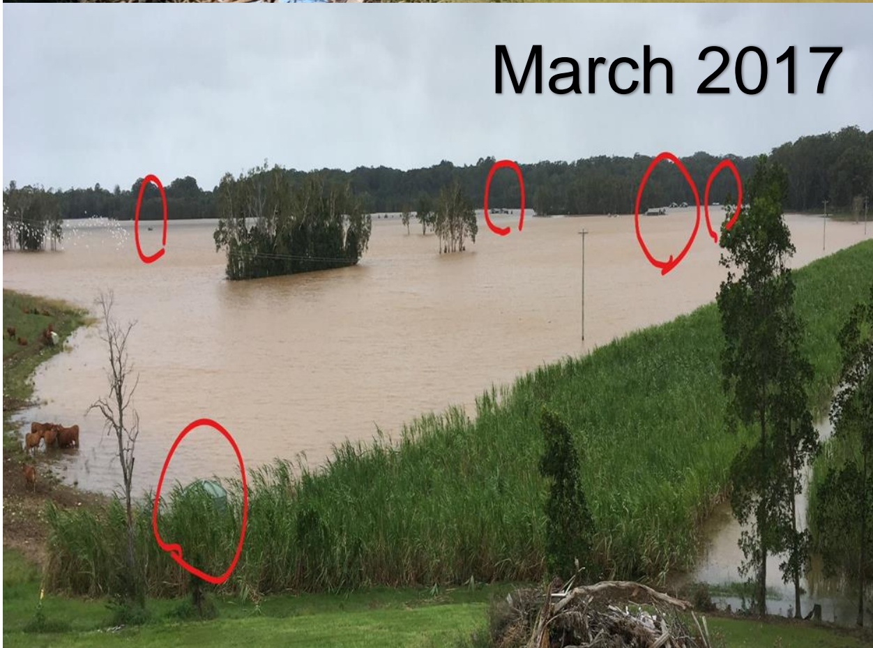
Figure 1 North Byron Parklands camping area March 31, 2017

Circled objects indicate Campground Amenities Blocks 1, 2, 5 and 6 along with associated water tanks that have floated away. These can be seen more easily in the following two photos.