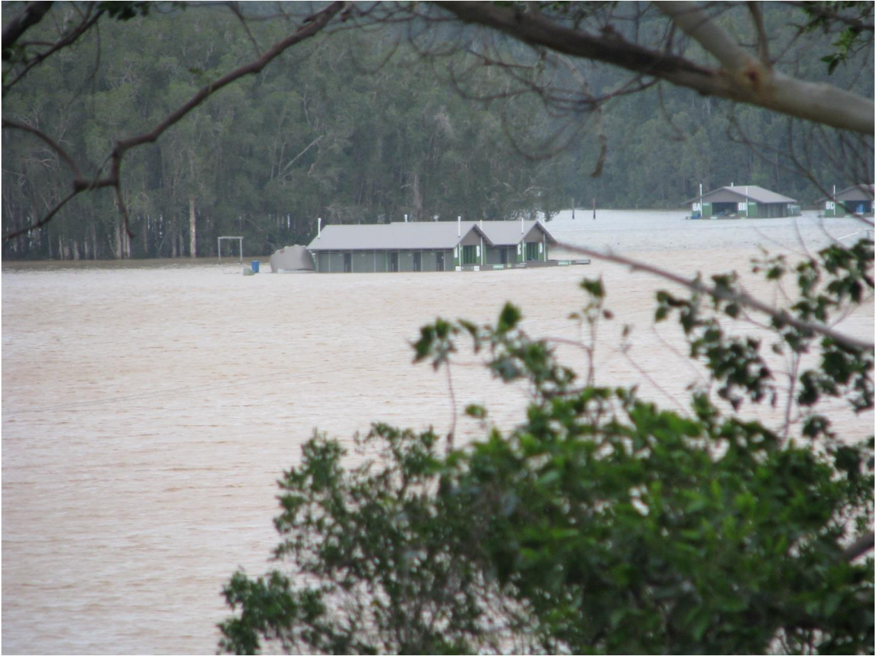
Figure 2 North Byron Parklands Amenities Block 1, March 31, 2017.