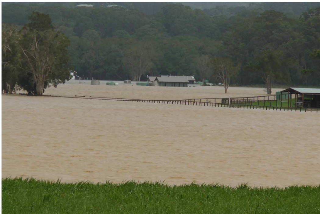
Photo 3 – Wooyung Road looking south towards toilets, Quaker hay shed and camping area (31 March 2017)

Taking into account previous concerns raised by NSW Police (with regard to the inability to evacuate the site within 8 hours), and the rapid rise of the floodwater as evidenced by the stream gauges (shown below in Figure 1), concerns are raised with regard to the proponent's responsibility to ensure the safety of patrons, should a cultural event occur at the same time as a large flooding event. Concerns are also raised as to whether an extension on this site is in the public interest, given the perceived inability to provide safe evacuation from the site during a flood.