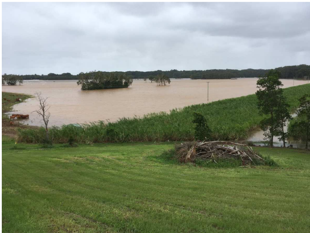
Photo 2 – Taken from a property on Wooyung Road looking south to the NBP camping area (31 March 2017)