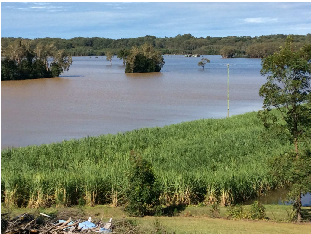
Photo 6 – Flooding impacts showing toilet facilities of campground (June 2016)

Given the recent Land and Environment Court ruling ( Billinudgel Property Pty Ltd v Minister for Planning [2016] NSWLEC 139 ) consideration needs to be given to powers of the Minister in terms of his ability to modify the consent by way of further extending the trial period by 20 months.*