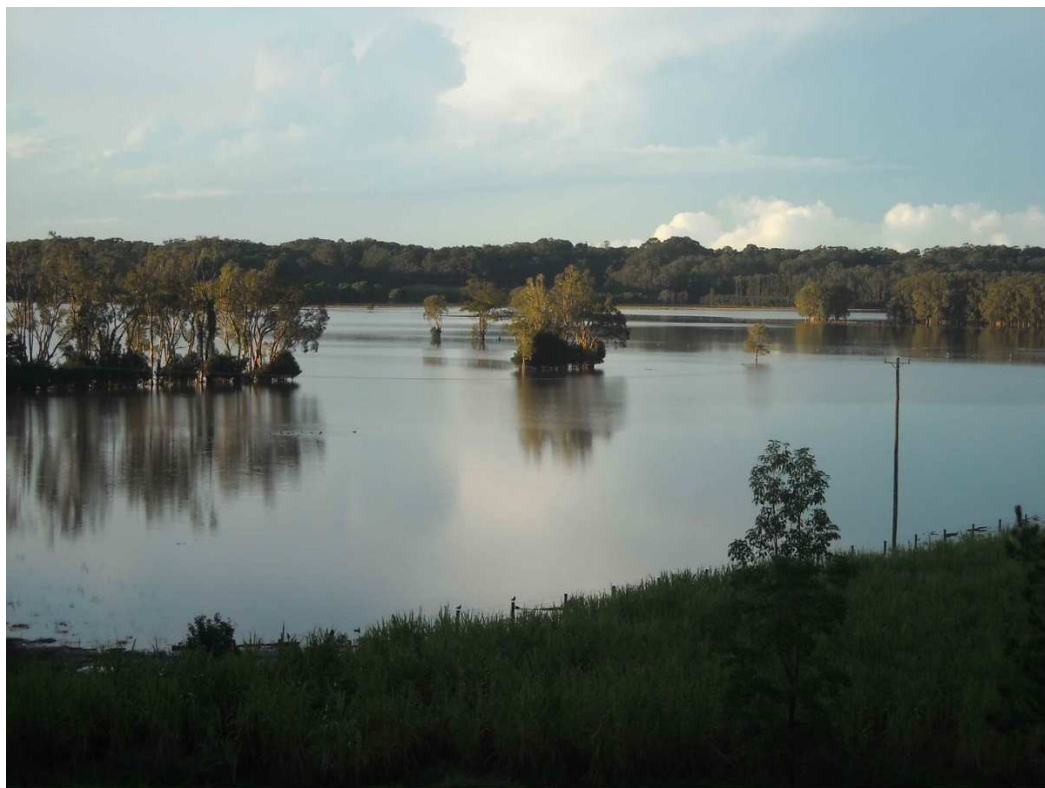
Photo 4 - Looking across to North Byron Parklands camping area taken from residence on Wooyung Rd (May 2009)

Noted below are additional photos of the subject site, which indicate level impact of arising from heavy rain (not a major flood) upon the site, which must be taken into consideration in terms of the ability of the proponent to safely and efficiently evacuate patrons from the site.