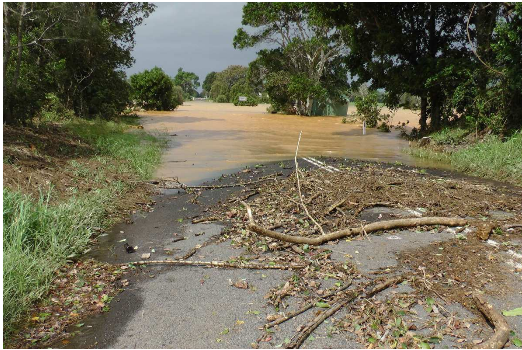
Photo 3 – Wooyung Road looking east to the junction of Ti-Tree Road (31 March 2017). Note – the water tank behind the vegetation at the edge of road has been washed more than 500m from the NBP camping ground.