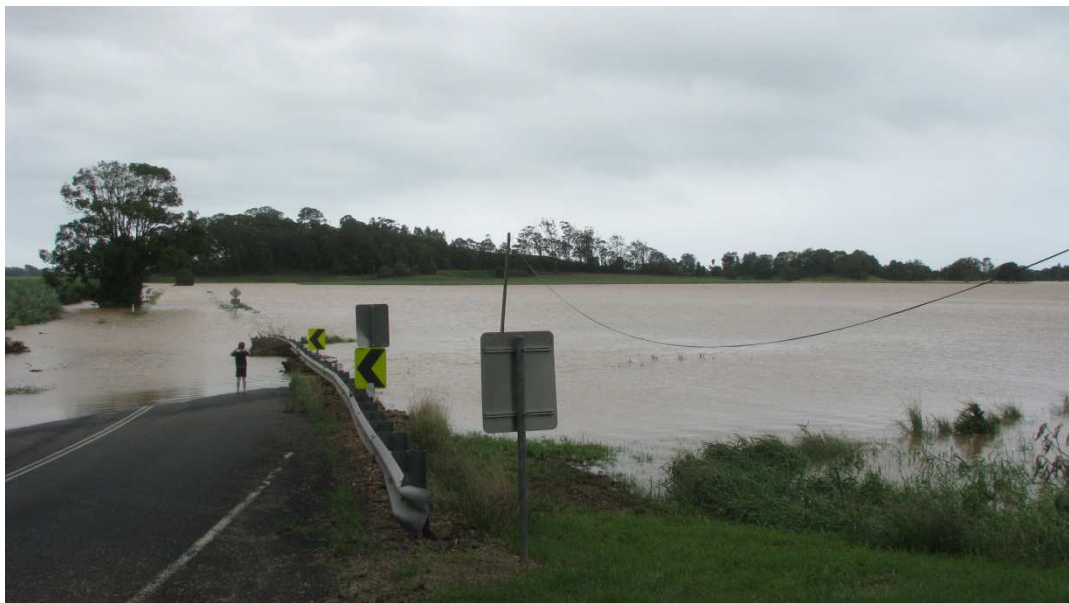
Photo 1 – Wooyung Road north west of the site looking north east (31 March 2017)

The safety of patrons is raised as a concern with regard to the evacuation of over 30,000 people from the site during a flood event. Photos are provided below which indicate the level of inundation during the recent floods (31 March 2017) affecting the region.