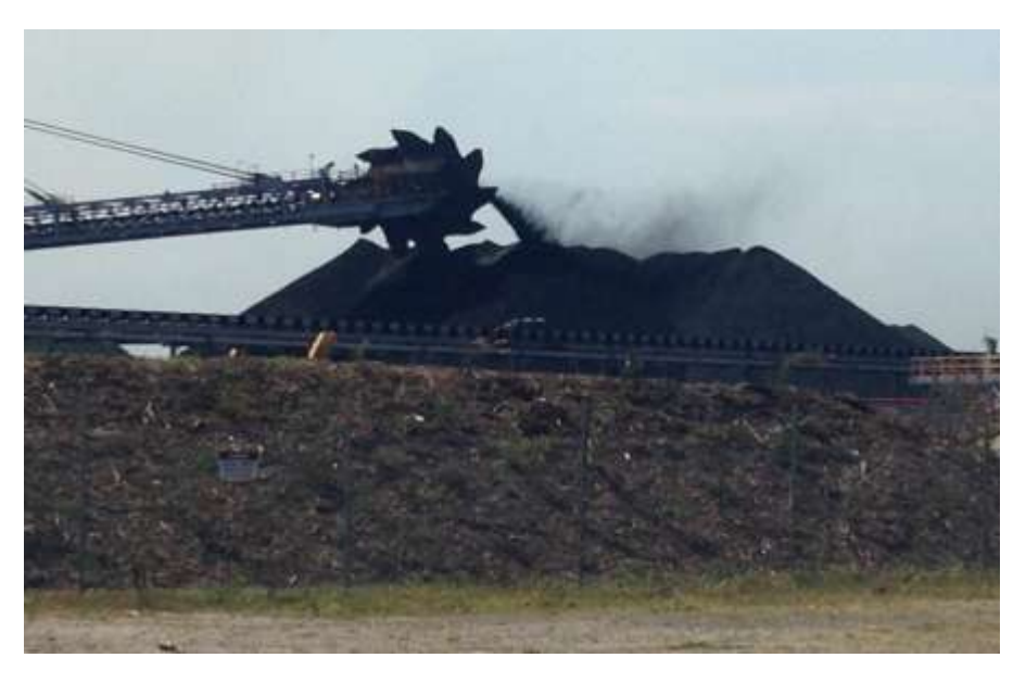
Figure 2. Kooragang coal loader operating in a dry westerly wind